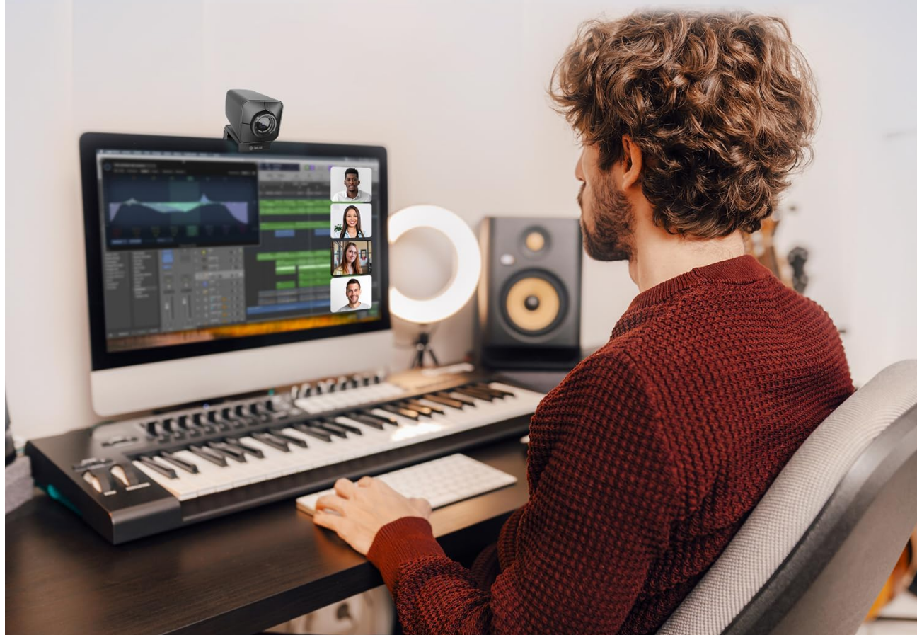
Image: The TOALLIN SC100U 4K Webcam mounted on a monitor, connected to a computer, ready for use in streaming or video calls.

Large 1/2.5" CMOS sensor, up to 12 Mega Pixels high resolution outputs