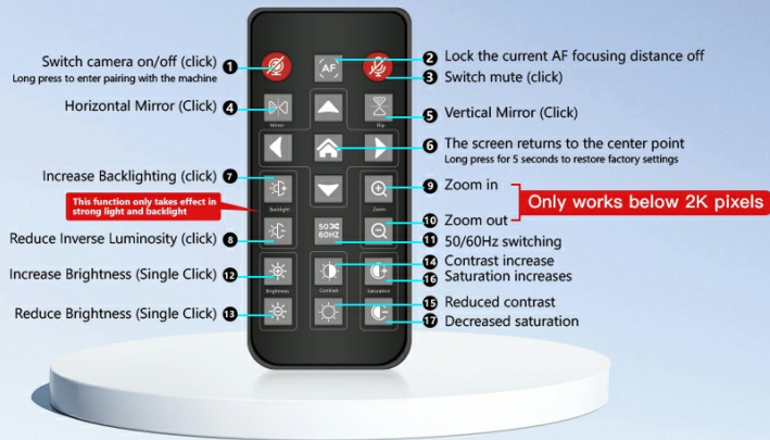
Image: The remote control for the TOALLIN SC100U 4K Webcam, showing all its buttons and their respective functions for camera adjustment.