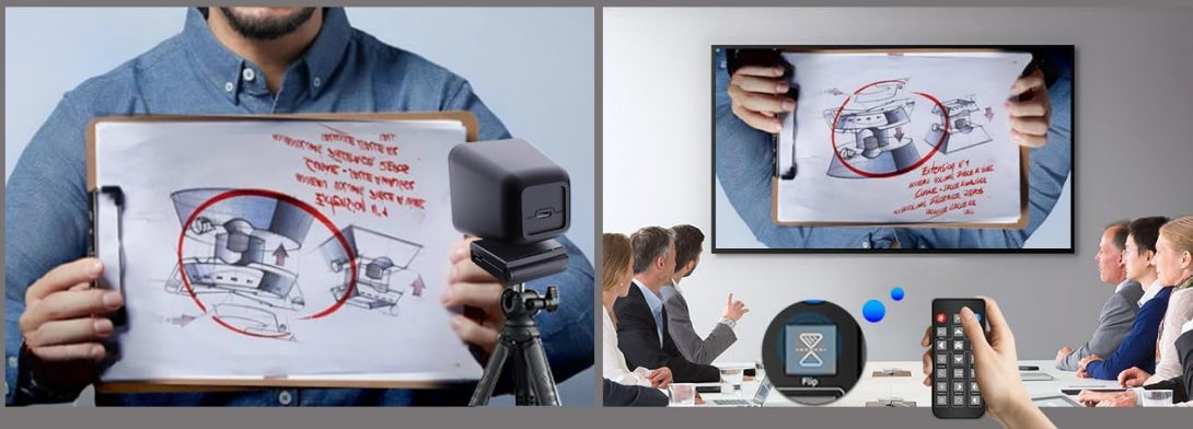
Image: Demonstration of the webcam's mirror and flip functions, showing how the image can be horizontally or vertically inverted using the remote control.