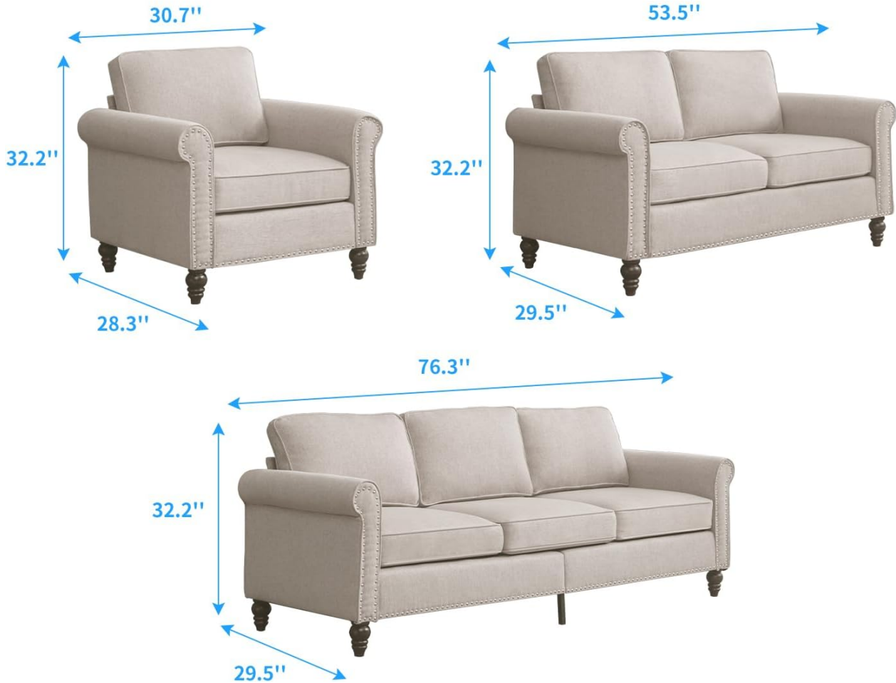
Image: Detailed dimensions for the armchair (30.7"W x 32.2"H x 28.3"D), loveseat (53.5"W x 32.2"H x 29.5"D), and 3-seater sofa (76.3"W x 32.2"H x 29.5"D).