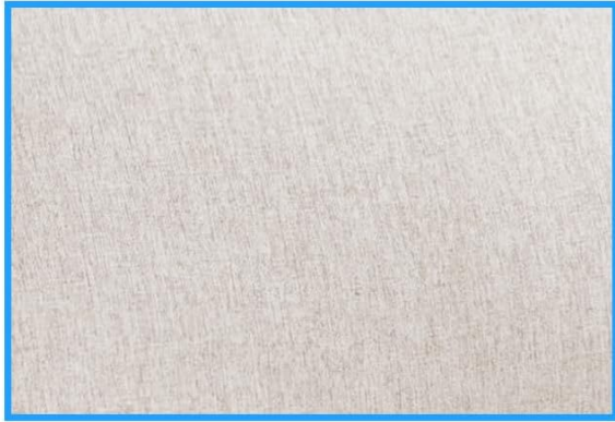
High Quality Fabric