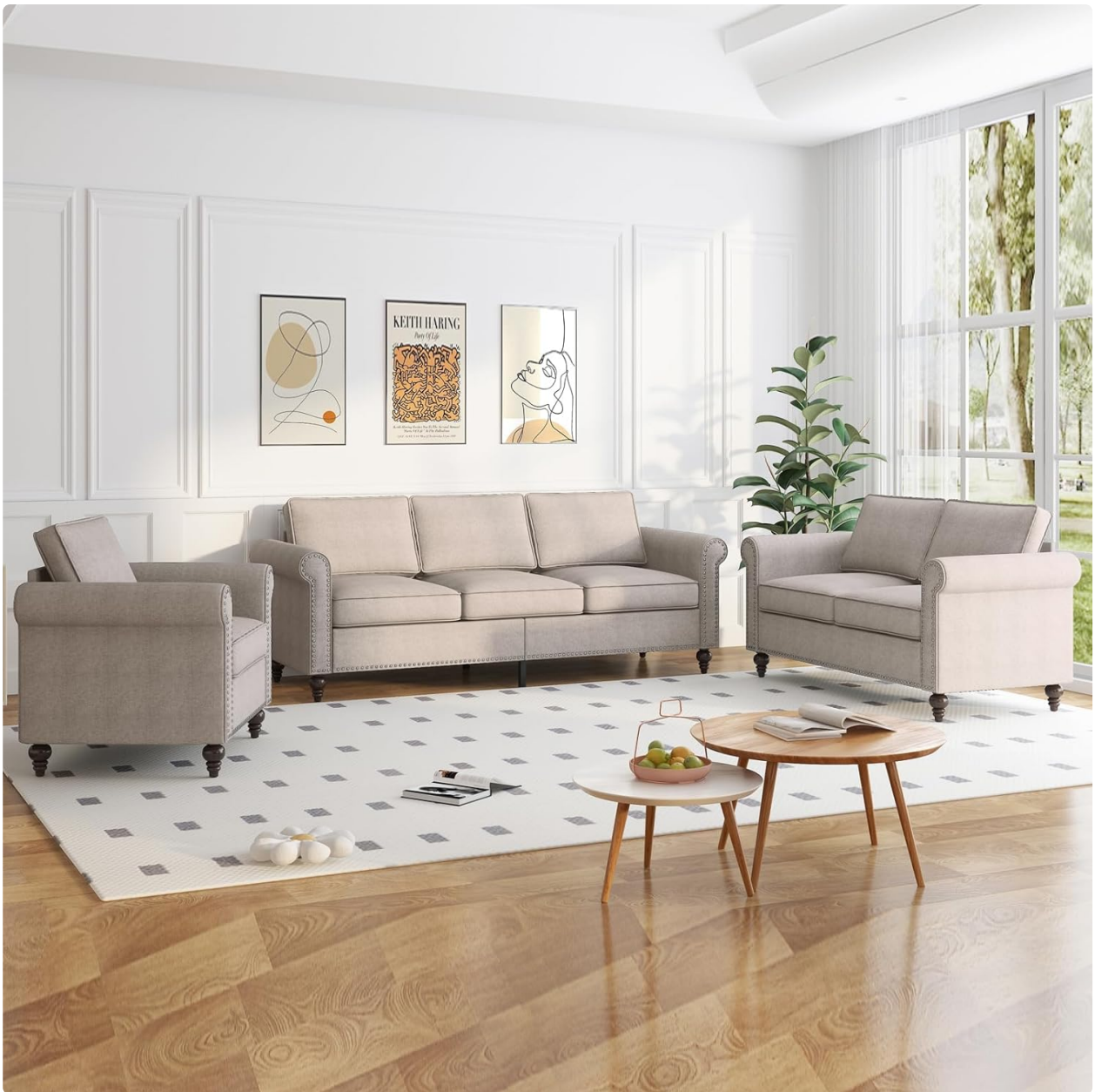
Image: The complete 3-piece ADOWORE sofa set, including a 3-seater sofa, a loveseat, and an armchair, arranged in a contemporary living room with a rug and coffee table.