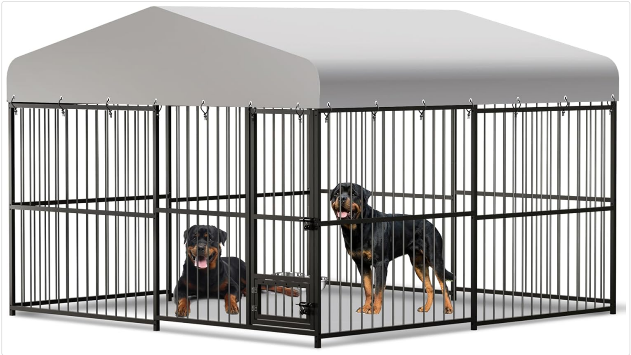
Figure 5: Pets utilizing the kennel. Two Rottweiler dogs are shown comfortably inside the CuisinSmart Large Outdoor Dog Kennel, highlighting the spacious interior suitable for large breeds. The image also shows the feeding door with bowls.