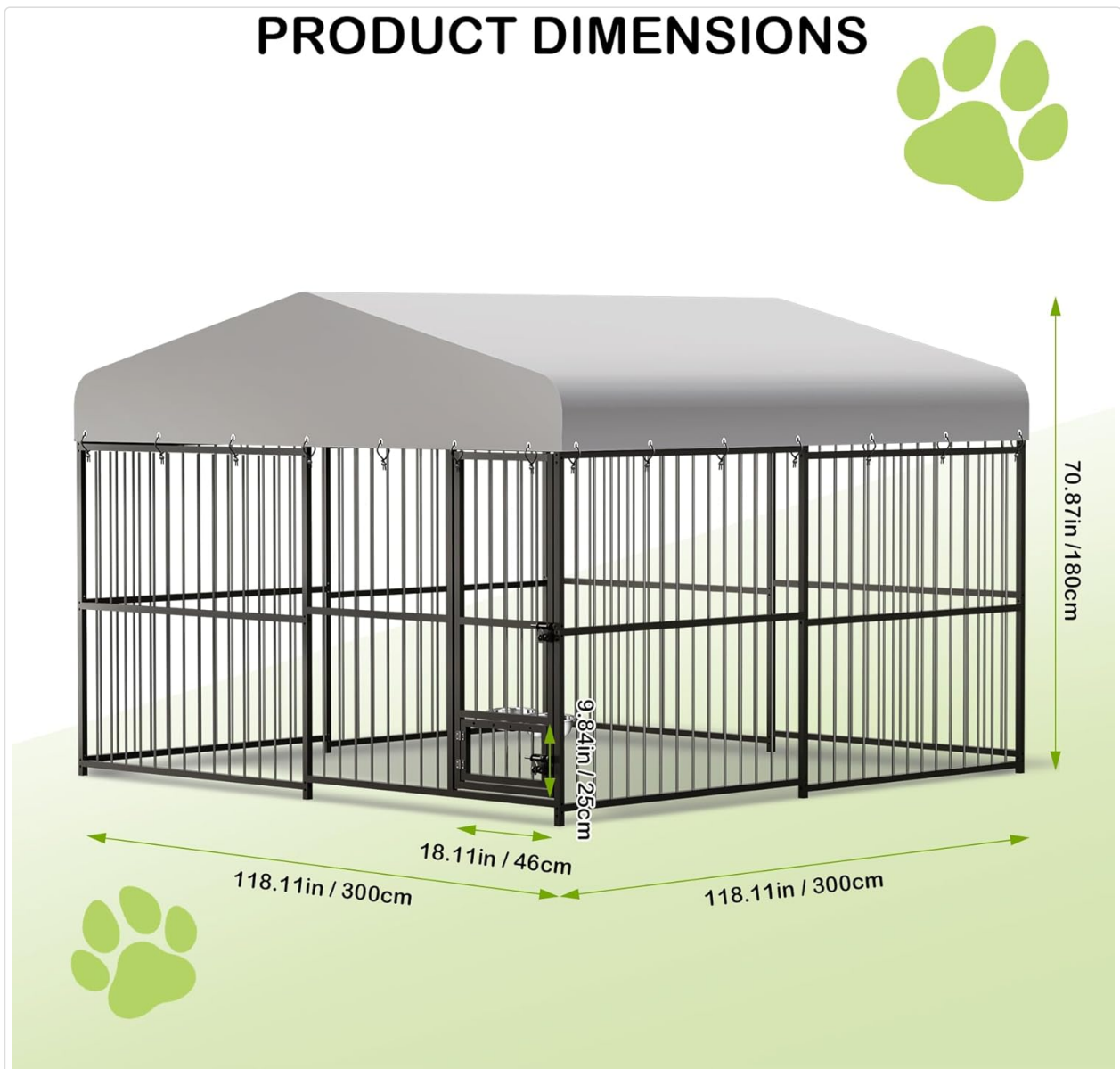
Figure 3: Dimensions of the CuisinSmart Large Outdoor Dog Kennel. This diagram illustrates the key dimensions of the CuisinSmart Large Outdoor Dog Kennel. The overall dimensions are 118.11 inches (300 cm) in length and width, and 70.87 inches (180 cm) in height. The feeding door measures 18.11 inches (46 cm) in length and 9.84 inches (25 cm) in width.