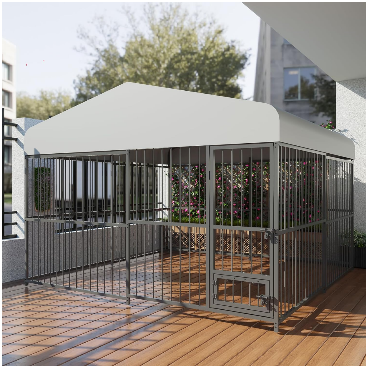
Figure 1: CuisinSmart Large Outdoor Dog Kennel assembled on a patio. This image shows the fully assembled CuisinSmart Large Outdoor Dog Kennel, featuring its robust metal frame, waterproof roof cover, and integrated feeding door. The kennel is designed for outdoor use, providing a secure and comfortable space for pets.