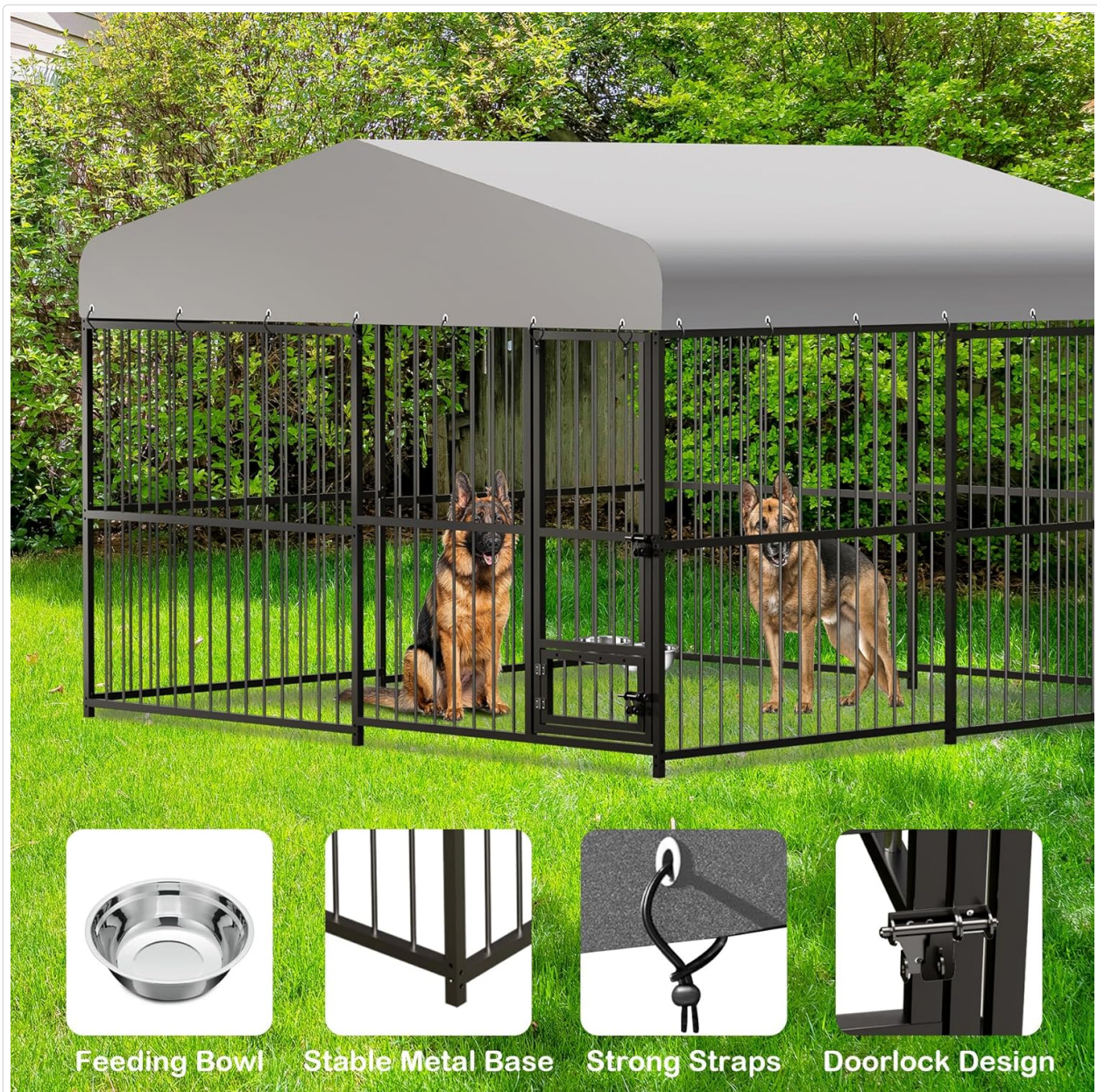
Figure 2: Key components of the kennel. This image provides detailed views of the kennel's essential components: a stainless steel feeding bowl, a stable metal base for durability, strong straps for securing the cover, and a robust door lock design for enhanced security.