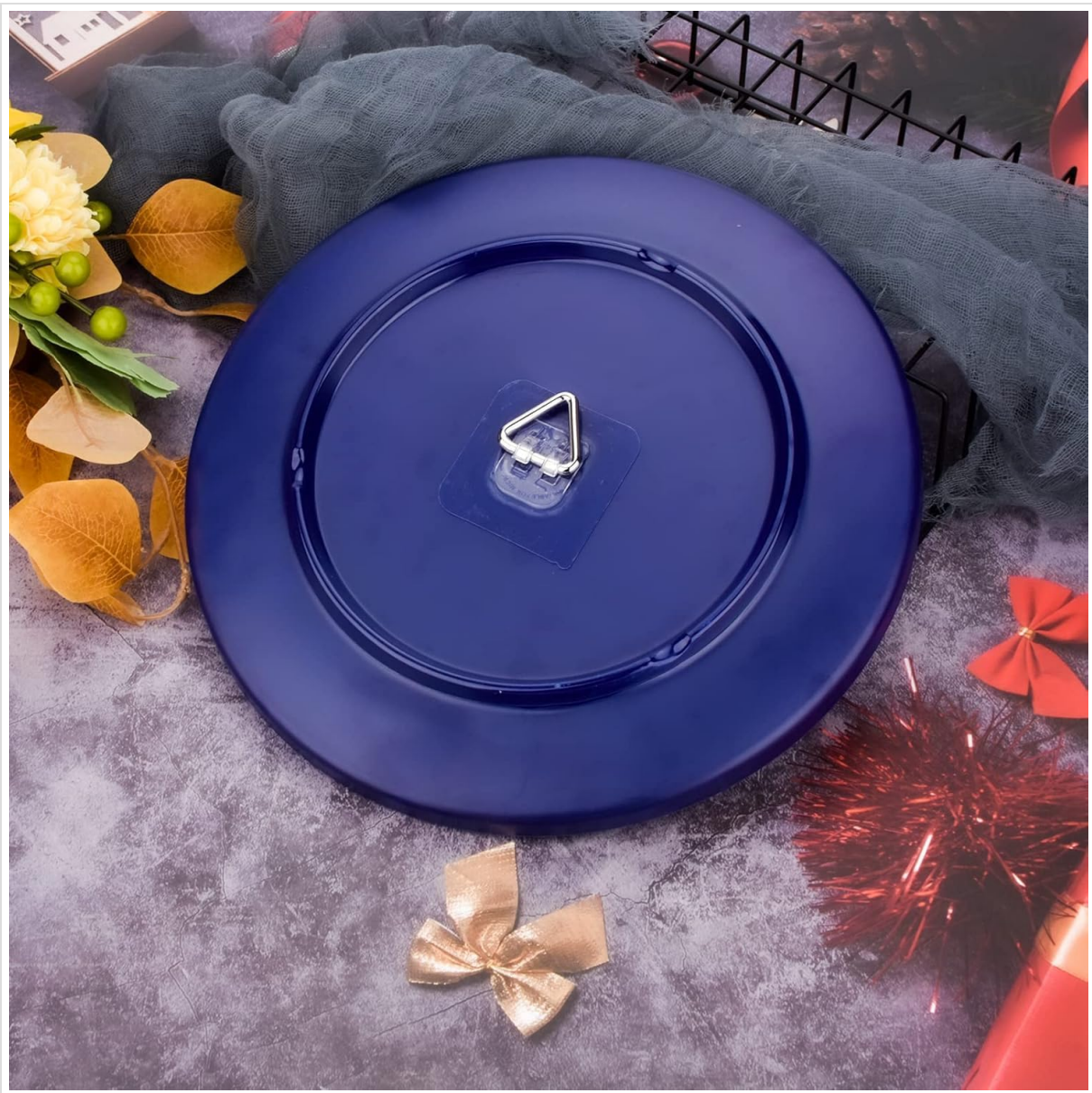
Figure 4: Example of a decorative plate securely hung using the adhesive hanger.