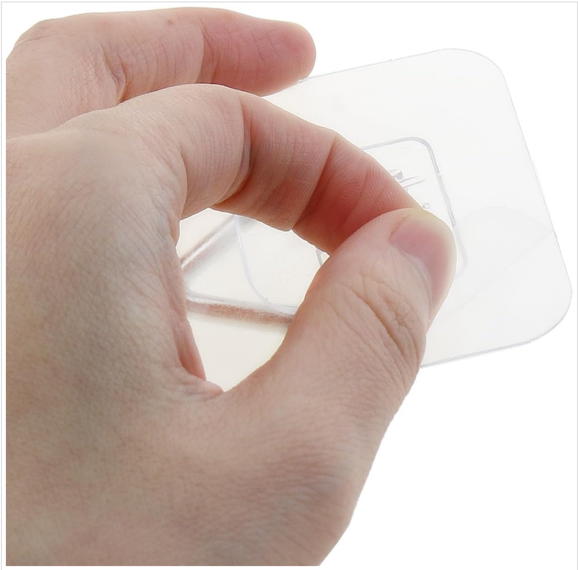
Figure 2: Removing the protective film from the adhesive backing.