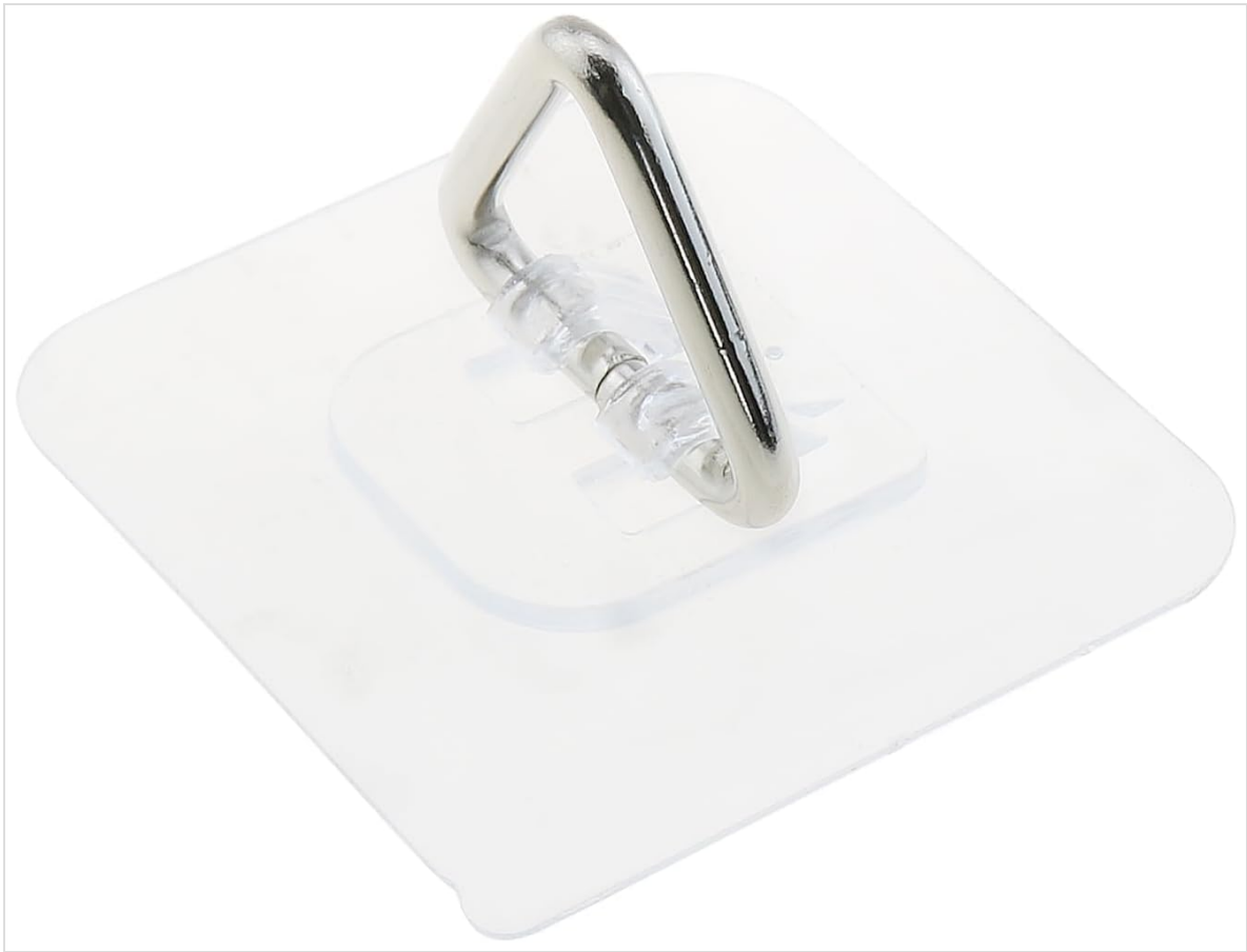
Figure 3: Close-up of the adhesive hanger and hook mechanism.