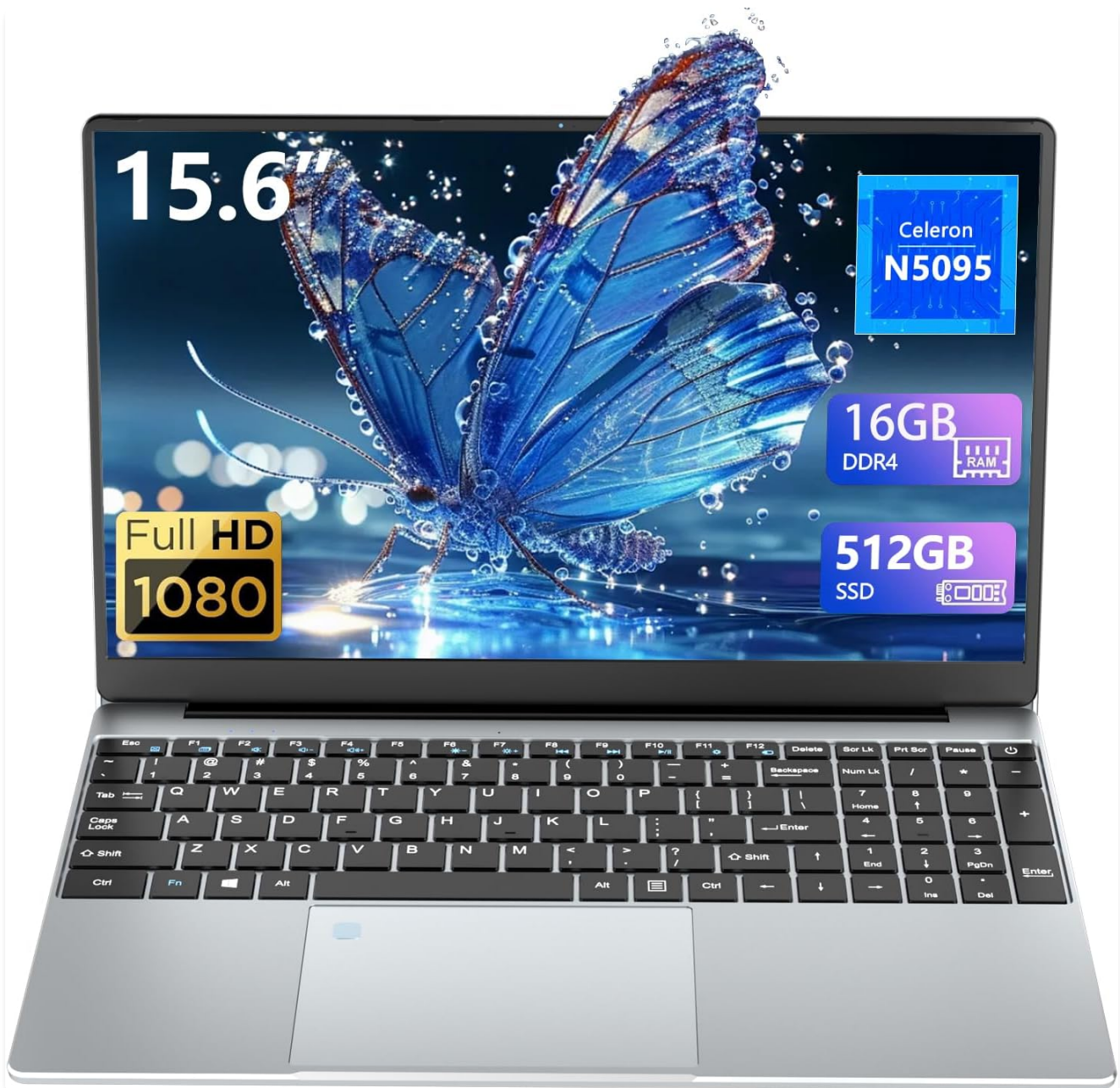
Figure 1: DUNHOO 15.6 Inch Laptop Overview