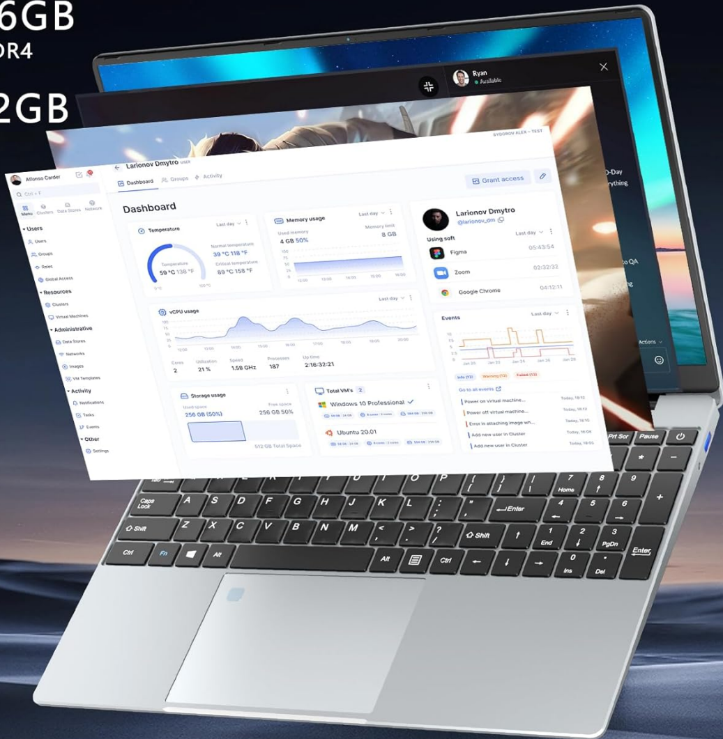
Figure 6: Ample Memory and Storage for Smooth Operation