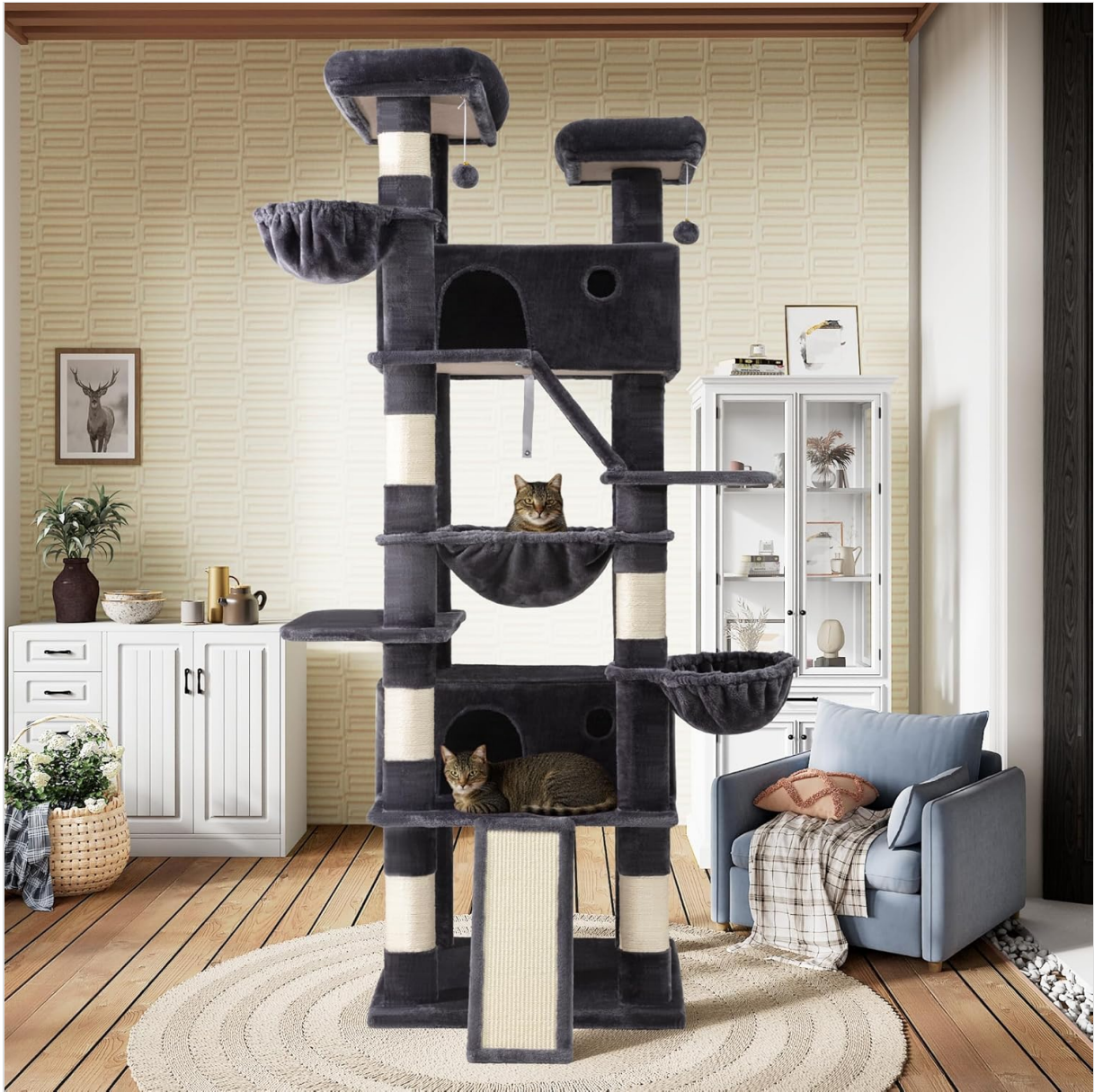
Image: The fully assembled SHA CERLIN cat tree, showcasing its multi-level design with cats resting on perches and inside condos.