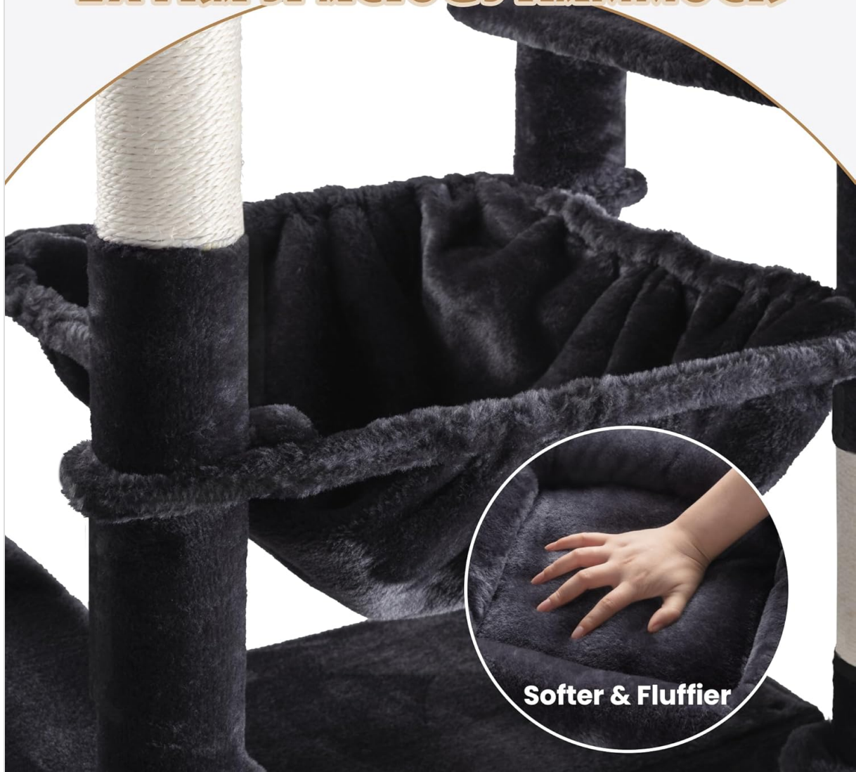
Image: A detailed view of the extra spacious and soft hammock, providing a comfortable resting spot for cats.