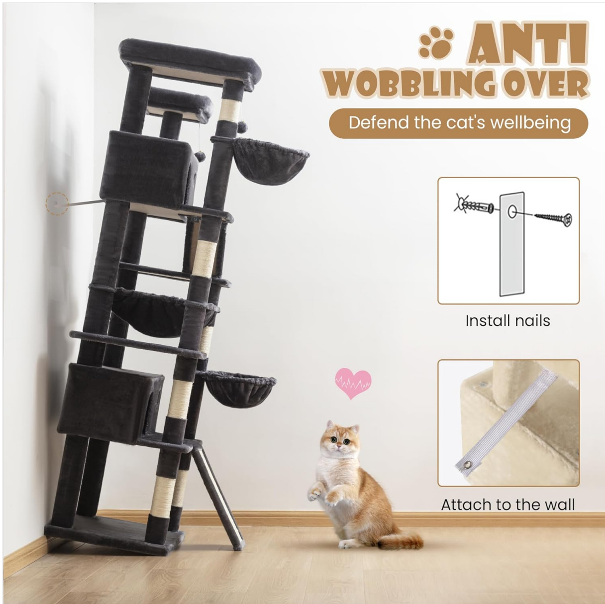
Image: Illustration demonstrating the anti-tip mechanism, showing how to secure the cat tree to a wall using an anchor and strap to prevent wobbling or tipping.