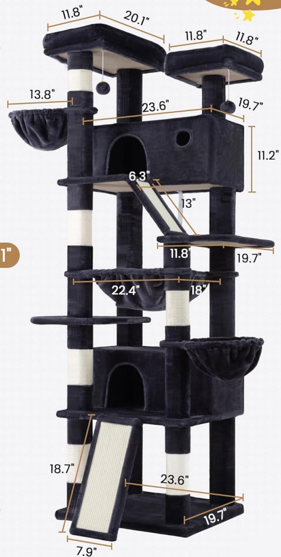
Image: Diagram showing the overall dimensions and weight capacity of the cat tree. The total height is 81.1 inches. Hammock capacity is 22 lbs, other platforms 33 lbs.