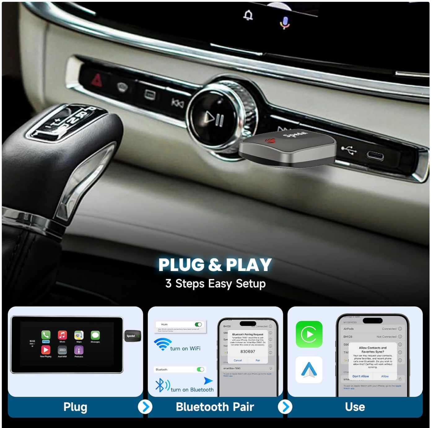
Image 3.1: Visual guide showing the three simple steps to set up the Spedal CL320 adapter: plug into USB, pair via Bluetooth, and start using.

Once the initial connection is established, the adapter will automatically reconnect to your smartphone every time you start your car, providing a hassle-free experience.