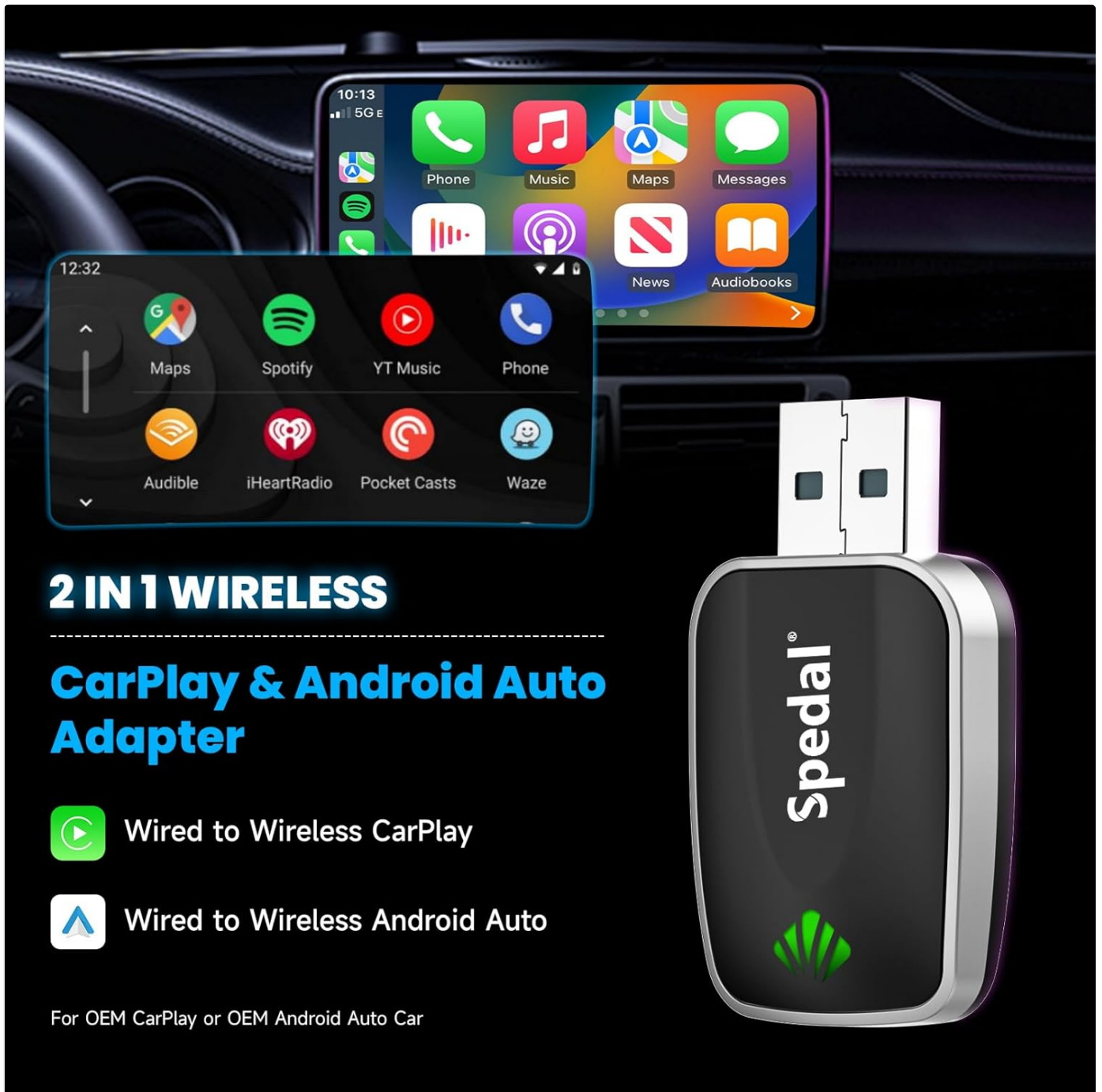
Image 2.1: Spedal CL320 Wireless Adapter with examples of CarPlay and Android Auto interfaces on a car screen.