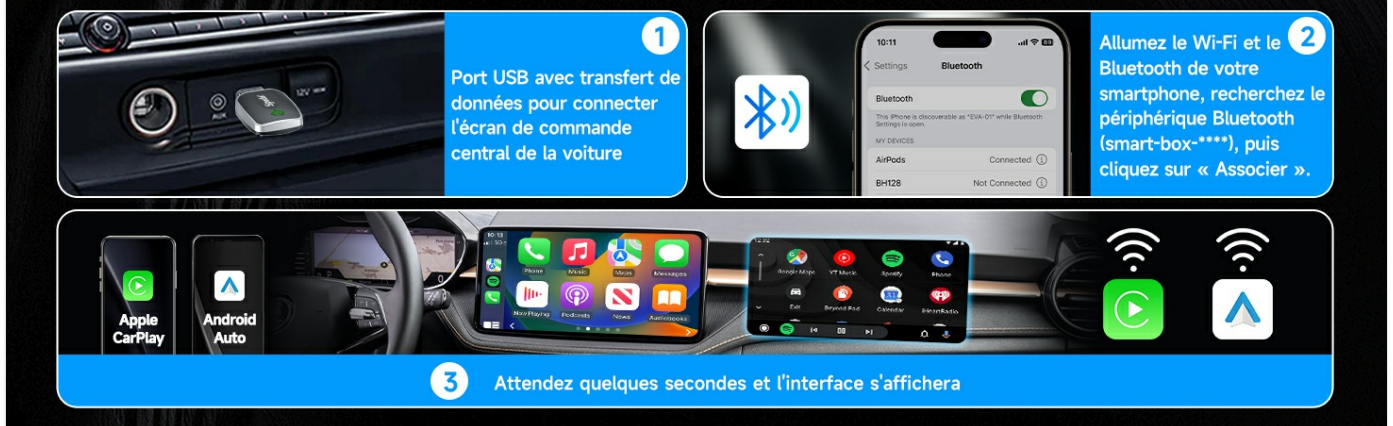
Image 3.2: Illustration of the automatic reconnection feature, showing the adapter connecting to a smartphone and displaying CarPlay on the car screen.