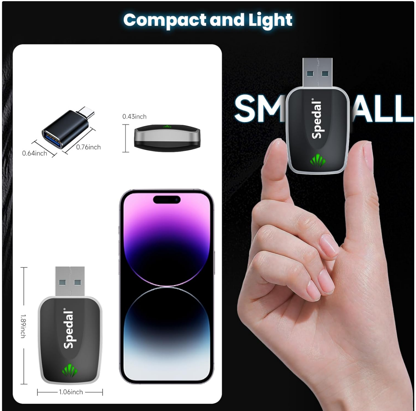
Image 6.1: Visual representation of the compact size and dimensions of the Spedal CL320 adapter.