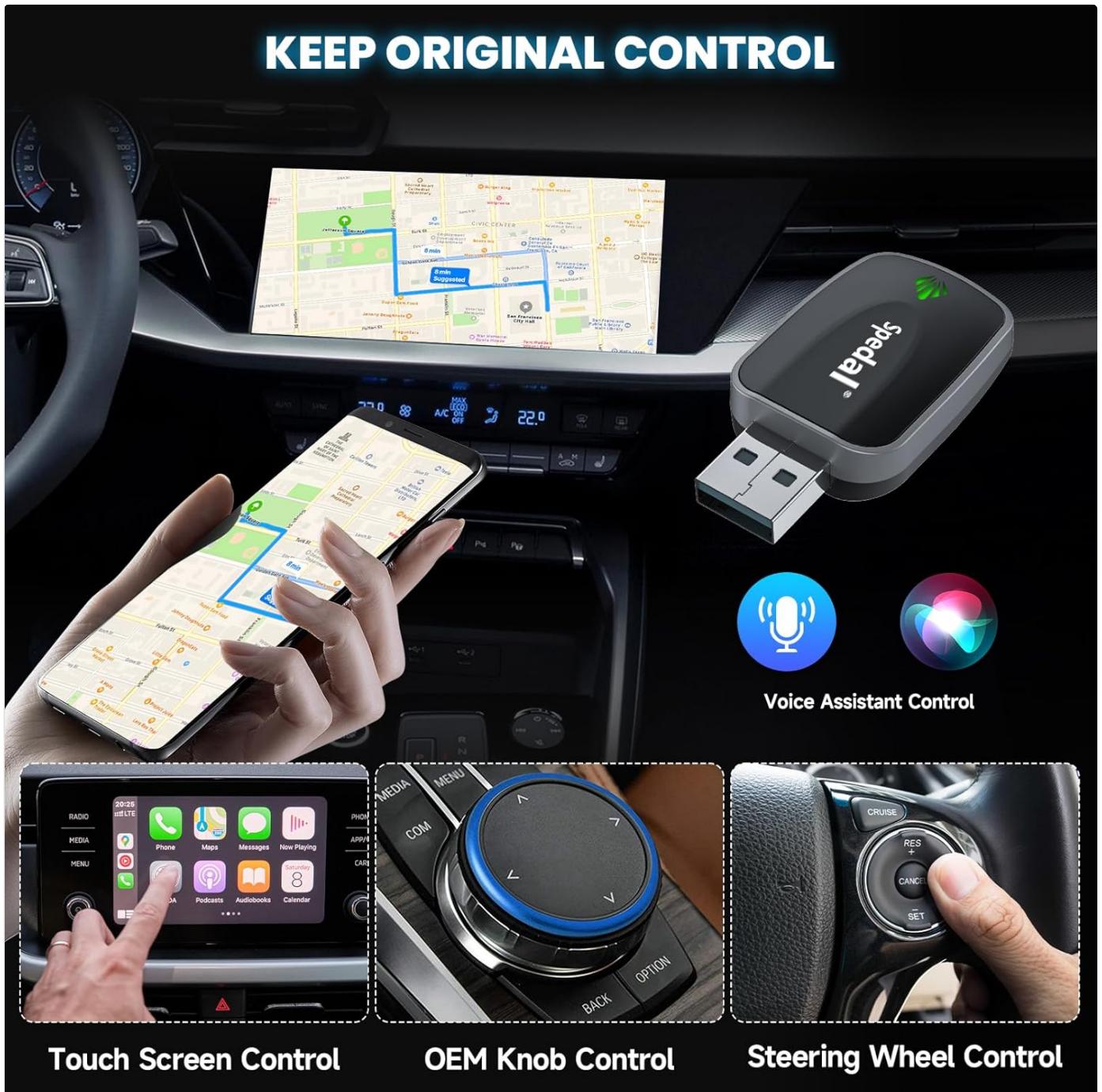
Image 4.1: Demonstrating the different ways to control CarPlay/Android Auto, including touch screen, rotary knob, steering wheel buttons, and voice commands.