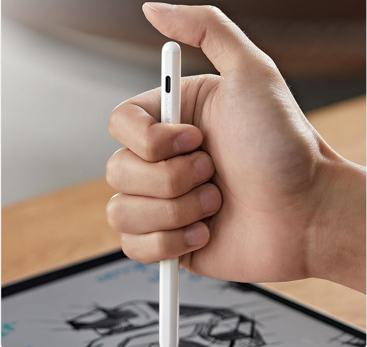
Image: A hand demonstrating the simple double-tap action on the top of the ESR Pencil to power it on, highlighting that no pairing is required.

No Need to Pair Just double-tap to start creating