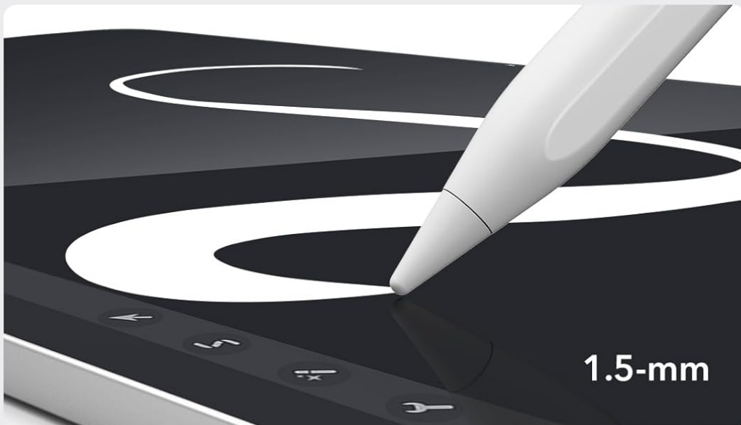
Image: A visual representation of the ESR Pencil in use, demonstrating its smooth and precise performance with a close-up of the 1.5mm tip on the iPad screen.