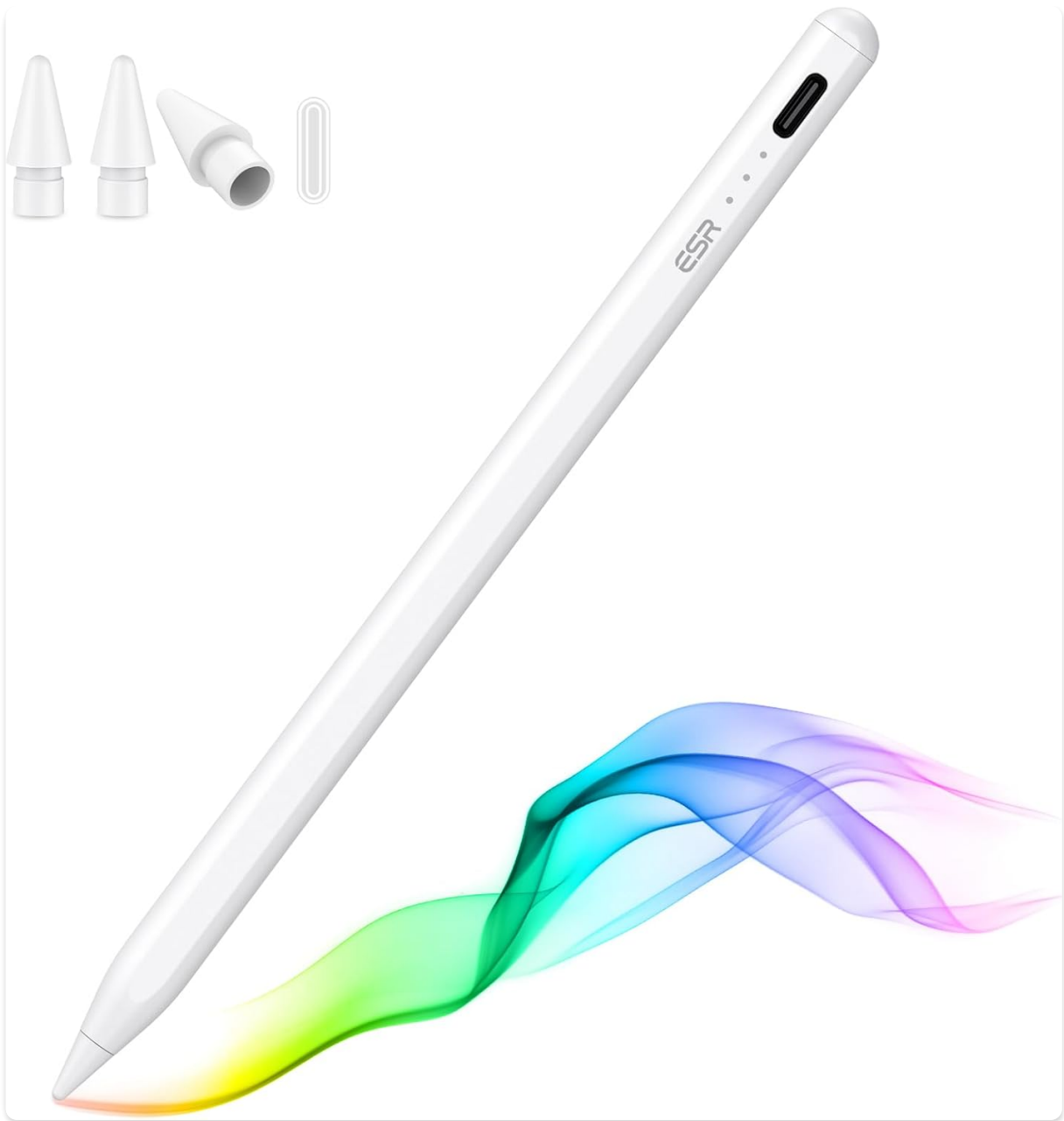
Image: The ESR Pencil (1st Generation) in white, showcasing its sleek design along with included replacement nibs and a USB-C charging cable.