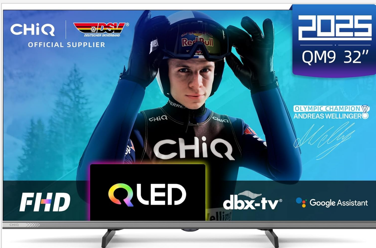
Front view of the CHiQ L32QM9G 32-inch QLED Google TV, showcasing its display and stand.