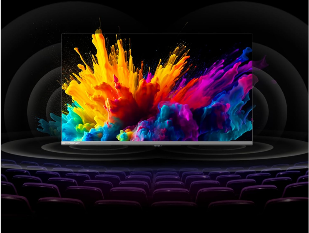
Image featuring the dbx-tv logo, suggesting superior volume control and audio optimization.