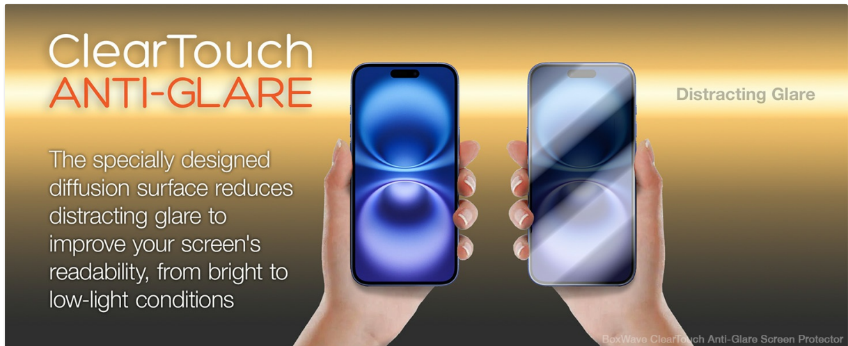
Image: A visual comparison demonstrating how the anti-glare screen protector reduces reflections and improves screen visibility in bright conditions.

This screen protector features a unique matte surface that disperses light, significantly reducing glare from direct sunlight or indoor lighting. This improves screen readability and reduces eye strain, especially when using your Lenovo WD06 Fitness Tracker outdoors or in brightly lit environments. It also reduces 90% of UV rays, further protecting your eyes.