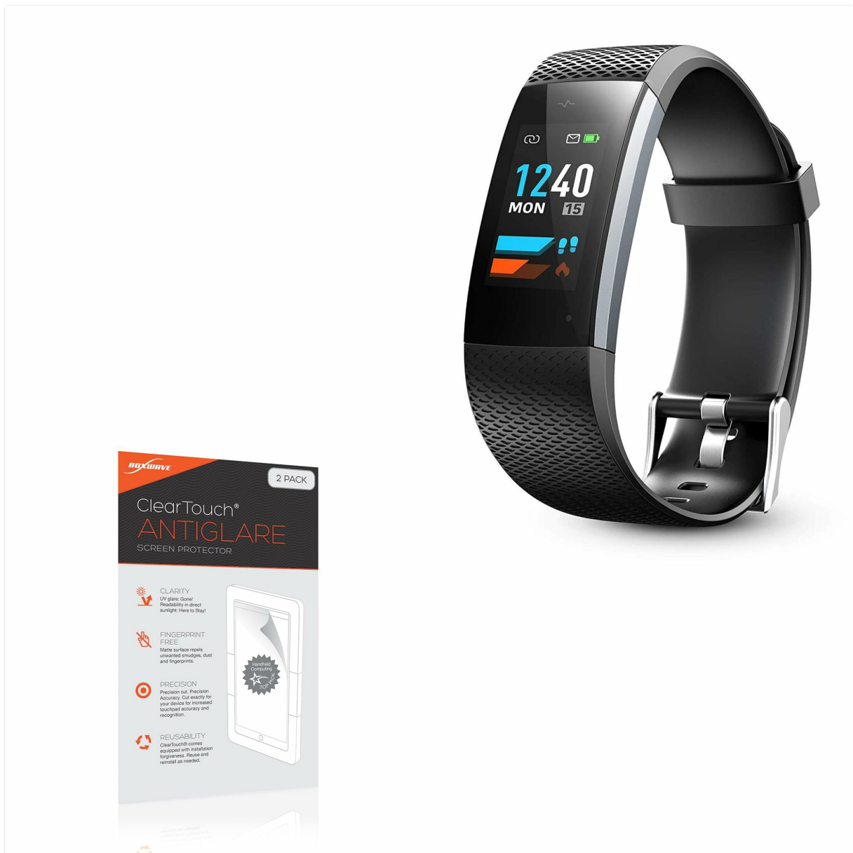
Image: Packaging for the BoxWave ClearTouch Anti-Glare Screen Protector, showing the product name and key features like anti-glare and fingerprint-free properties.