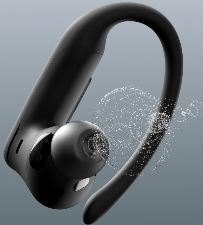
Image: A close-up of a Powerbeats Pro 2 earbud, visually representing the Active Noise Cancelling, Transparency Mode, Adaptive EQ, and Personalized Spatial Audio features through abstract sound wave graphics.