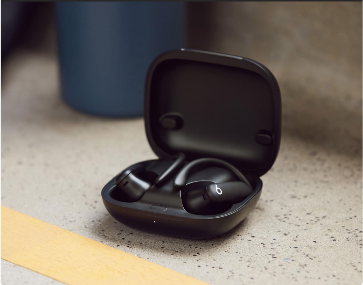
Image: The Powerbeats Pro 2 earbuds resting inside their open charging case, indicating readiness for charging or use. The case is designed for wireless Qi charging.

Up to 45 hours of Battery Life with Wireless Charging Case. ♦