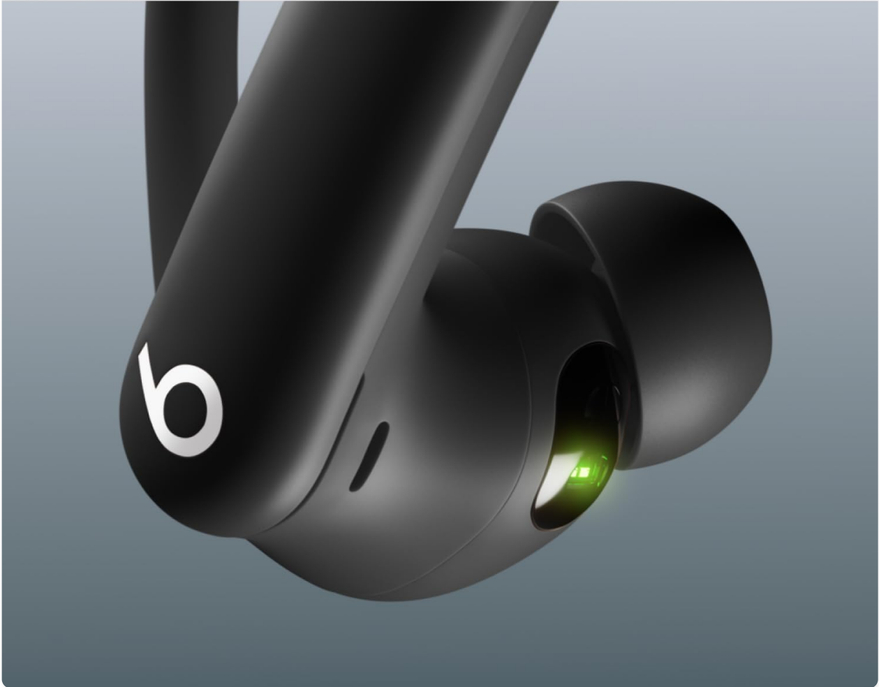
Image: A close-up of the Powerbeats Pro 2 earbud showing the green light of the heart rate monitoring sensor, indicating active measurement.