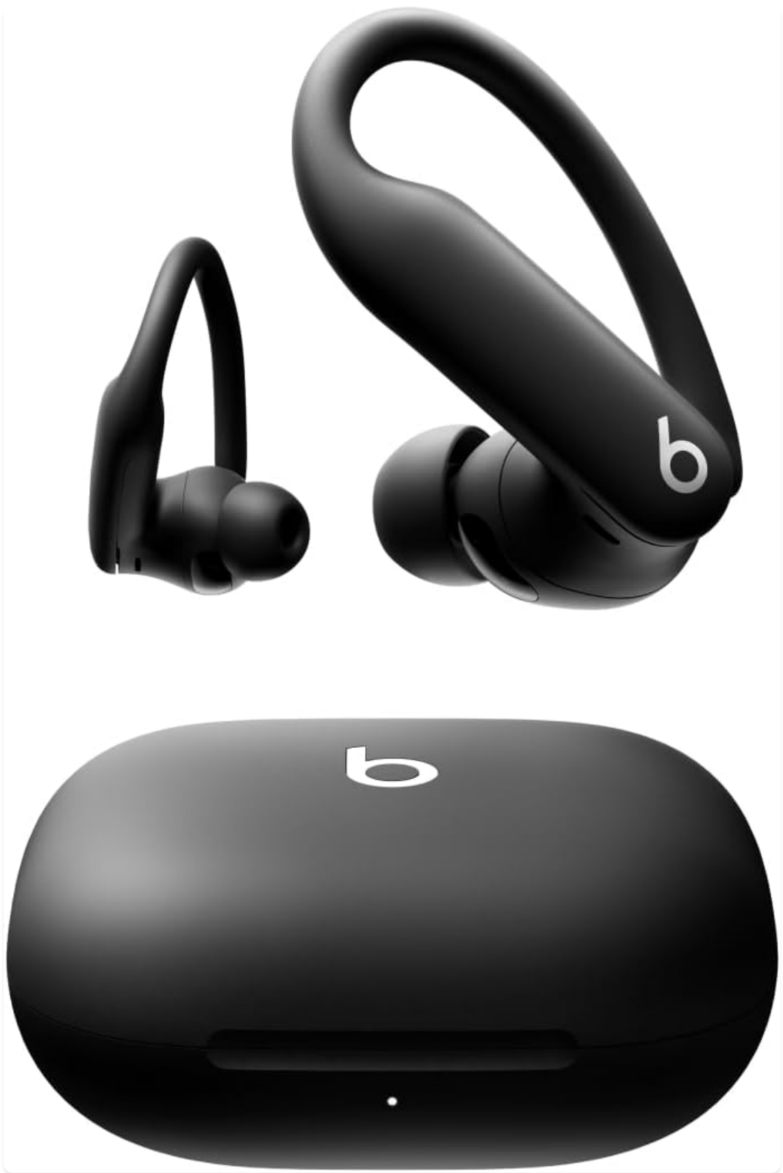
Image: Beats Powerbeats Pro 2 earbuds in Jet Black, shown with their compact charging case. The earbuds feature an over-ear hook design for secure fit.