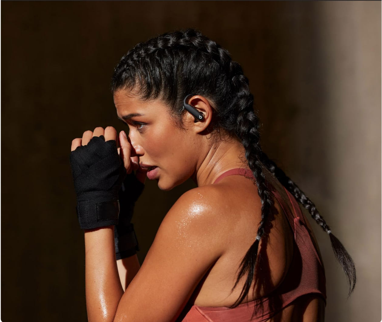
Image: A person wearing the Powerbeats Pro 2 earbuds, demonstrating the secure and comfortable fit provided by the earhooks during physical activity.