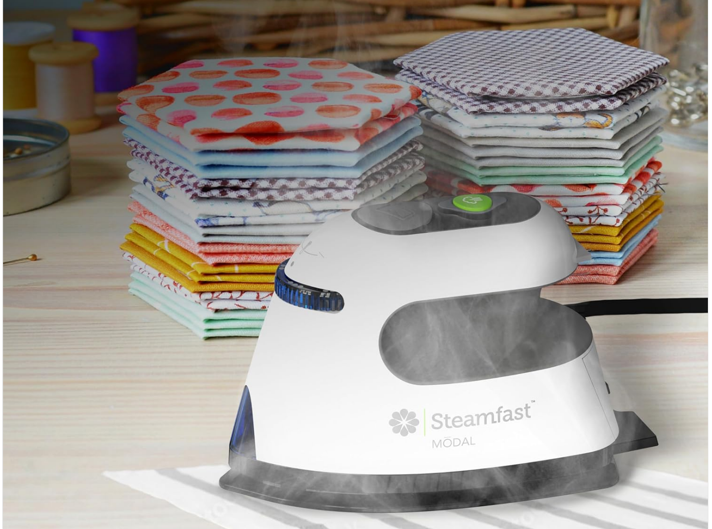
Figure 3: The Steamfast Modal Iron in use, emitting steam over folded fabric squares, demonstrating its steam function for smoothing and pressing.