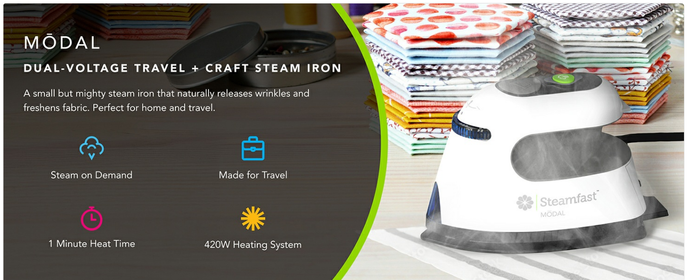
Figure 2: The Steamfast Modal Iron on a surface, highlighting its compact design. This image shows the iron's overall appearance, including the water tank area, which is important for setup.