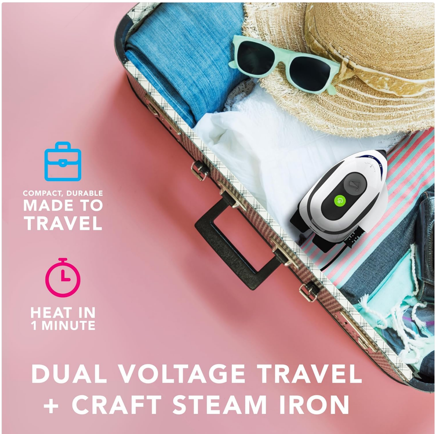
Figure 5: The Steamfast Modal Iron neatly packed inside a suitcase alongside other travel items, demonstrating its portability and ease of storage for travel.