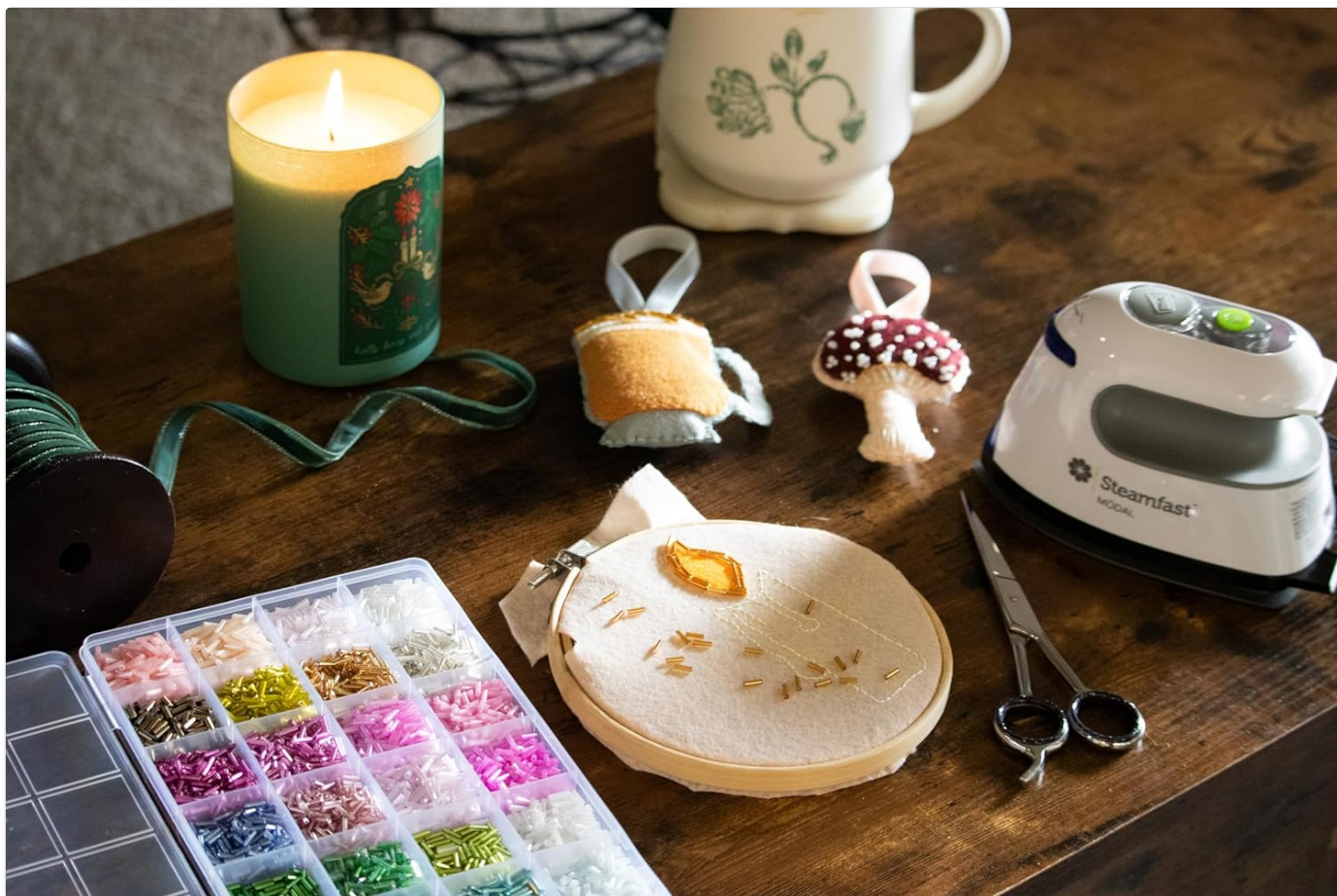
Figure 4: The Steamfast Modal Iron positioned on a wooden table amidst various crafting supplies, including fabric, threads, and beads, illustrating its utility for craft projects.