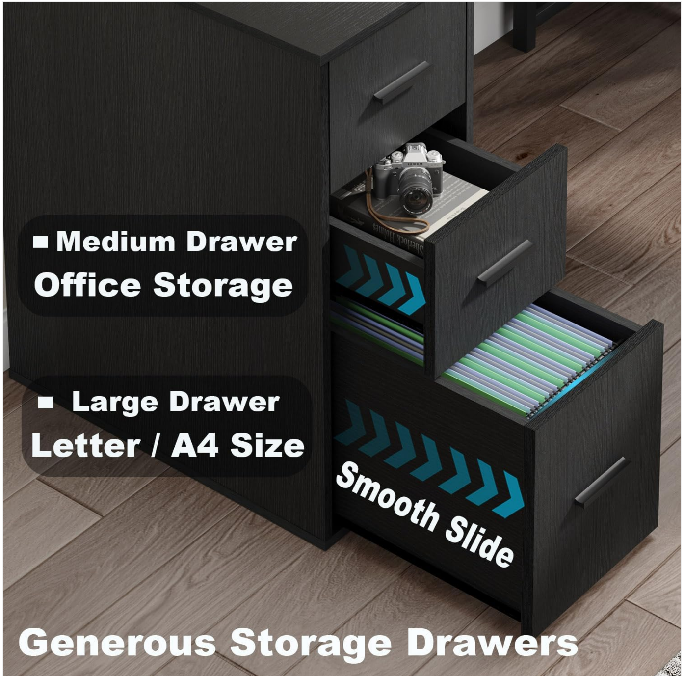
Image: Detailed view of the desk's generous storage drawers, highlighting their smooth operation and capacity for office supplies and files.