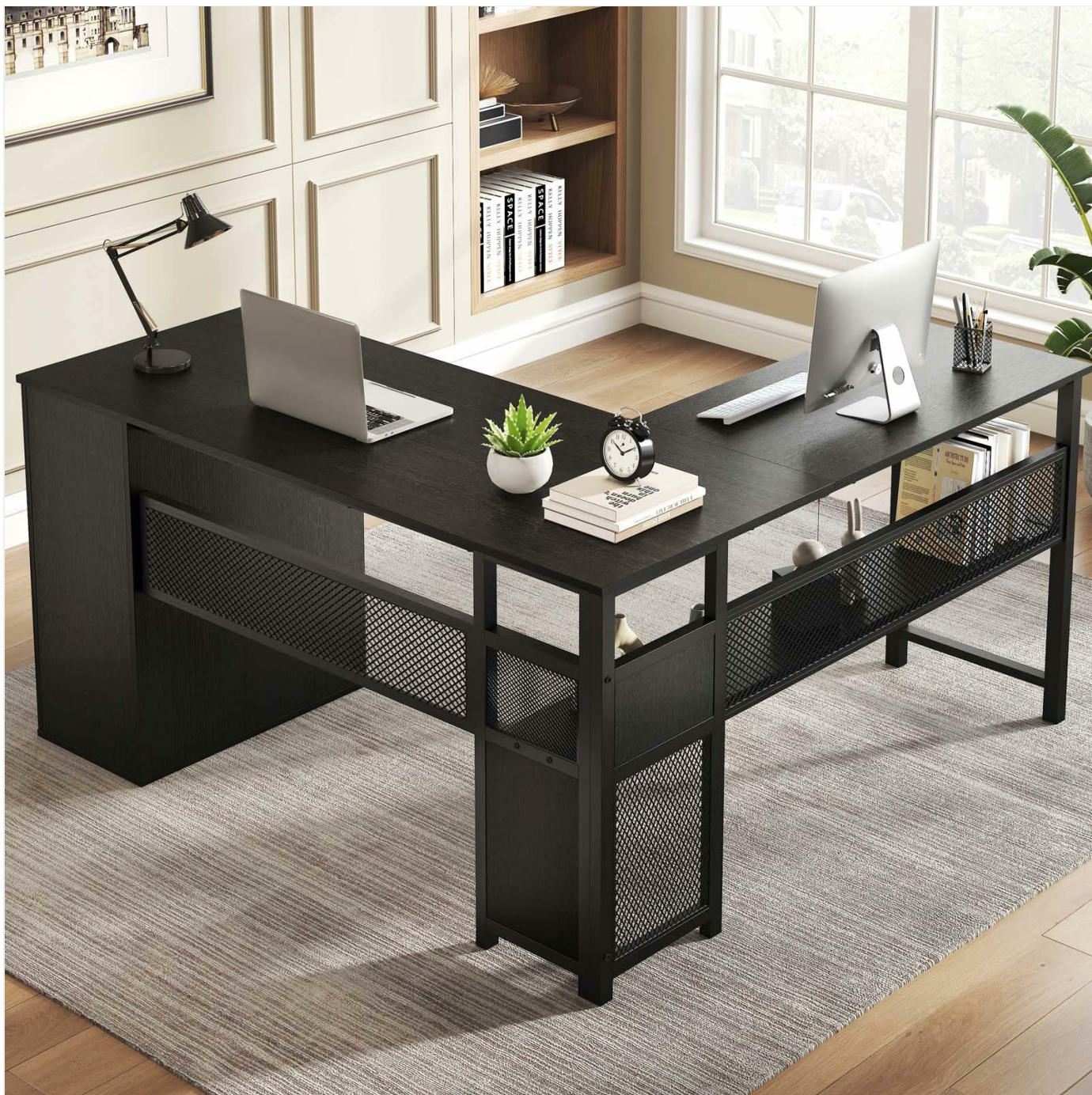
Image: The LVB Black L Shaped Desk, showcasing its design and functionality in an office environment.