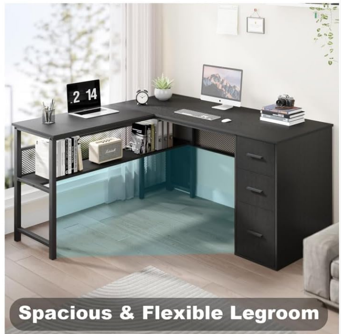
Image: A collage showcasing key features such as the solid MDF board, easy-access open shelf, mesh and wood alternating design, and spacious legroom.