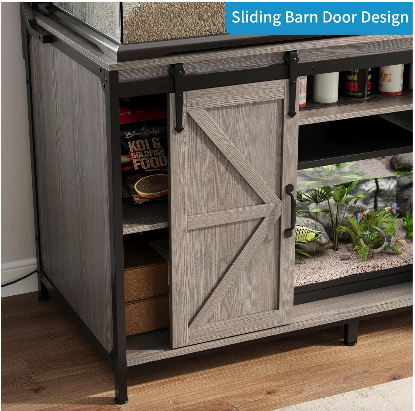
Image: A close-up view of the sliding barn door design on the cabinet, showcasing its aesthetic and functional aspect for accessing storage.