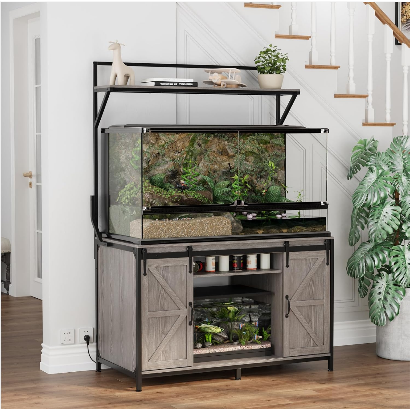
Image: The assembled VOWNER Reptile Tank Stand in a room setting, featuring a large terrarium on the tabletop and a smaller aquarium placed within the cabinet's lower compartment. The top shelf holds decorative items.