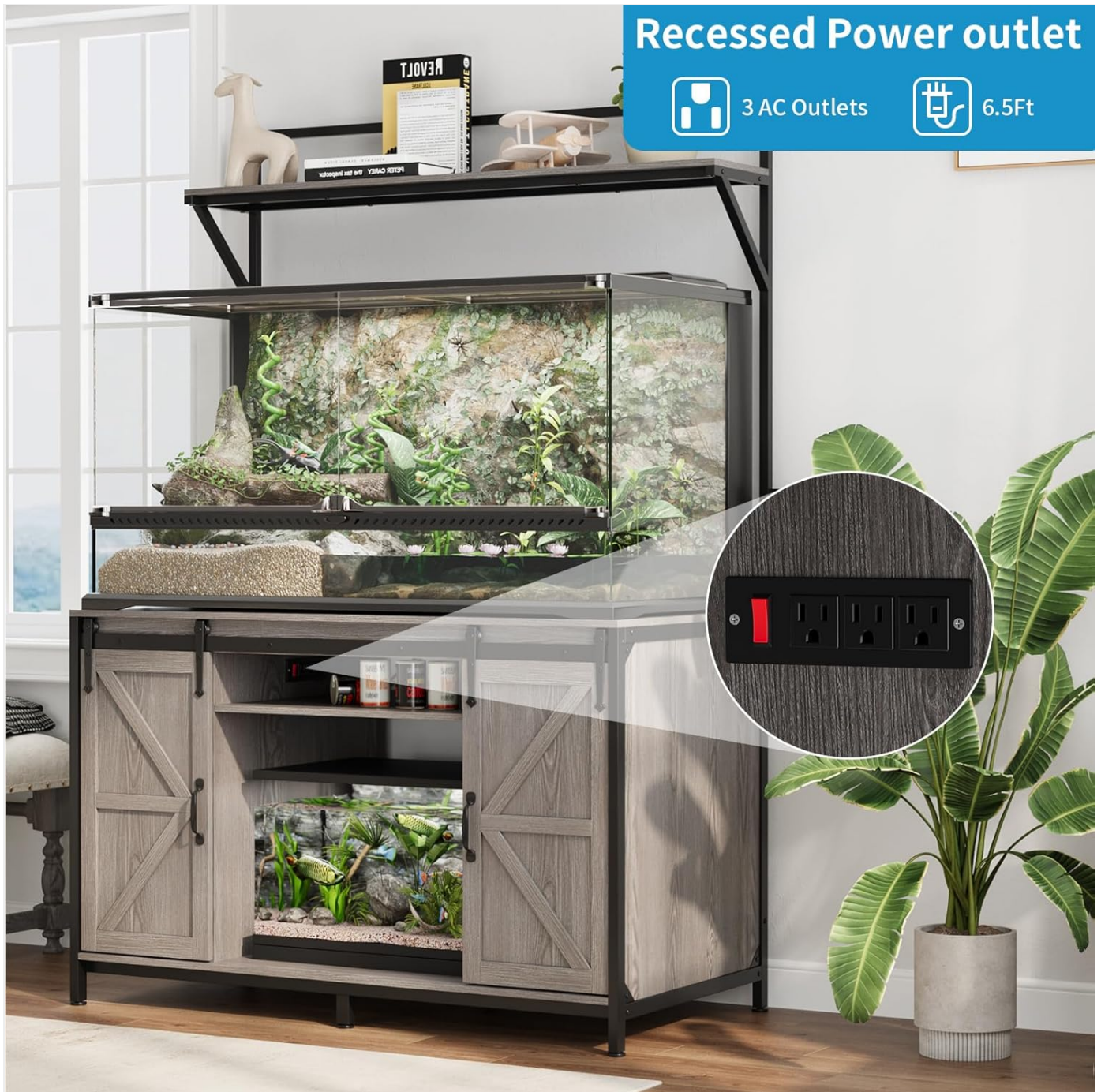
Image: Detail of the recessed power outlet integrated into the stand, featuring three AC outlets and a power switch. The power cord is 6.5 feet long.