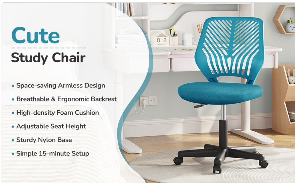
Image 5.1: Visual representation of the chair's adjustable functions.