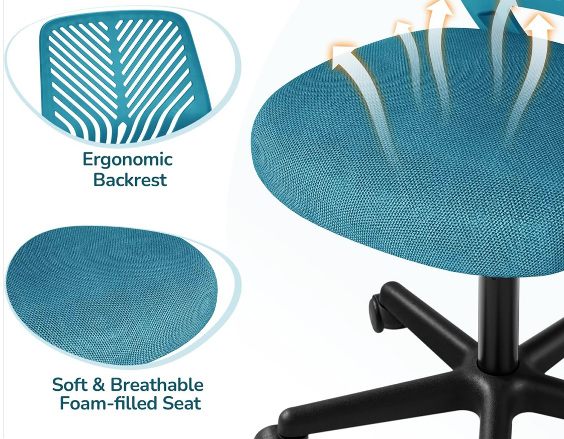
Image 3.1: Detail of the ergonomic backrest and breathable seat material.