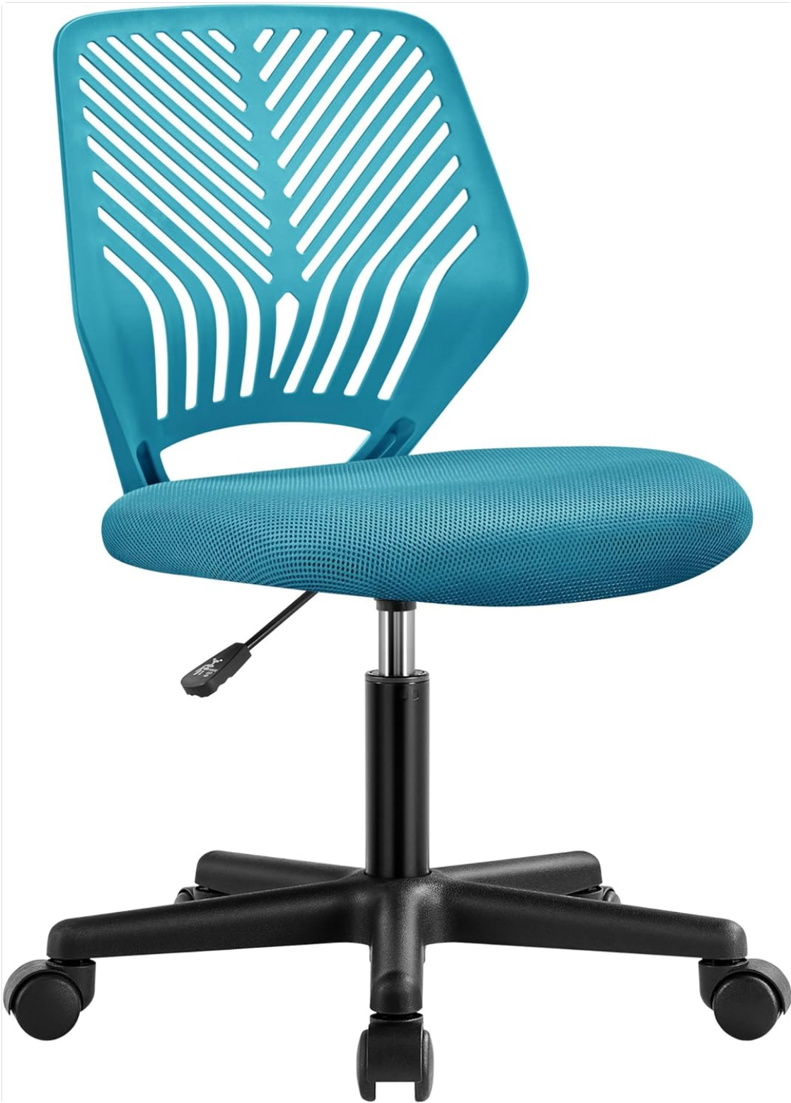
Image 1.1: The Yaheetech Armless Office Chair, Model 592837, in Turquoise.