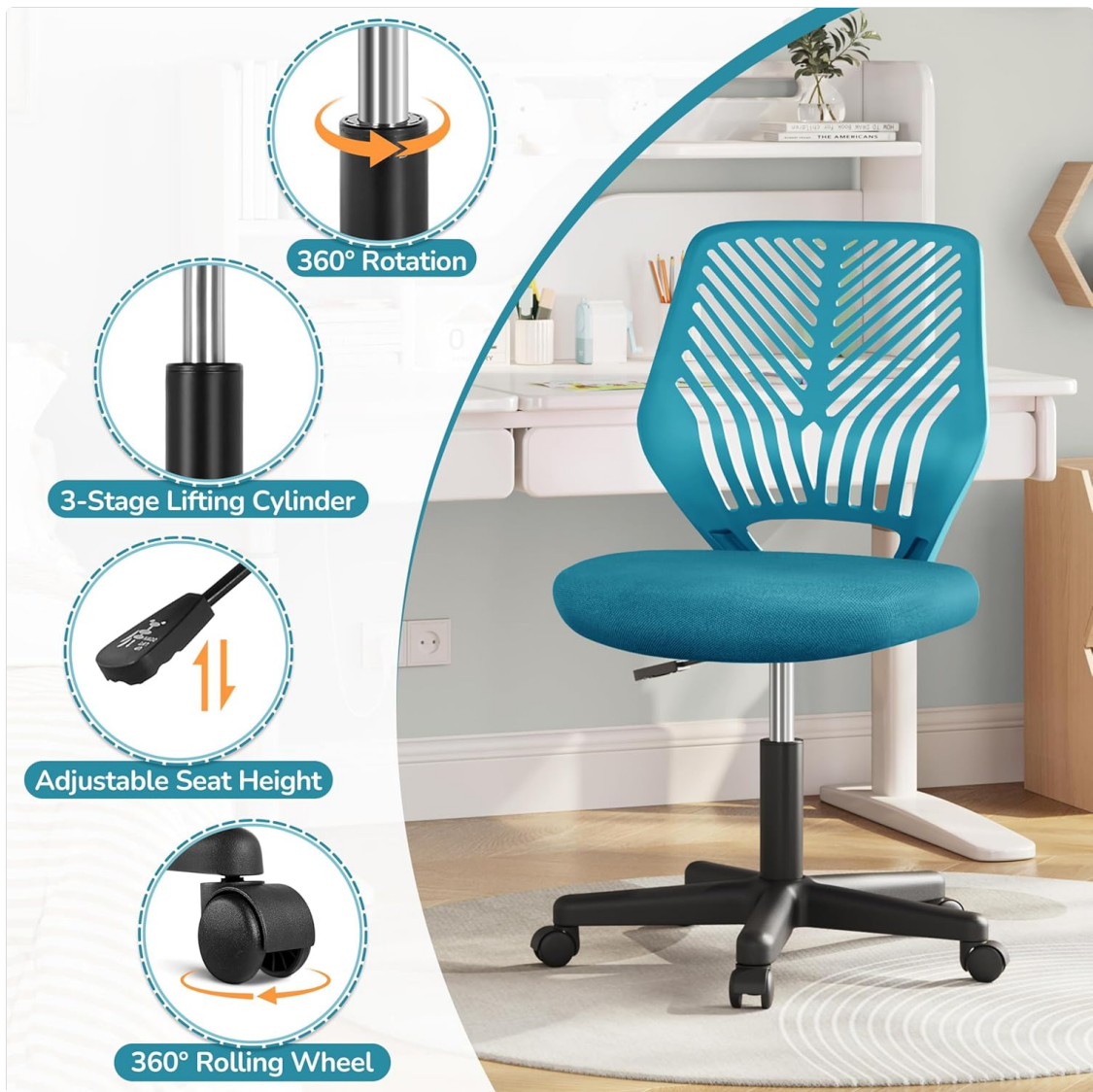
Image 4.1: Key functional components of the chair, including the gas lift and wheels.