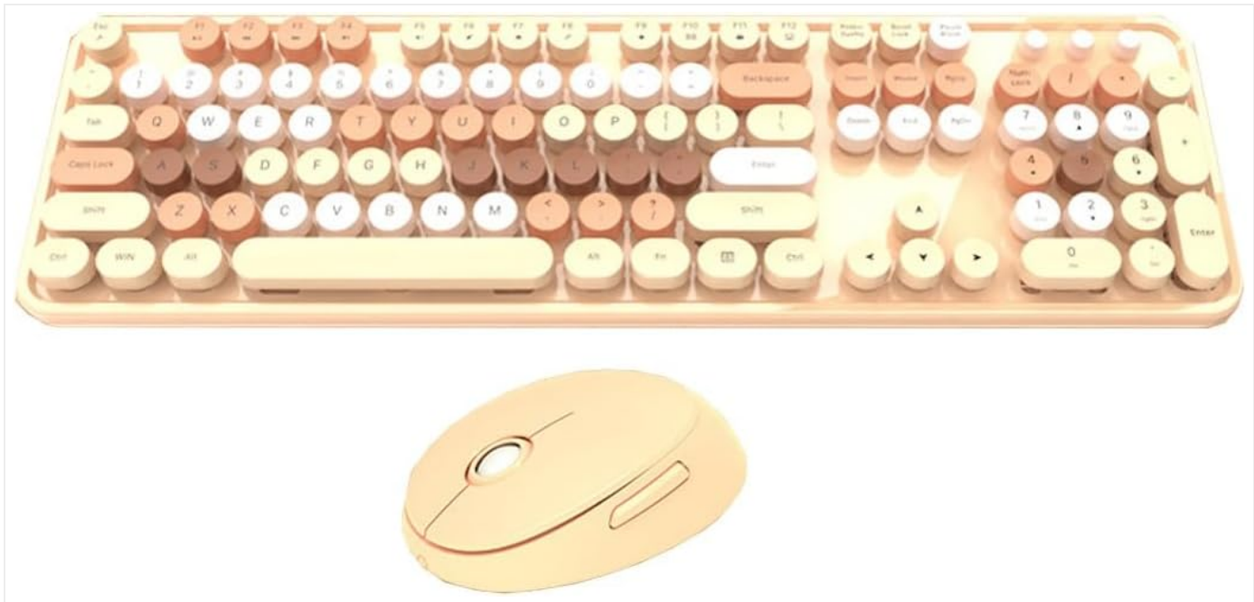
Image: The Generic FQIFRFBFF-06 wireless keyboard and mouse set, featuring a beige keyboard with round, retro-style keycaps and a matching ergonomic mouse.

This manual provides detailed instructions for the setup, operation, and maintenance of your Generic FQIFRFBFF-06 Wireless Typewriter Style Keyboard and Mouse combo. Please read this manual thoroughly before using the product to ensure proper functionality and longevity.