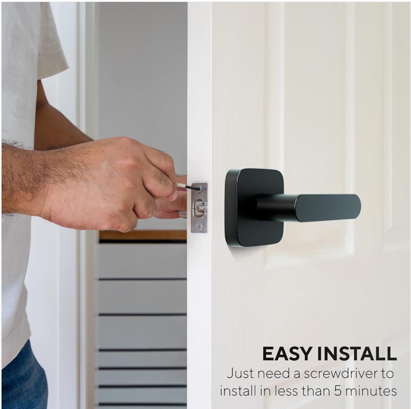
Figure 8: The ULTRALOCK Bolt Smart Lock is designed for easy installation, typically requiring only a screwdriver and minimal time.