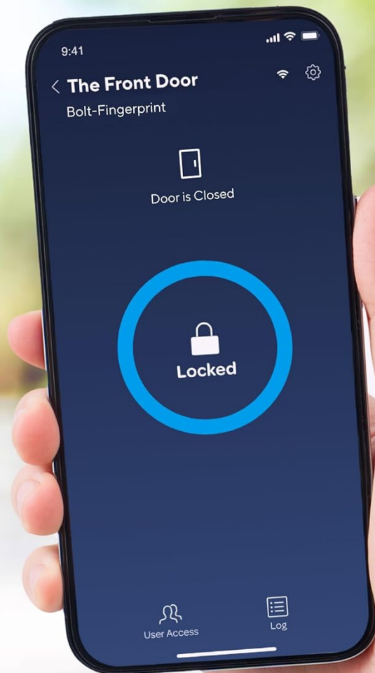
Figure 3: The ULTRALOCK app provides comprehensive control from anywhere, allowing users to share eKeys, manage users, unlock remotely, view log records, and receive smart notifications.