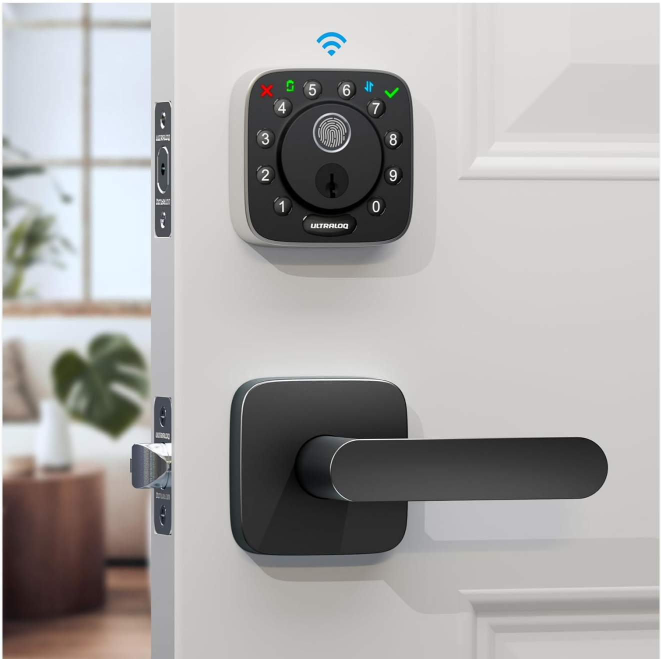
Figure 1: The ULTRALOCK Bolt Fingerprint Smart Lock and lever set, showcasing its sleek design and integration on a standard door.