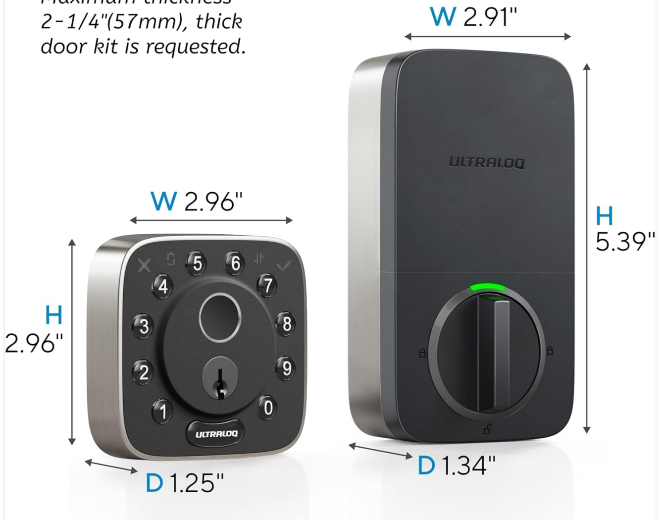
Figure 7: Key dimensions of the ULTRALOCK Bolt Smart Lock components, illustrating its compact design.

Maximum thickness 2-1/4"(57mm), thick door kit is requested.