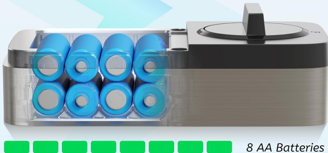
Figure 4: The smart lock is powered by 8 AA batteries, providing up to 10 months of reliable operation under normal use.

8 AA batteries power the Lock for up to one year through regular use.