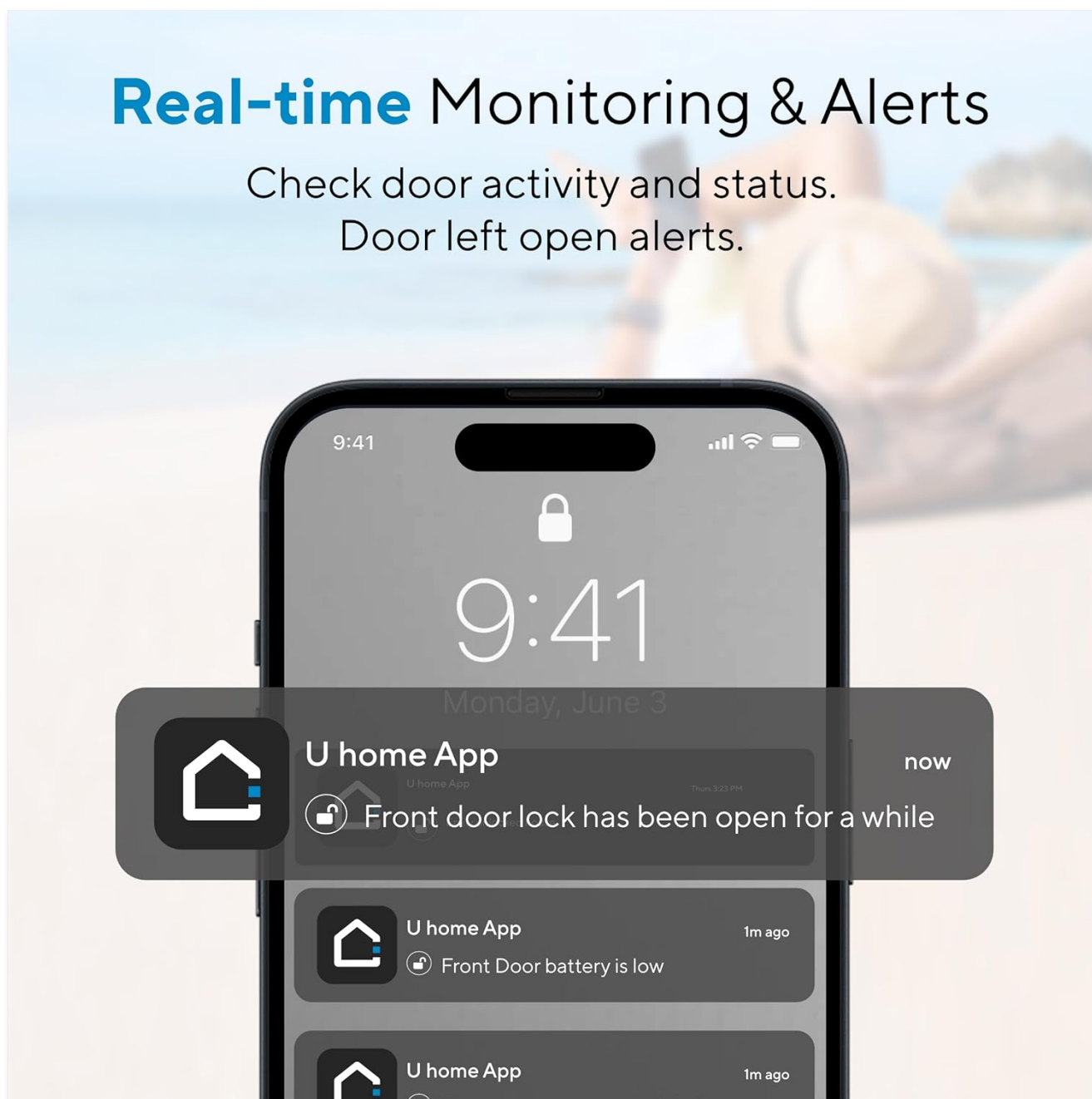
Figure 5: Real-time monitoring and alerts keep you informed about your door's status, including notifications for doors left open or low battery.