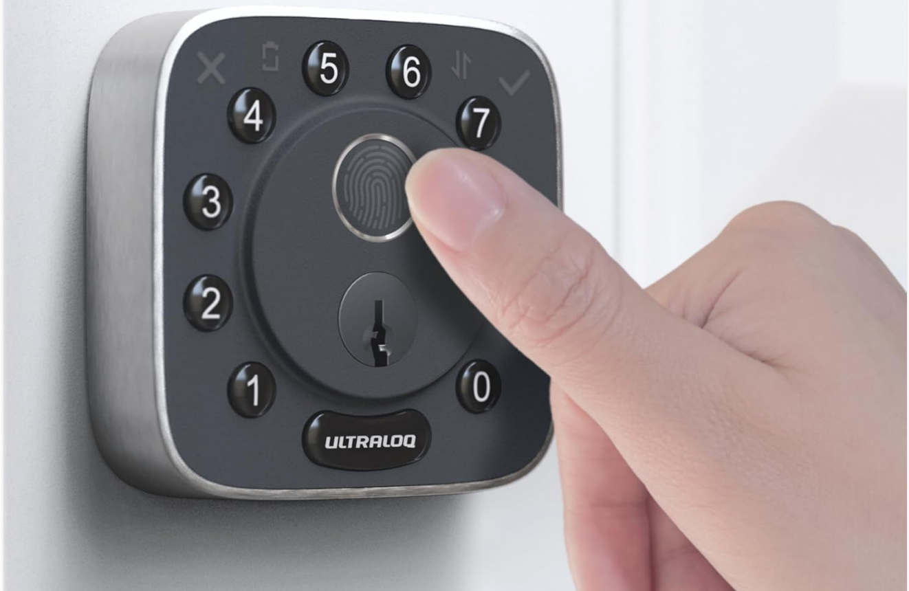
Figure 2: The advanced biometric fingerprint sensor allows for quick and secure access with a 0.3-second unlock speed and 99.8% accuracy.