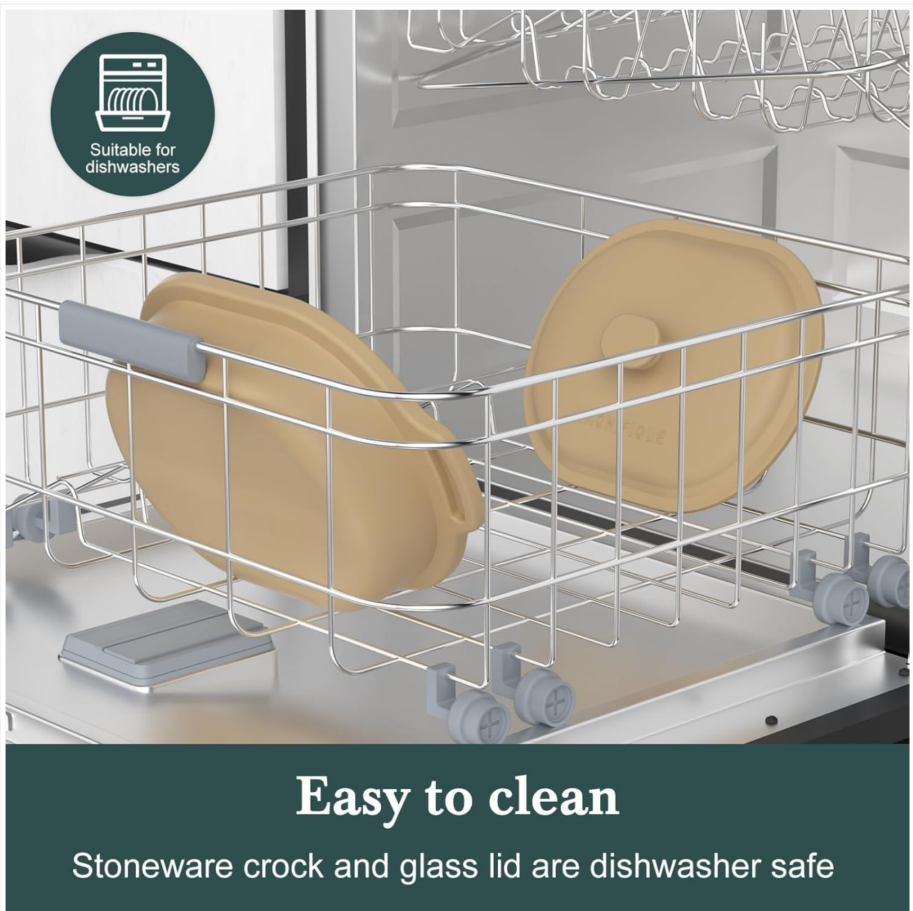
Figure 6.1: The removable claypot and lid are shown being placed into a dishwasher, demonstrating their dishwasher-safe design for convenient and minimal clean-up after use.