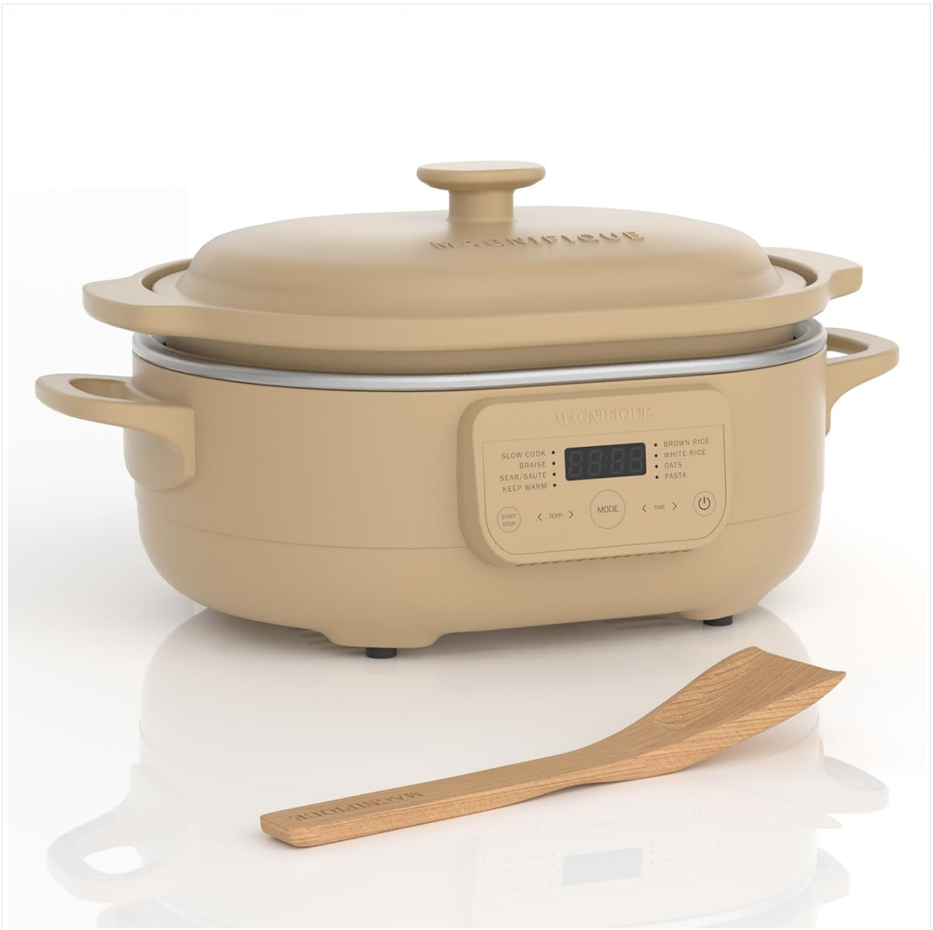
Figure 1.1: The MAGNIFIQUE 4 Quart Claypot Multi-Cooker in brown, presented with its lid and an accompanying wooden spatula. This image showcases the appliance's elegant design and compact form factor.

Thank you for choosing the MAGNIFIQUE 4 Quart Claypot Multi-Cooker. This versatile appliance is designed to simplify your cooking experience with its 8-in-1 functionality, including slow cook, braise, sear/sauté, keep warm, brown rice, white rice, oats, and pasta functions. Crafted with a heat-resistant porcelain liner and ceramic nonstick coating, it offers a safe and efficient way to prepare a variety of meals. Please read this manual thoroughly before first use to ensure proper operation and maintenance.