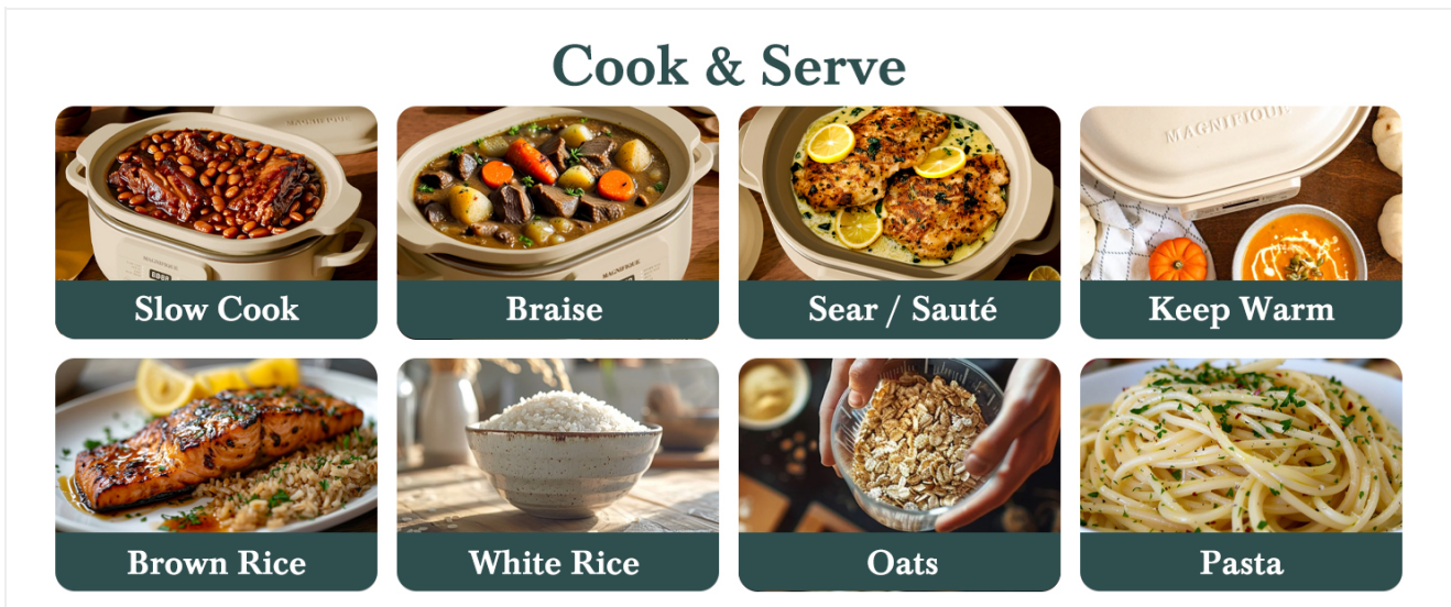
Figure 5.1: Visual representation of the 8 primary cooking functions: Slow Cook (beans), Braise (stew), Sear/Sauté (chicken), Keep Warm (soup), Brown Rice, White Rice, Oats, and Pasta. Each image demonstrates the versatility of the appliance for different meal types.

The MAGNIFIQUE Multi-Cooker features 8 pre-set functions for various cooking needs. Use the touch control panel to select your desired mode.