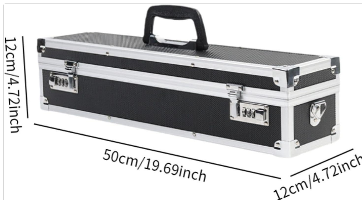
Figure 4: Product dimensions overview.