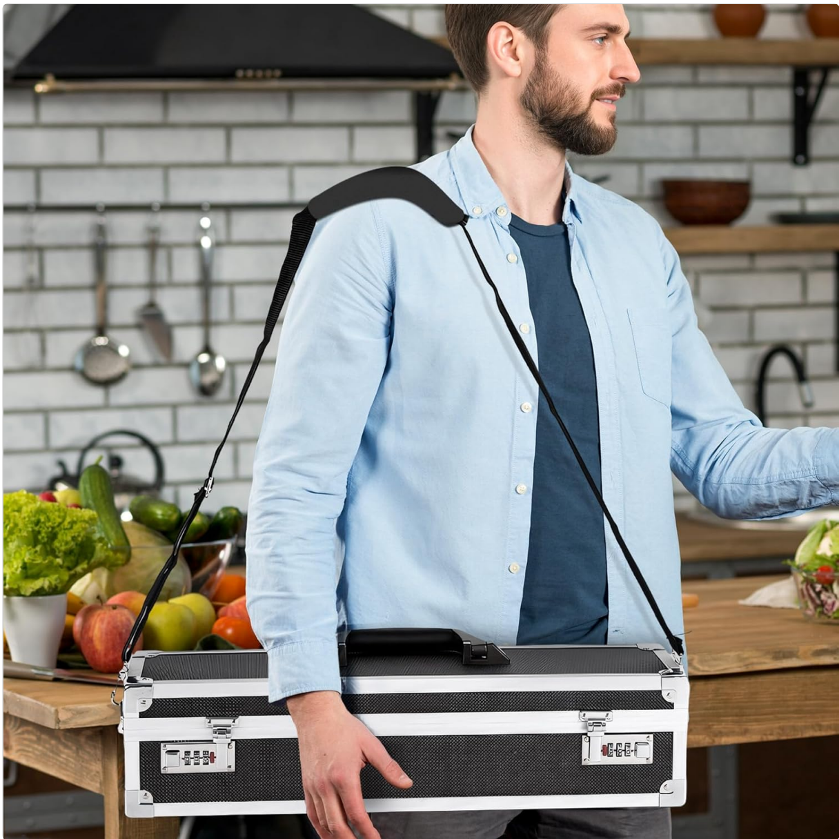
Figure 3: Demonstrating the use of the shoulder strap for portability.