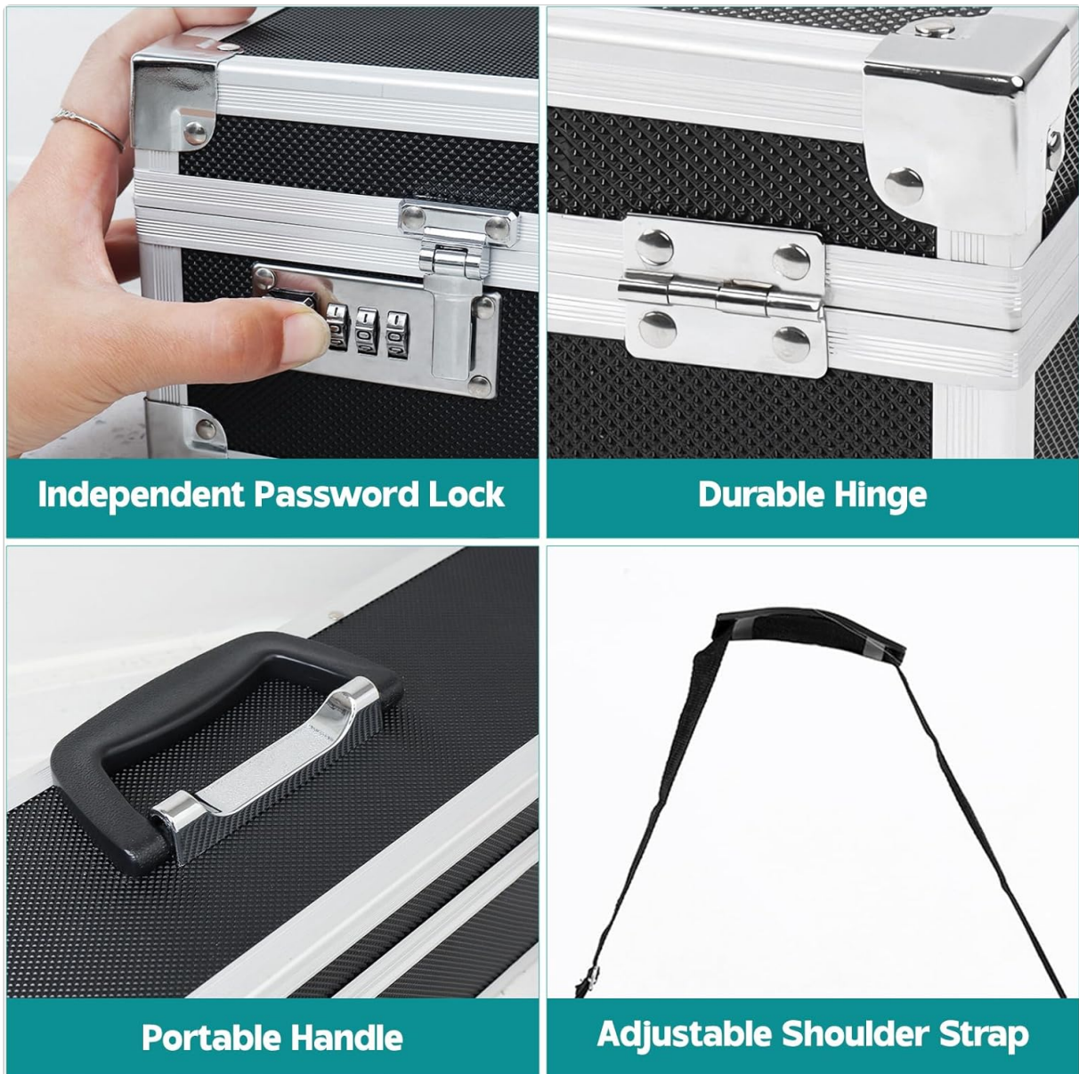
Figure 1: Details of the combination lock, hinge, handle, and shoulder strap attachment points.