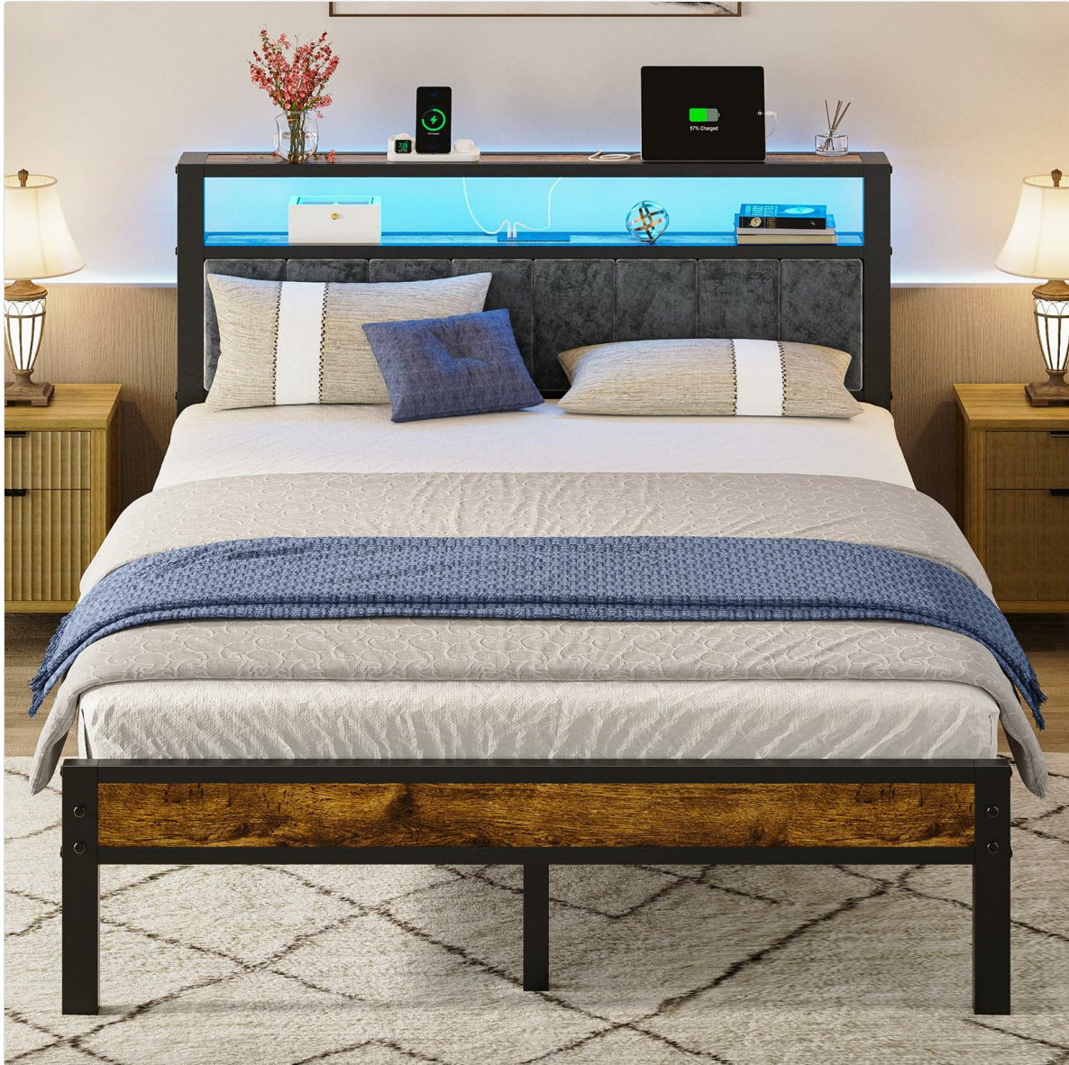
Figure 3.1: Fully assembled Liians Queen Size Bed Frame, showcasing the headboard with LED lighting and storage shelves.

Familiarize yourself with the main parts of your Liians Queen Size Bed Frame.