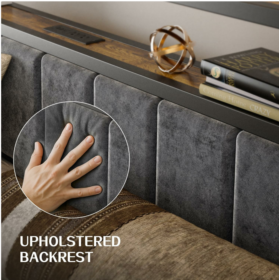
Figure 3.5: The upholstered backrest offers enhanced comfort.