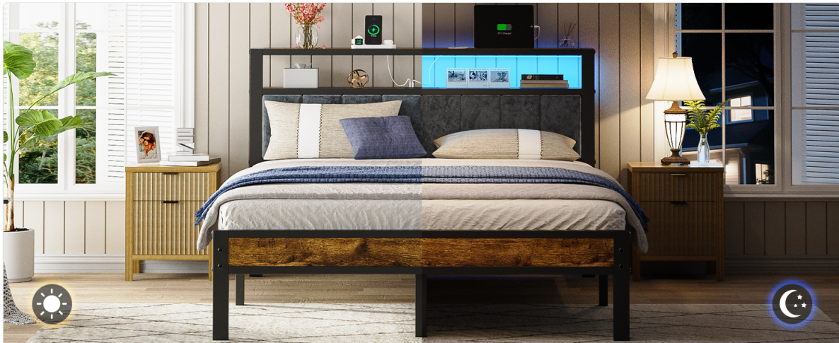
Figure 3.7: Noise reduction pads are integrated into the frame design to ensure a quiet sleep environment.