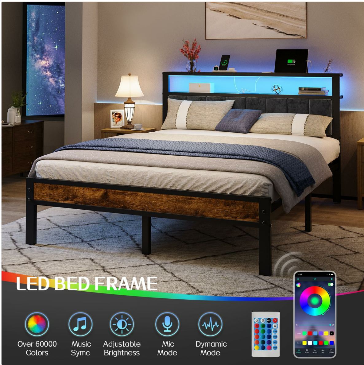
Figure 3.6: The generous under-bed clearance allows for convenient storage solutions.