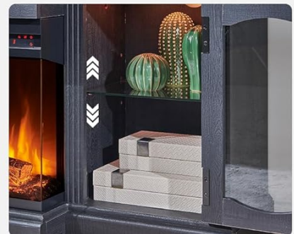
Storage Cabinet with Adjustable Shelf