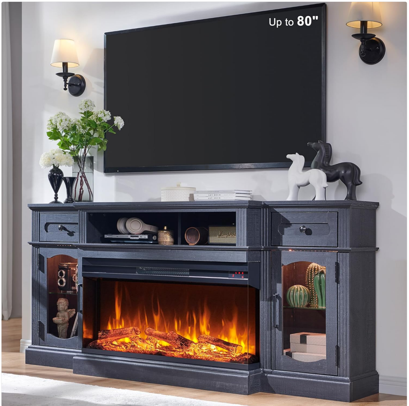
Image: The Farmhouse Electric Fireplace TV Stand in a living room setting, designed to hold TVs up to 80 inches.