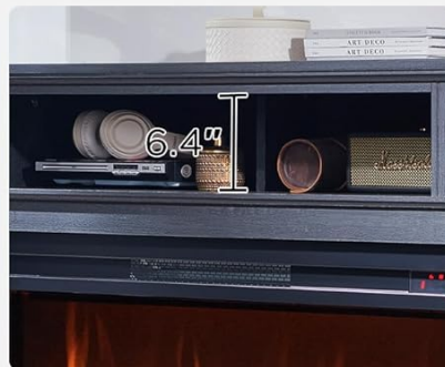
Semi-Open Top Shelf