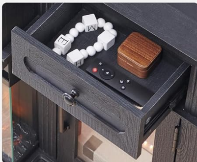
2 Storage Drawers