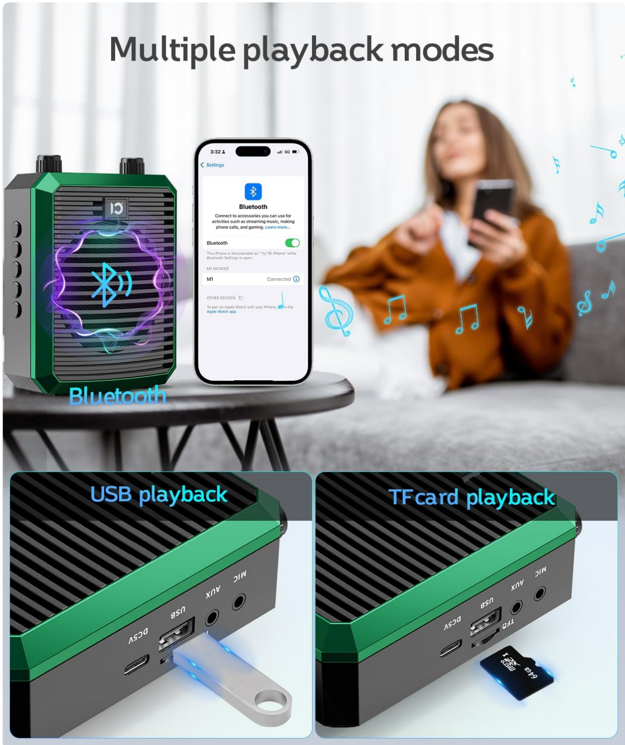
Image: A visual representation of the SHIDU Voice Amplifier's multiple playback modes, including Bluetooth connectivity with a smartphone, USB flash drive insertion, and TF card insertion.