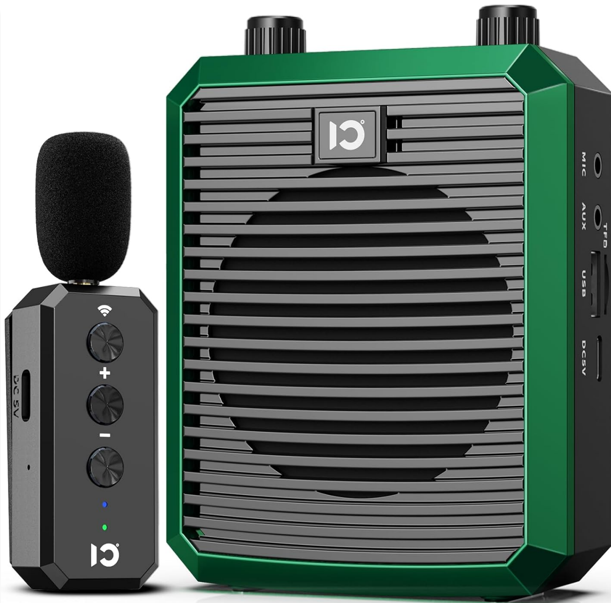
Image: The SHIDU 18W Voice Amplifier (green) and its accompanying wireless lavalier microphone. The amplifier features a large speaker grille and control knobs, while the microphone is compact with volume and power buttons.