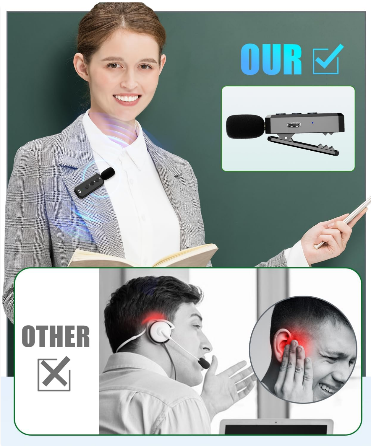
Image: A teacher demonstrating how to wear the SHIDU wireless lavalier microphone clipped to her collar, highlighting its discreet and comfortable design compared to traditional headsets.