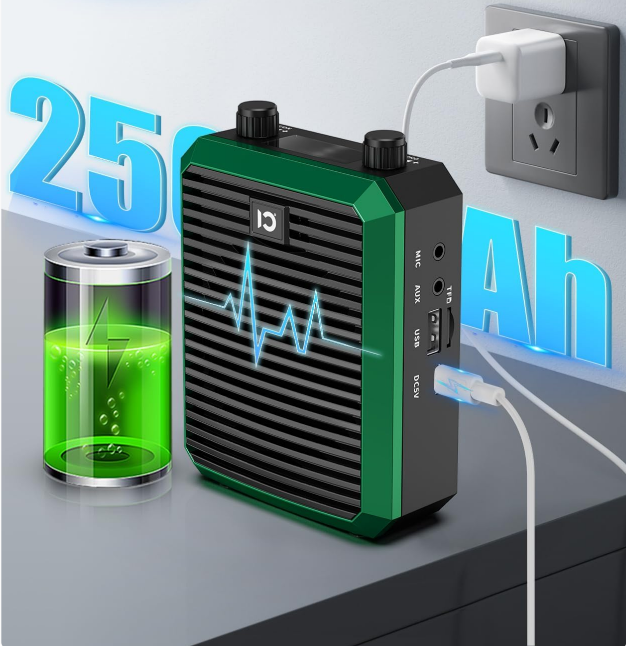
Image: The SHIDU Voice Amplifier connected to a power outlet via a USB charging cable, illustrating the charging process. A battery icon indicates the 2500mAh capacity.