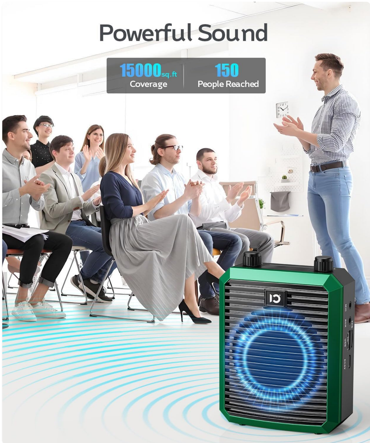
Image: A speaker using the SHIDU Voice Amplifier during a presentation to a group of people, illustrating its powerful sound coverage of 15,000 sq.ft.

Once the amplifier and microphone are paired and powered on, speak into the lavalier microphone. Your voice will be amplified through the speaker. The 2.4G wireless technology ensures a stable connection and 360-degree sound pickup, providing clear and loud audio without distortion. The amplifier can cover an area of up to 15,000 sq.ft (1400 ), reaching up to 150 people.