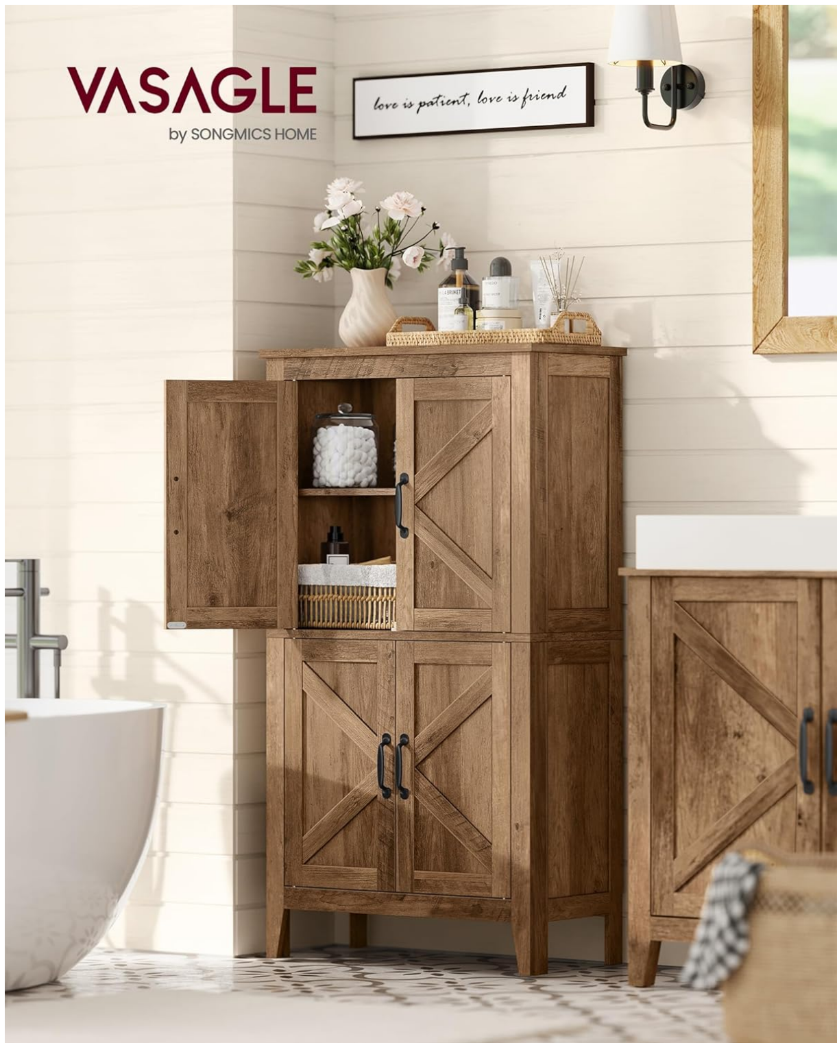
Image: The VASAGLE LIRY Collection Farmhouse Storage Cabinet, Honey Brown, shown in a bathroom environment, demonstrating its aesthetic and functional integration.