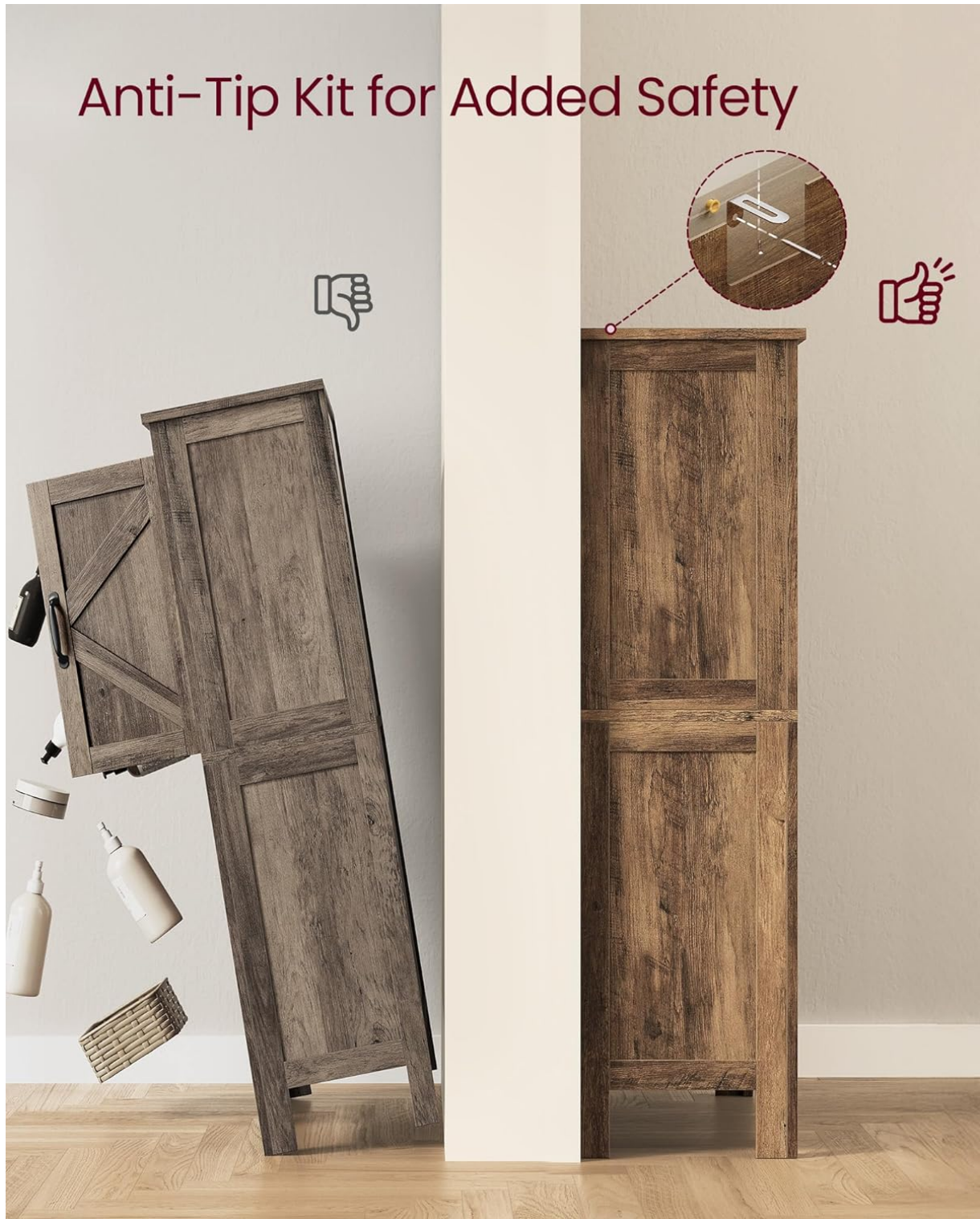
Image: An illustration demonstrating the proper use of an anti-tip kit to secure the cabinet to a wall, preventing accidental tipping.