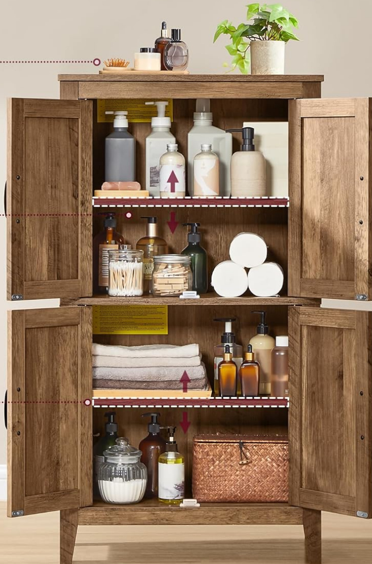
Image: An interior view of the cabinet highlighting the adjustable shelves and demonstrating how various items like toiletries and towels can be organized.