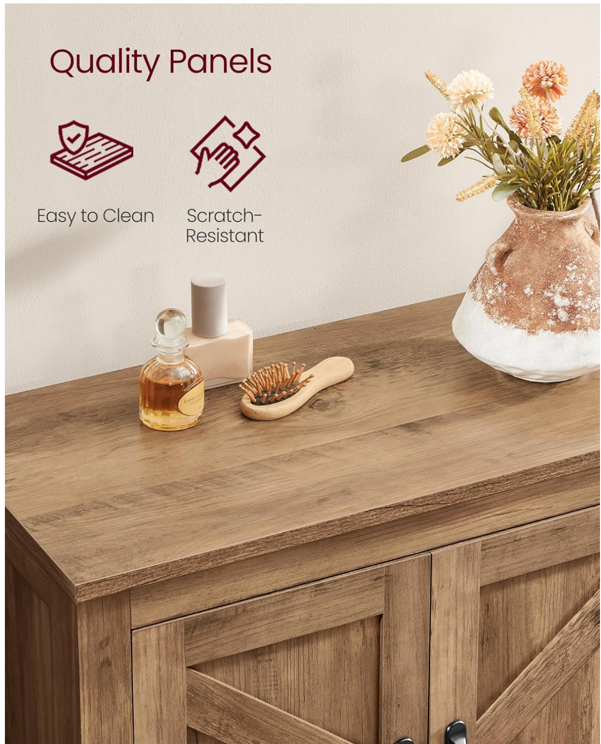
Image: A detailed view of the cabinet's surface, illustrating its easy-to-clean and scratch-resistant properties.