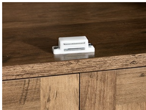
Image: A close-up view of the magnetic catch mechanism, ensuring the cabinet doors remain closed.

Image: An interior view of the cabinet highlighting the adjustable shelves and demonstrating how various items like toiletries and towels can be organized.