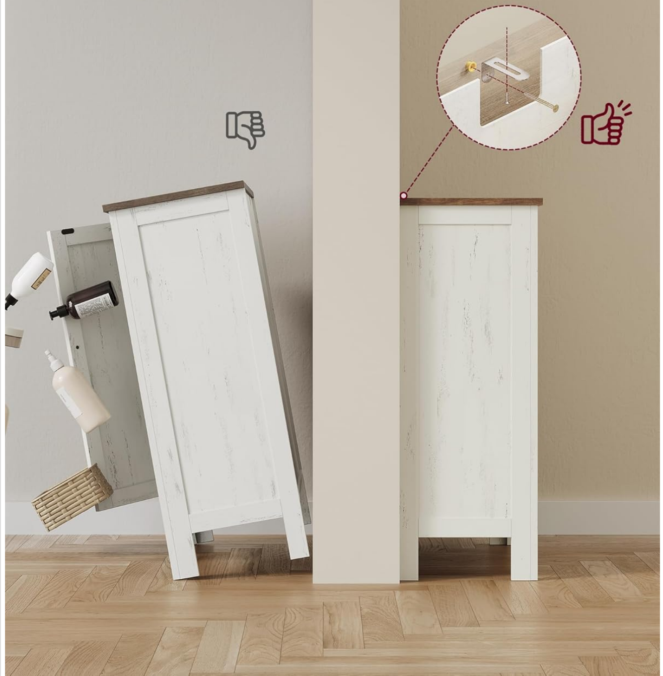
Image 2.1: Illustration of the anti-tipping kit installation for enhanced safety.