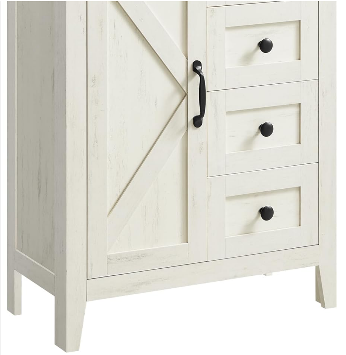
Image 1.1: Front view of the VASAGLE LIRY Collection BBK753W01 Bathroom Storage Cabinet.