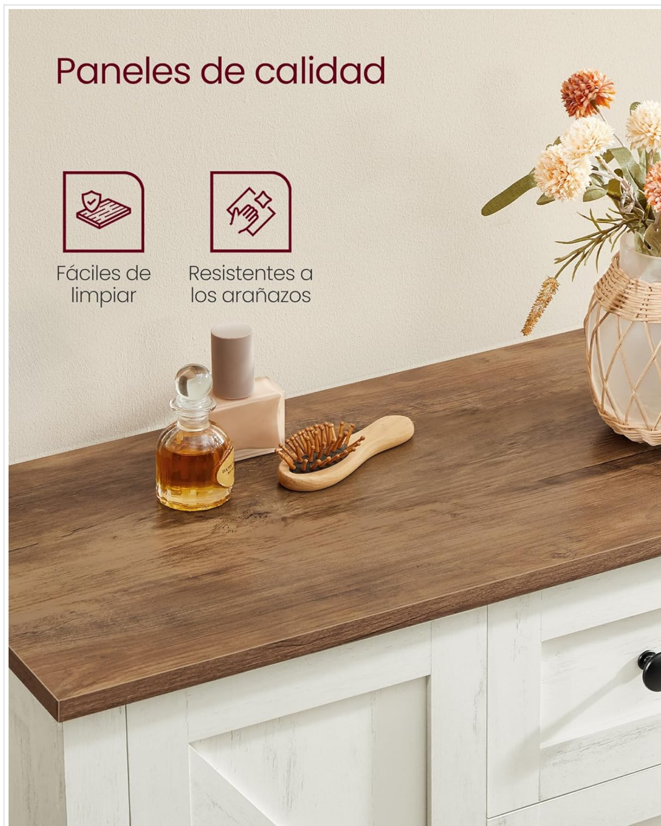
Image 6.1: Close-up view highlighting the quality, easy-to-clean, and scratch-resistant surface of the cabinet.