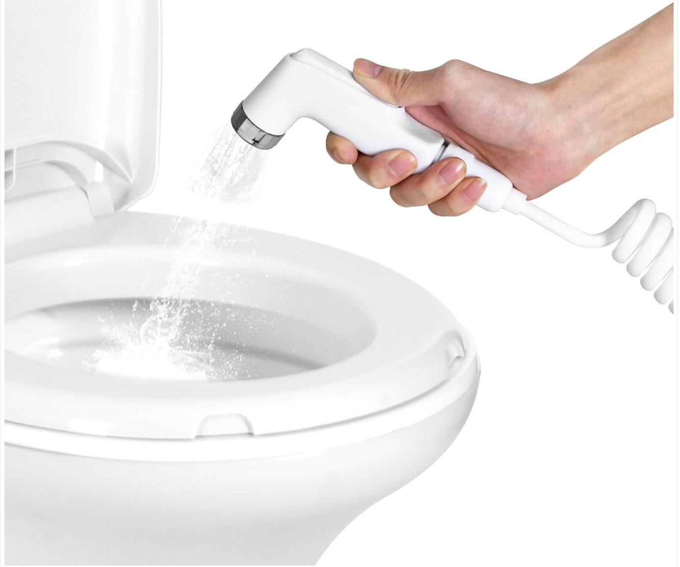
Figure 4.1: The YITAHOME RV Toilet offers a comfortable, home-like seating experience.