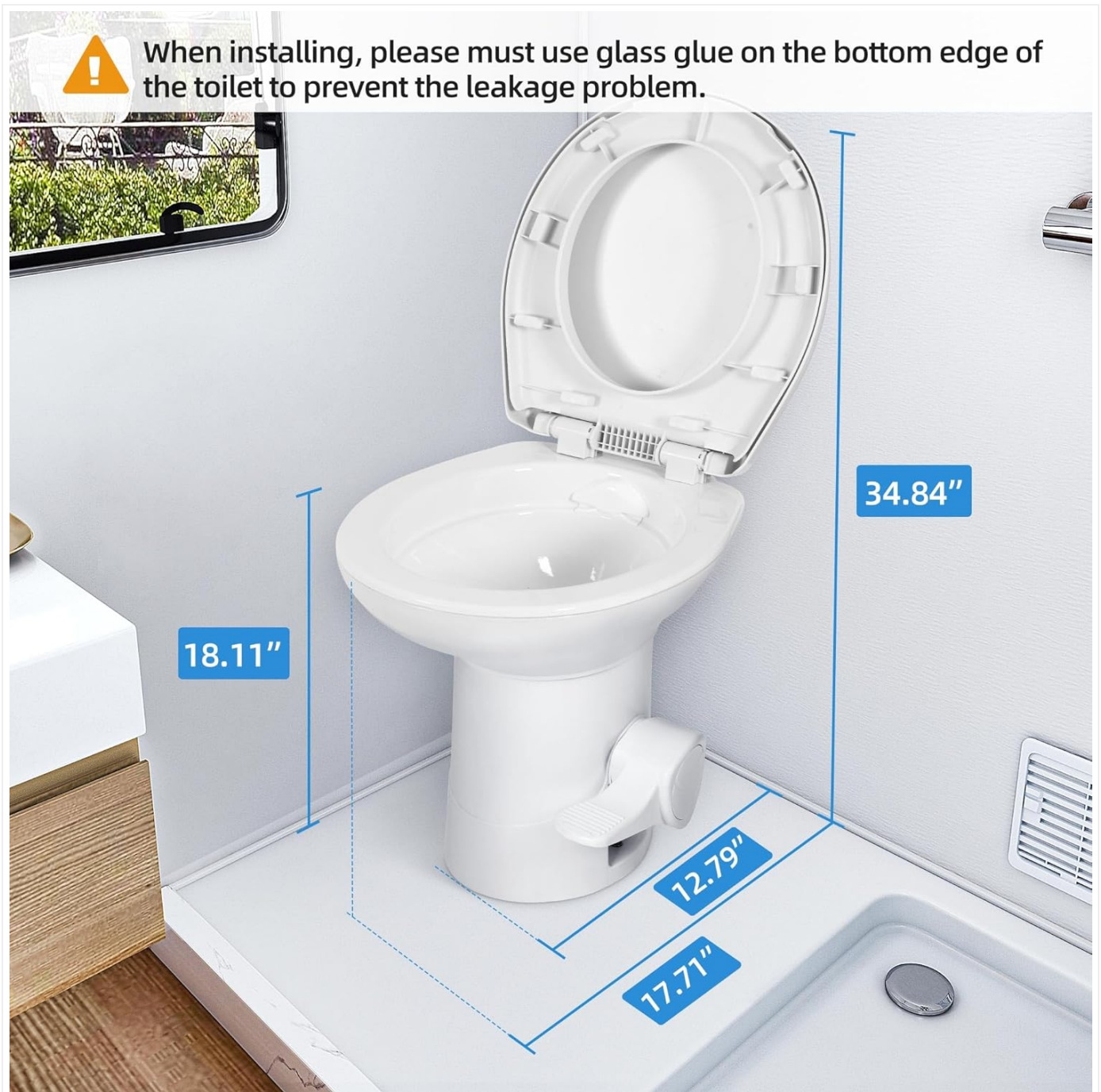
Figure 7.1: The enamel bowl and T-type water outlet facilitate effective cleaning.