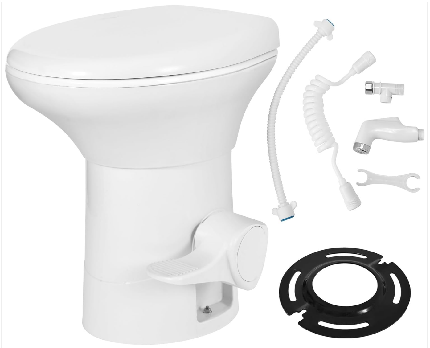
Figure 3.1: Included components of the YITAHOME RV Toilet system.