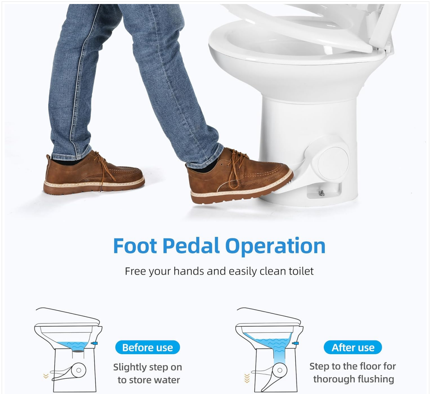
Figure 6.1: Two-step foot pedal operation for water addition and flushing.