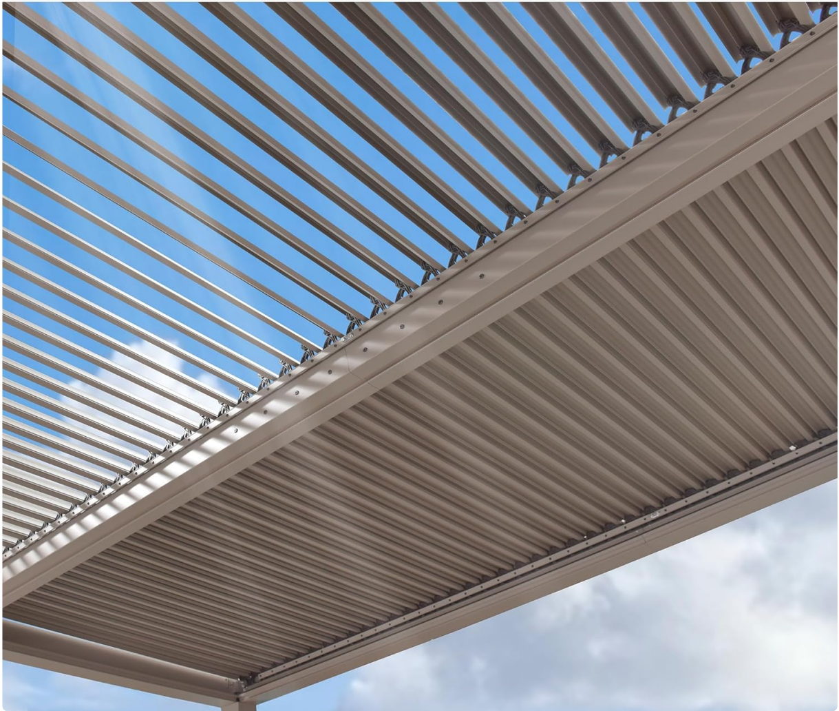
Image: Detail of the independent and adjustable louvered roof, showing rotation capability.