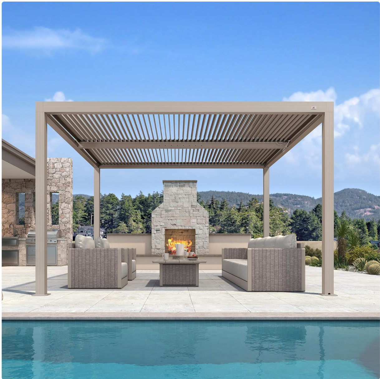
Image: The PURPLE LEAF 12' x 12' Outdoor Louvered Pergola, showcasing its design and integration into a patio setting next to a swimming pool.