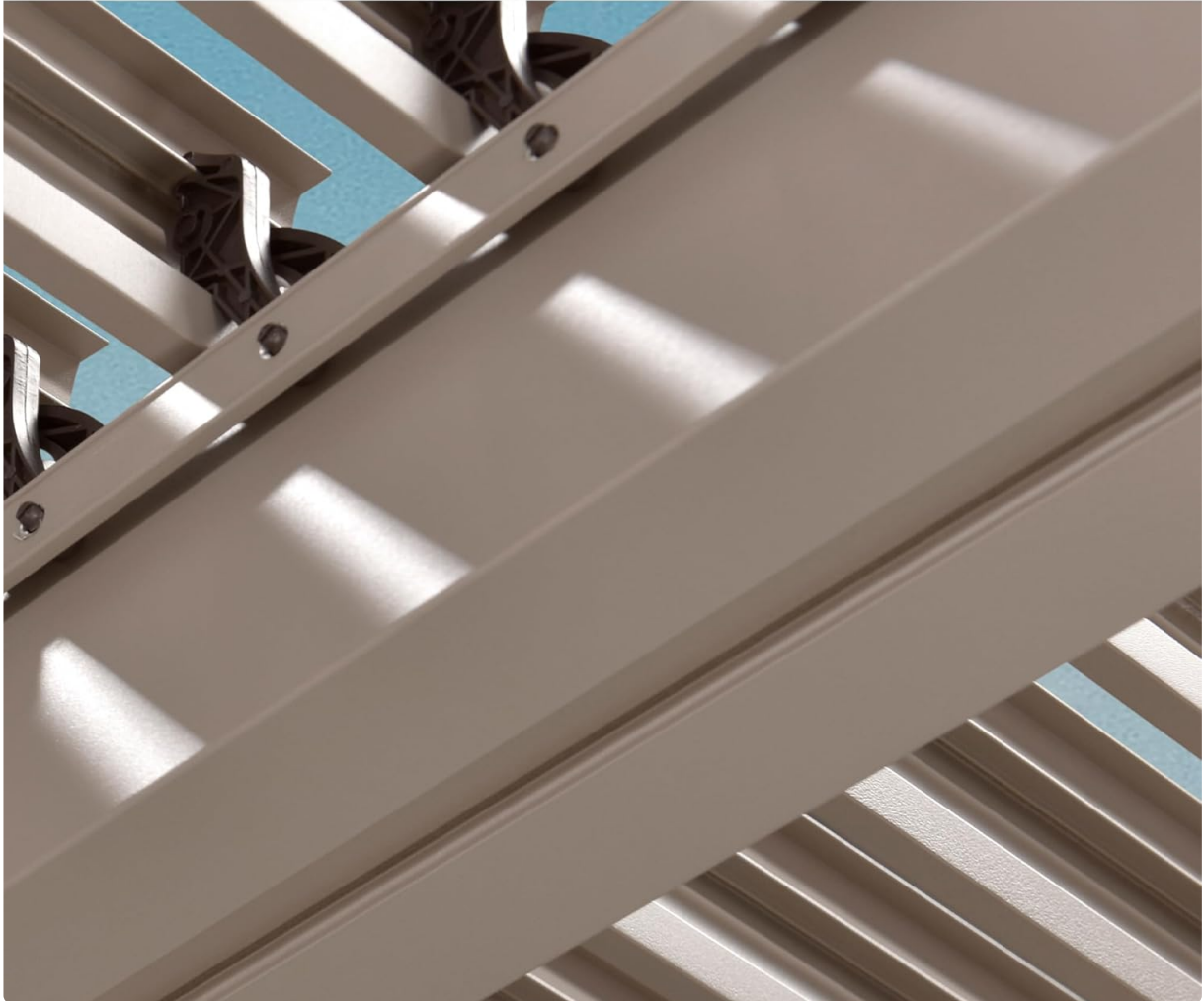
Image: A close-up view of the premium champagne powder coating, highlighting its smooth finish.

Premium champagne spray with subtle shimmer, easy to maintain.