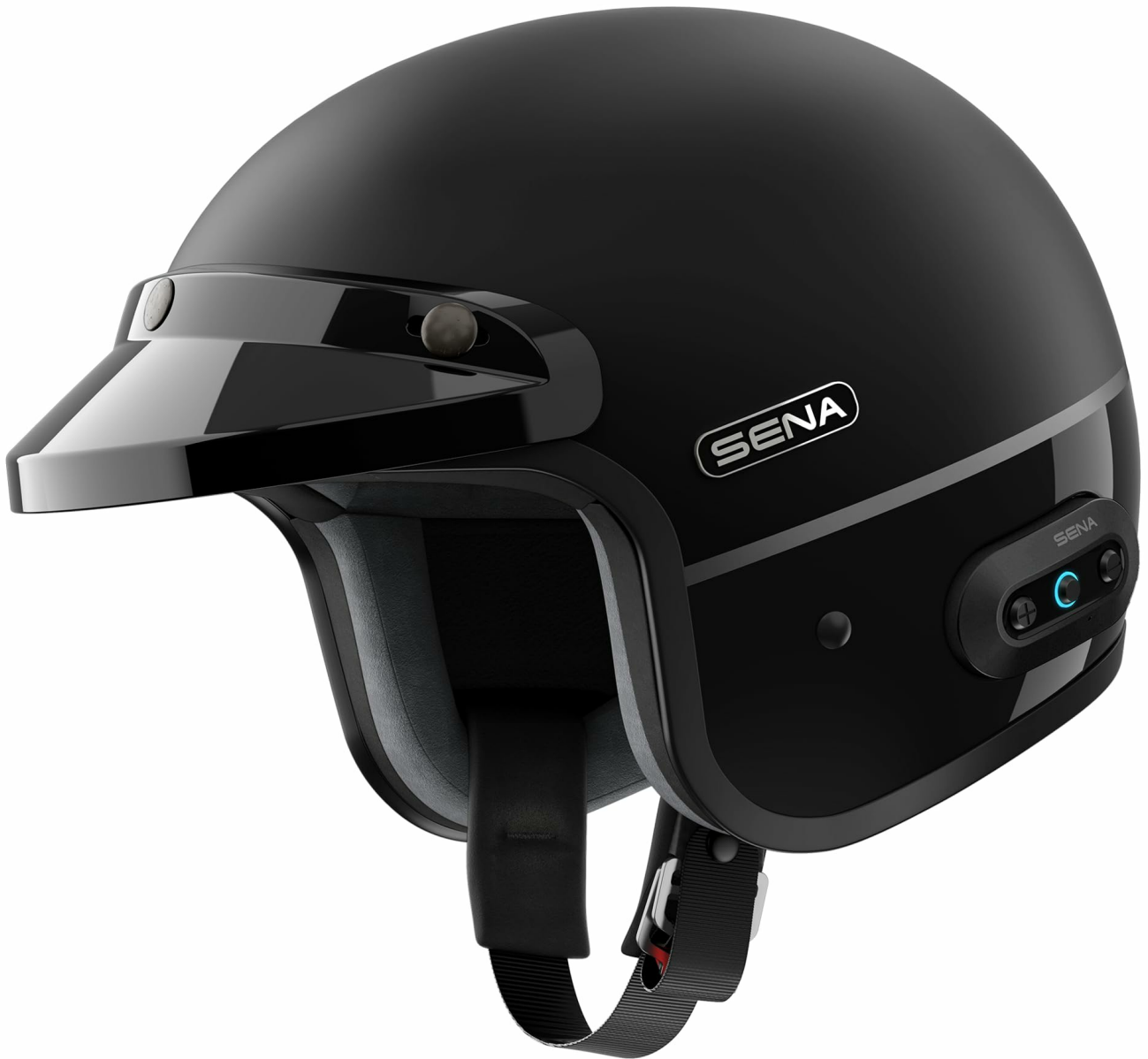
Image: Sena Surge Open Face Smart Motorcycle Helmet in Matte Black. This image displays the helmet's sleek design and integrated communication unit.