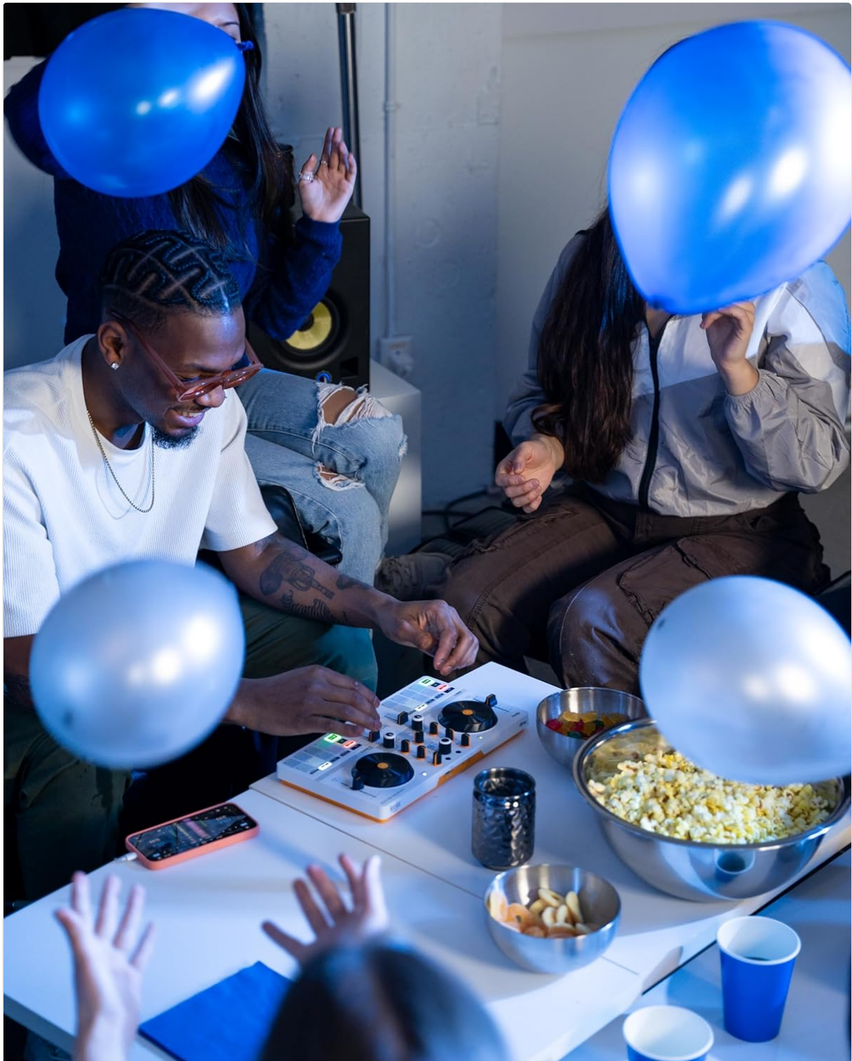
Figure 2: DJControl Mix Ultra with its protective cover, which doubles as a smartphone stand.

The included clear cover not only protects the controller during transport but also ingeniously transforms into a stand for your smartphone or tablet, providing an optimal viewing angle during your DJ sessions.