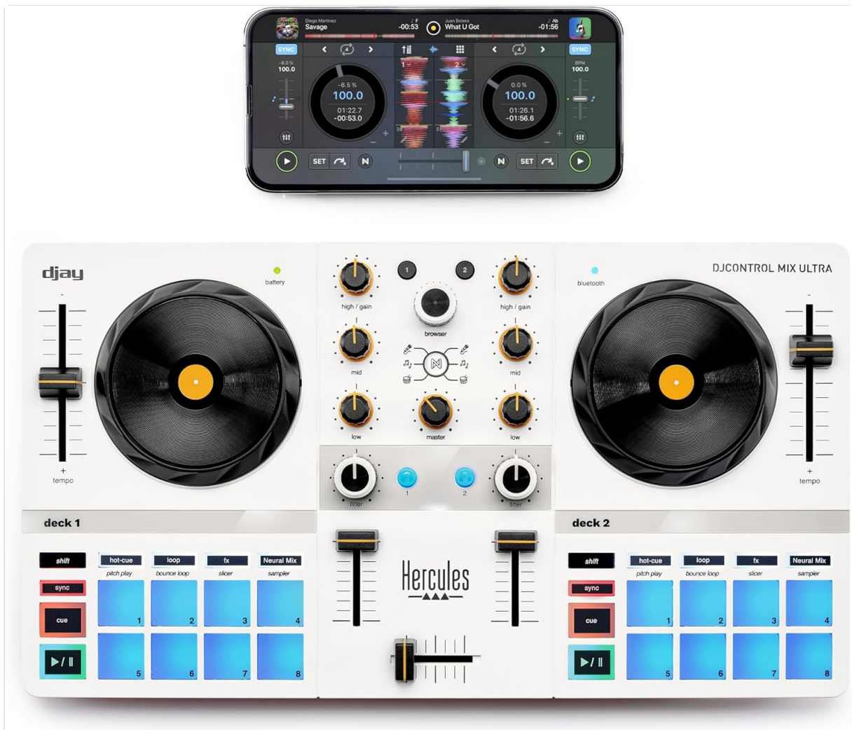
Figure 1: Front view of the Hercules DJControl Mix Ultra with a smartphone.