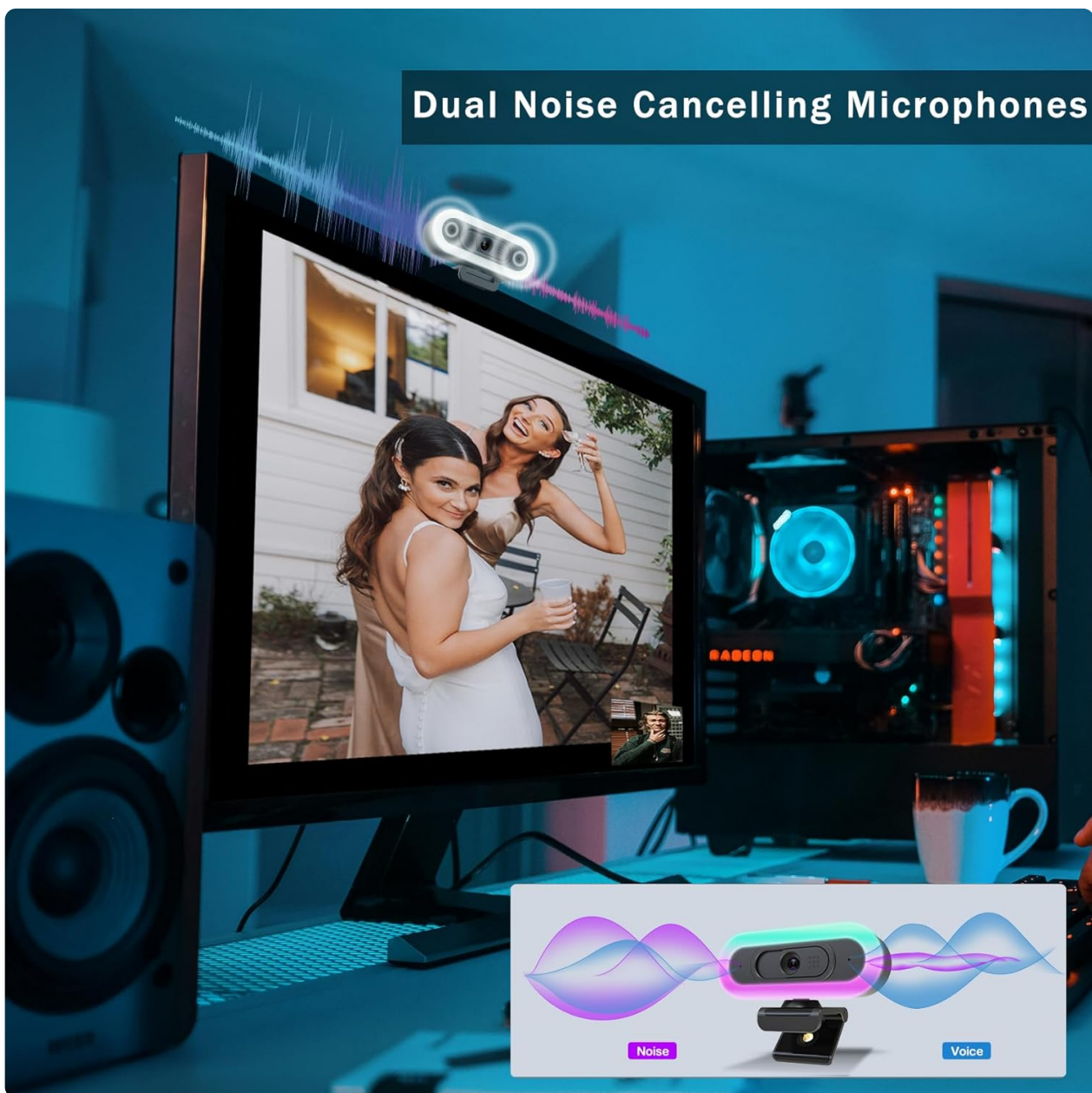
Figure 6: Dual noise-cancelling microphones for clear audio.