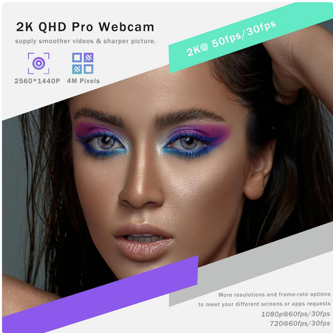
Figure 3: Supported video resolutions and frame rates.

Some applications or system configurations may default to 30fps for all resolutions (1440P/30fps, 1080p/30fps, and 720p/30fps). You can usually adjust these settings within your video conferencing or streaming software.