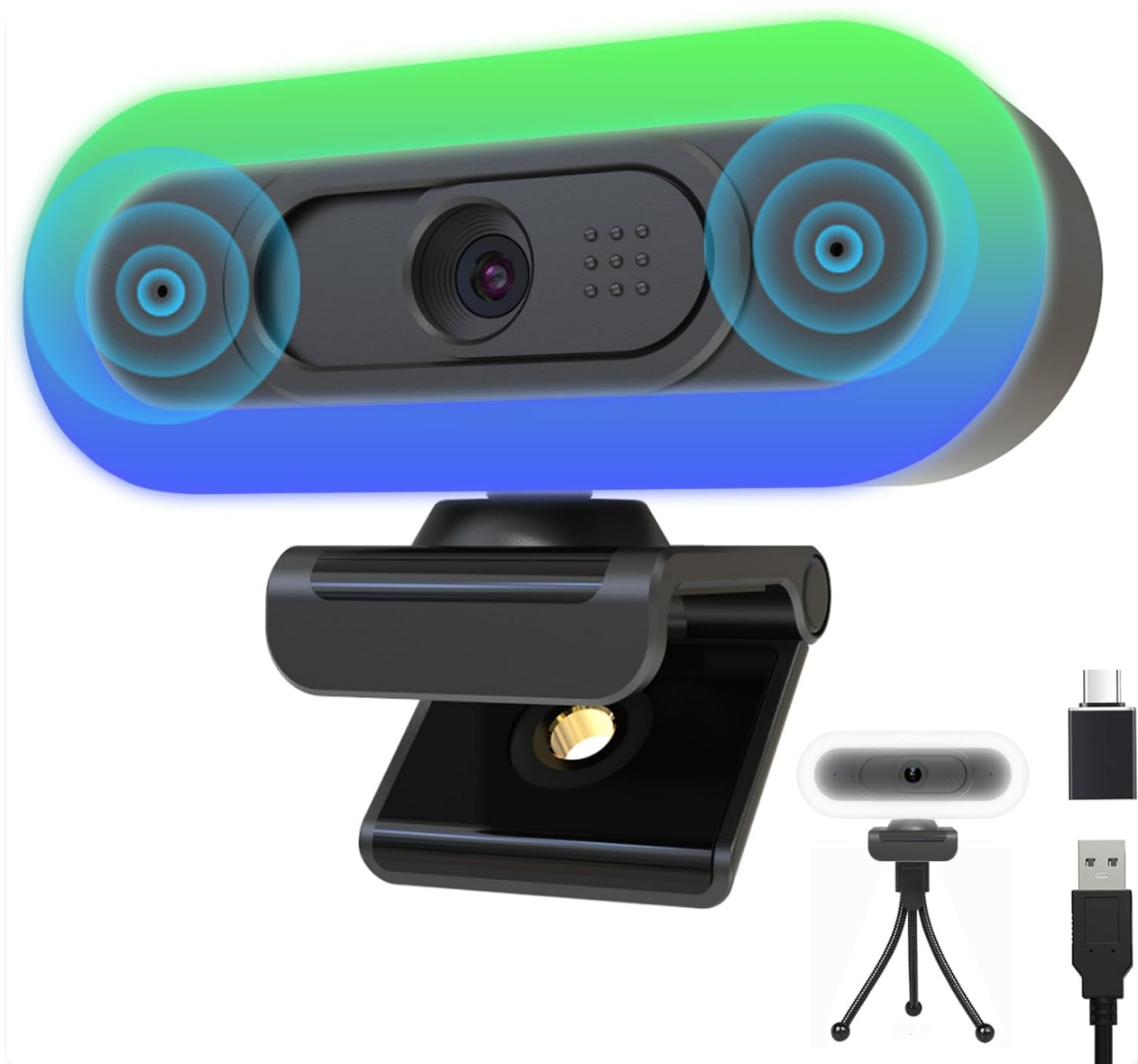
Figure 1: Hrayzan 2K Webcam with Light and included accessories.