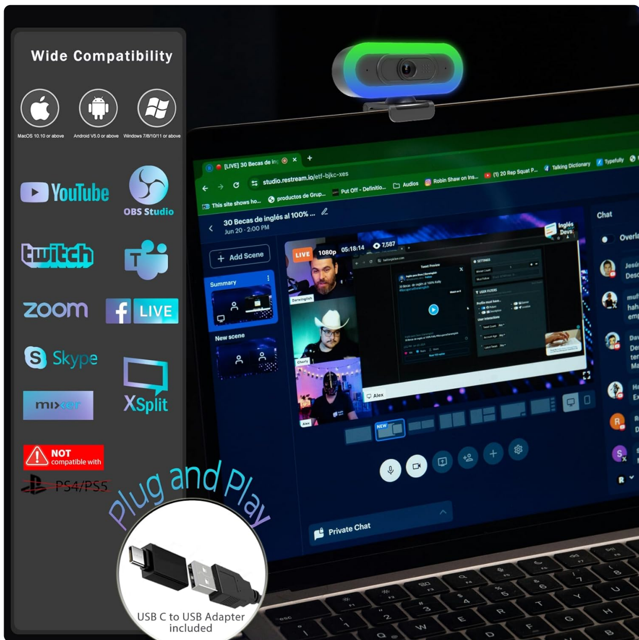
Figure 2: Plug-and-play setup and wide compatibility with various platforms.