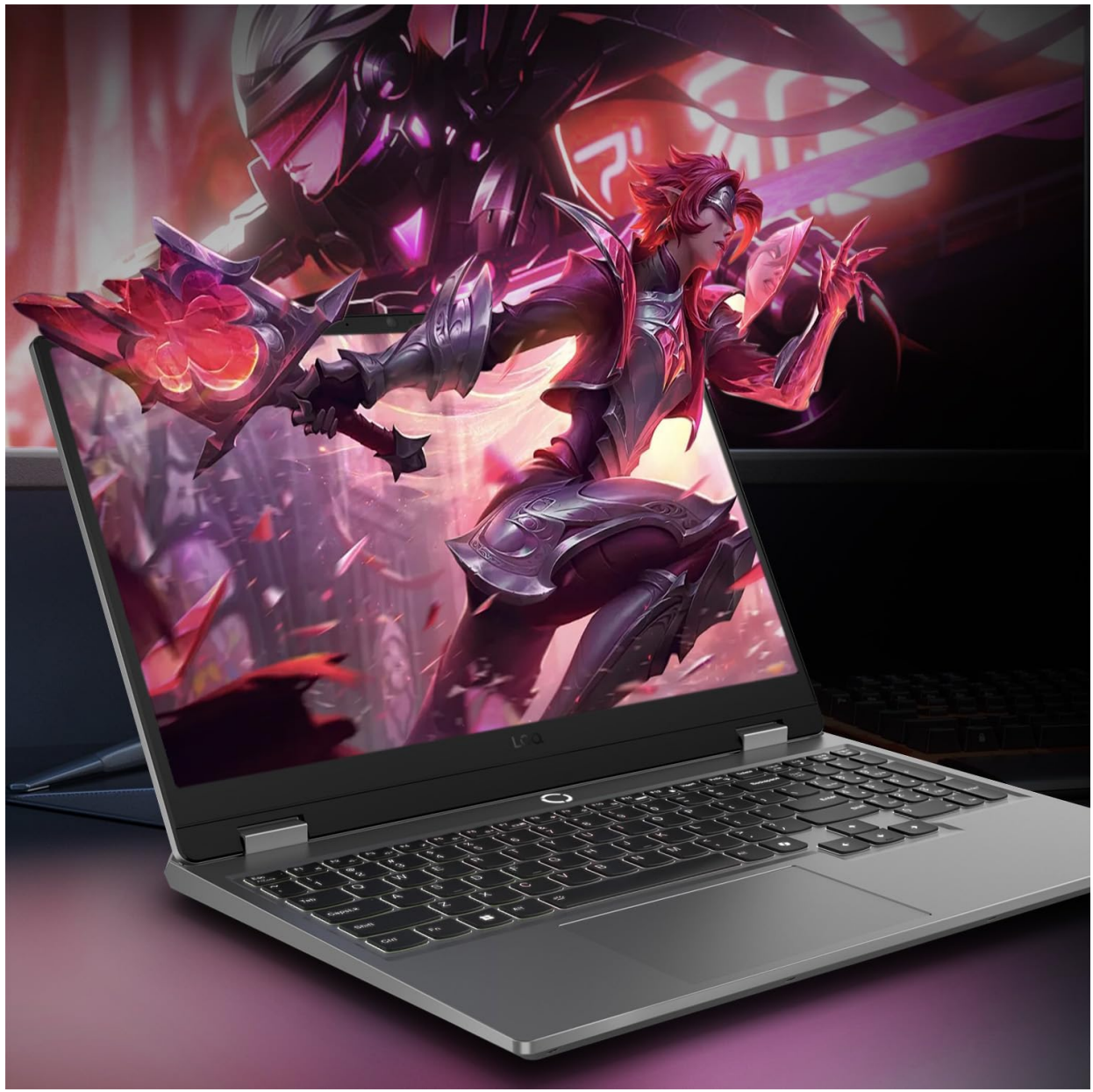
Image: Side view of the Lenovo LOQ 15 laptop, illustrating the location of various input/output ports.