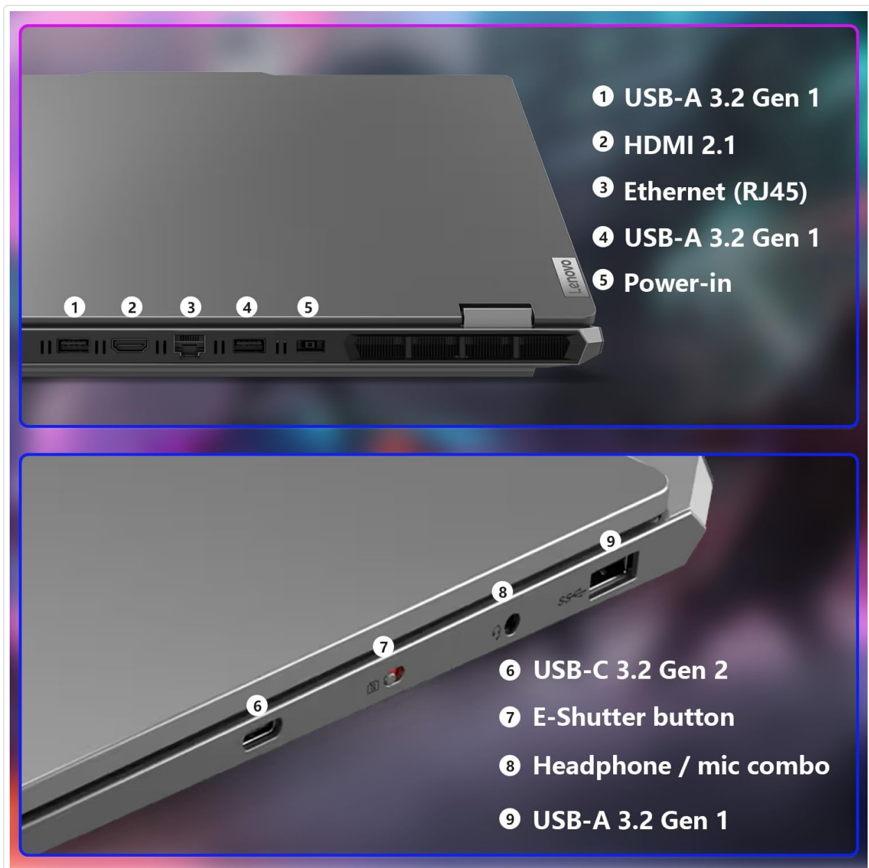
Image: An overview of the Lenovo LOQ 15 laptop's core components and features.