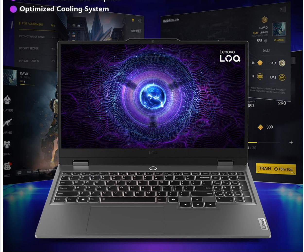
Image: The Lenovo LOQ 15 laptop in use, demonstrating its display quality during a gaming session.