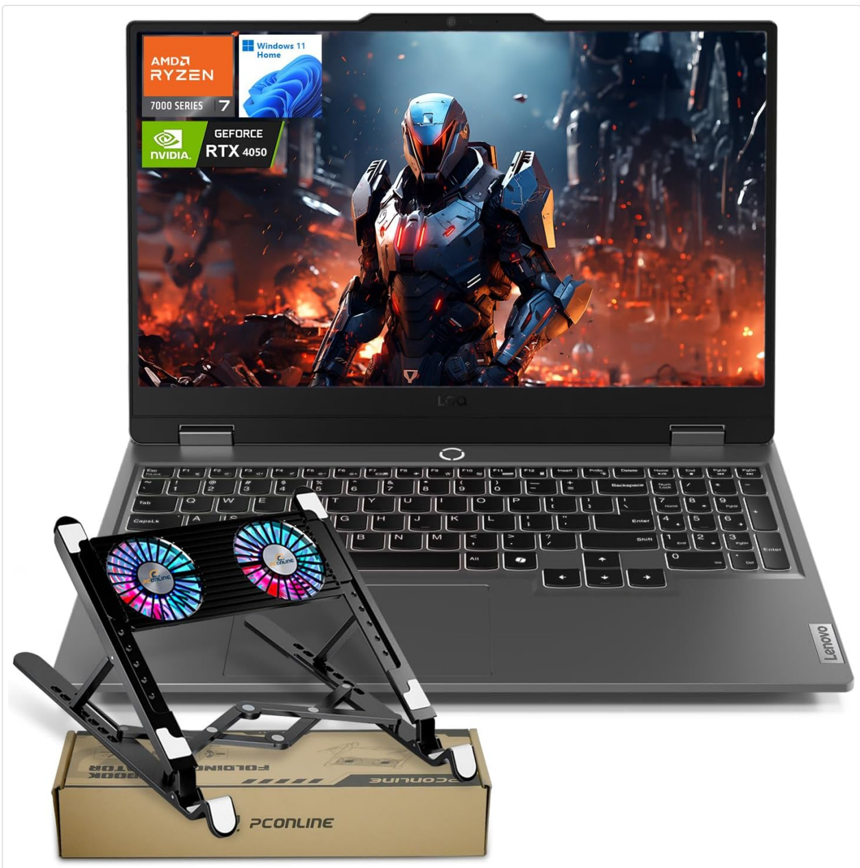
Image: The Lenovo LOQ 15 laptop, bundled with a PCO laptop cooler, providing an overview of the product.