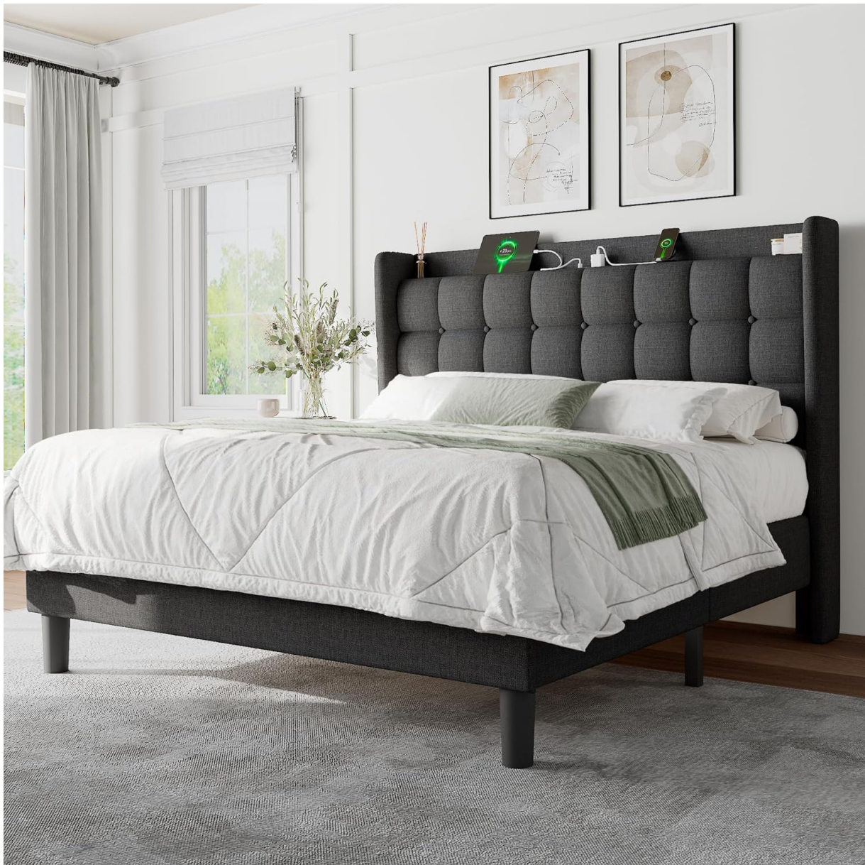
Image: The headboard's charging station in use, powering a tablet and a smartphone.