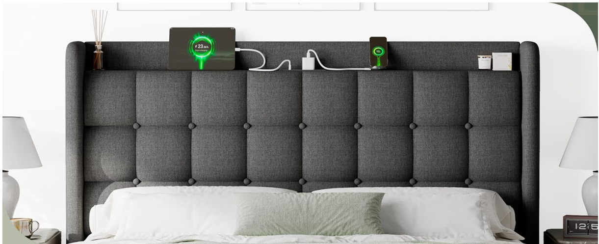
Image: The Feonase Full Bed Frame with its upholstered wingback headboard and under-bed clearance.

Thank you for choosing the Feonase Full Bed Frame. This upholstered platform bed frame is designed for comfort and convenience, featuring a built-in charging station and a wingback storage headboard. This manual provides essential information for assembly, operation, maintenance, and troubleshooting to ensure safe and optimal use of your new bed frame.