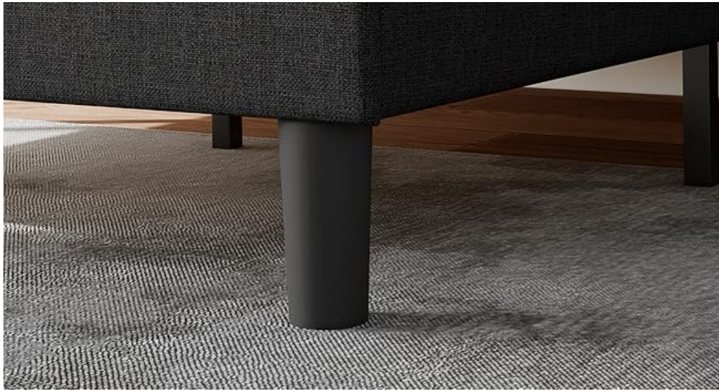
Image: Visual guide highlighting the solid stable center frame and the estimated 30-minute assembly time.

Your browser does not support the video tag.