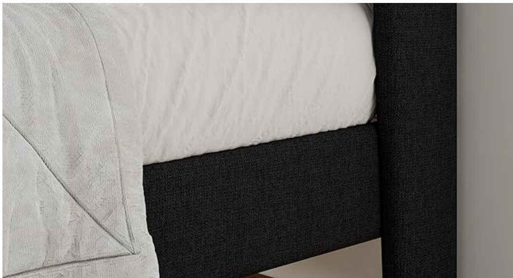
Image: Detailed dimensions of the Feonase Full Bed Frame.