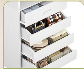
Four Pull-out Wood Drawers