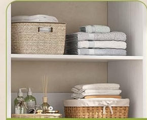
2 Adjustable Storage Shelves