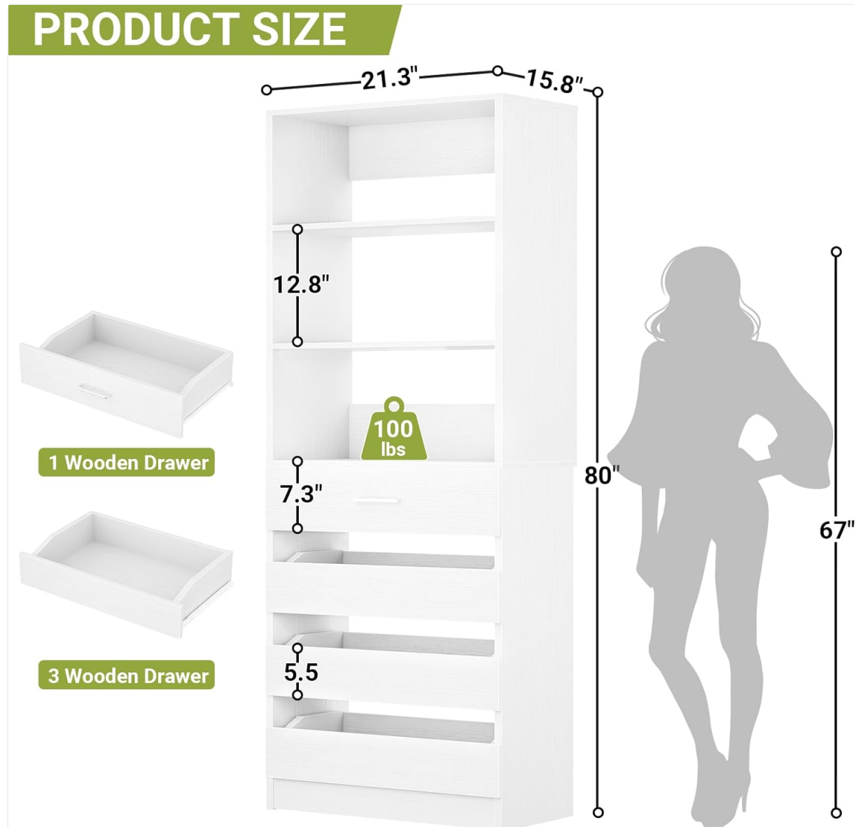
Image: Product dimensions and individual drawer components, illustrating the size and parts of the closet system.

Carefully unpack all items from the box. Lay out all wood panels and hardware. Match each component to the corresponding label in the instruction diagram. Ensure all pieces are accounted for before proceeding.