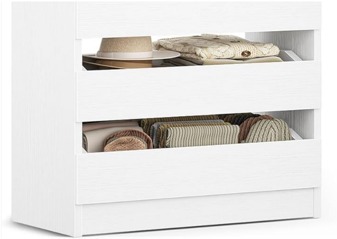
Image: The Aheaplus YH02 Closet System fully assembled and in use, showcasing its storage capabilities for various items.