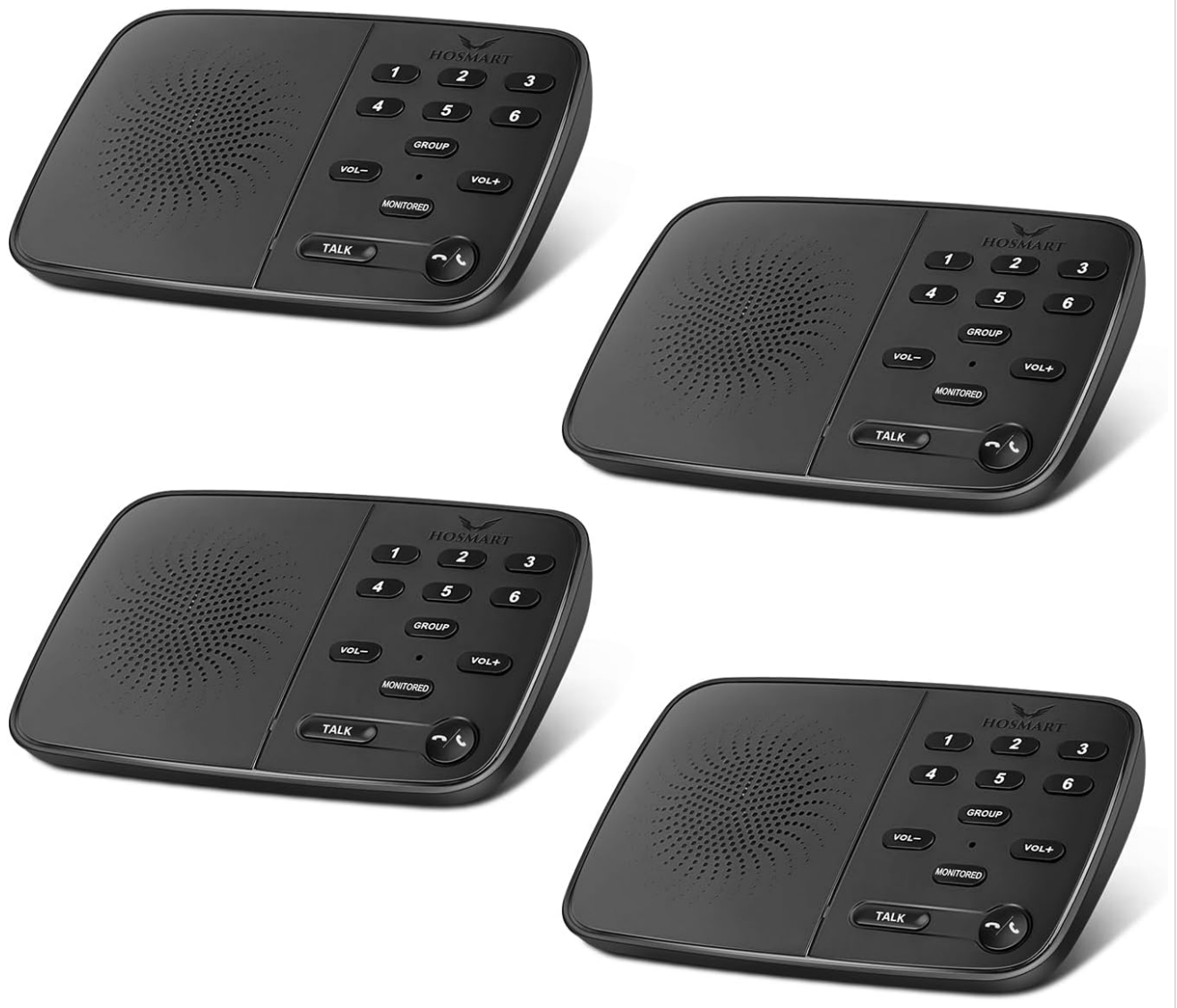
This image displays four Hosmart HY812 intercom units, highlighting their compact design and control layout, including channel selection, volume, group, monitored, and talk buttons.