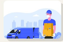
Returns And Exchanges