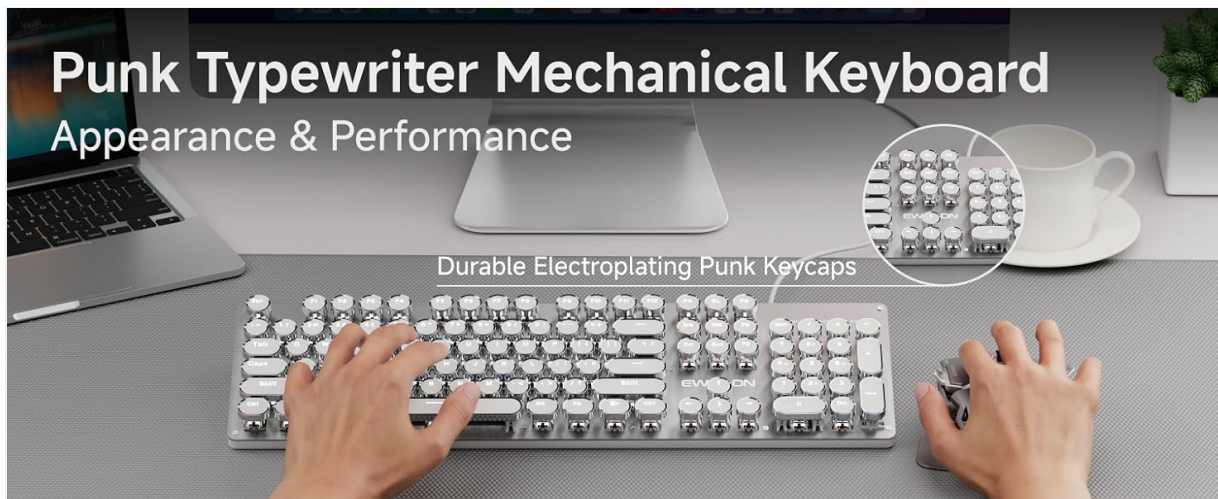
Image: The SEUNKWANG EWEADN TK100 keyboard showcasing its punk typewriter mechanical design and backlighting.

Thank you for choosing the SEUNKWANG EWEADN TK100 Wired Mechanical Keyboard. This keyboard combines a retro typewriter aesthetic with modern mechanical performance, designed for both office and gaming use. It features 104 keys, white backlighting, anti-ghosting technology, and durable blue mechanical switches for a tactile and clicky typing experience.