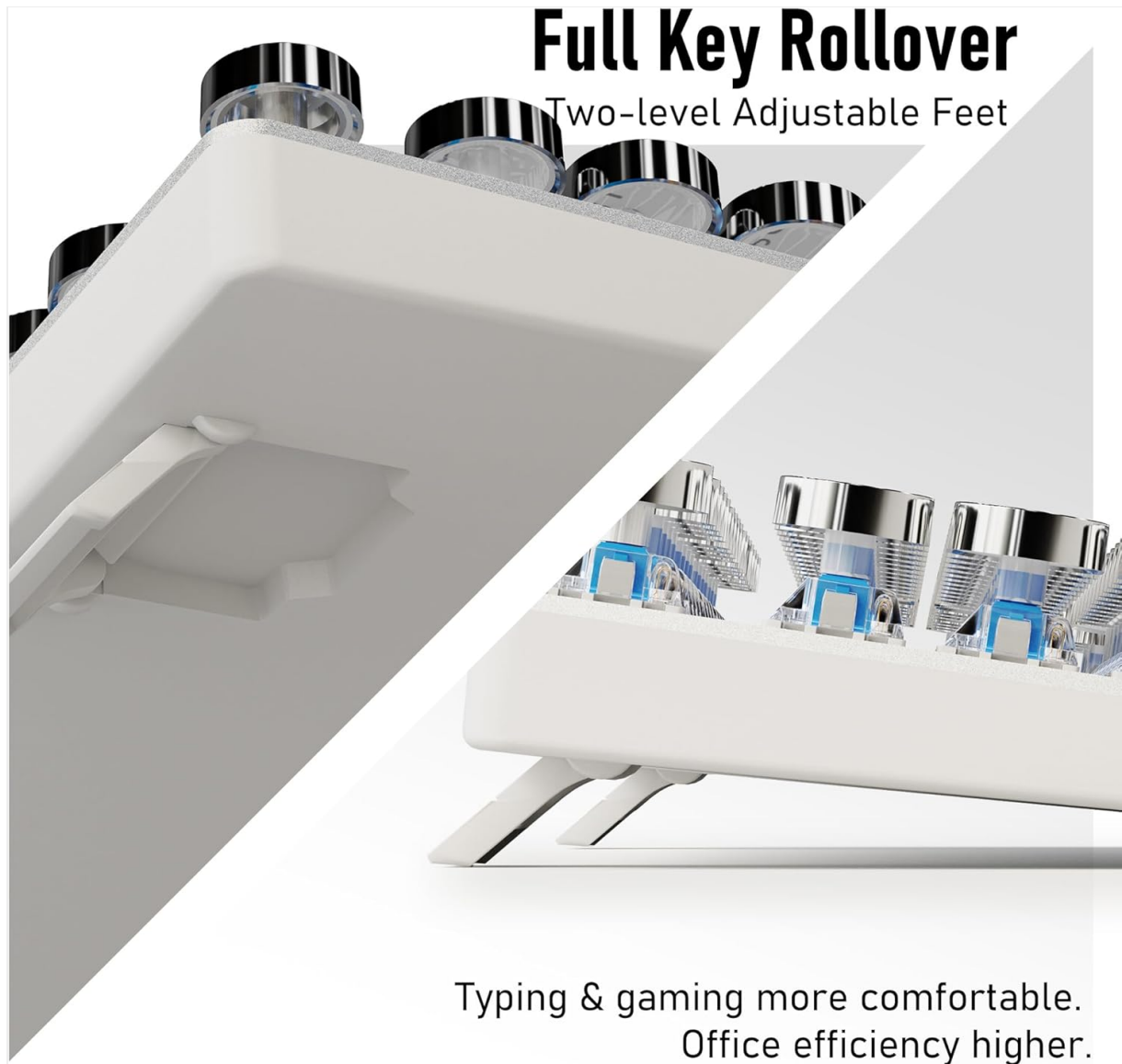
Image: The TK100 keyboard's two-level adjustable feet, designed for ergonomic typing.

The keyboard features adjustable feet on the underside to customize the typing angle for improved comfort and reduced fatigue during long sessions.