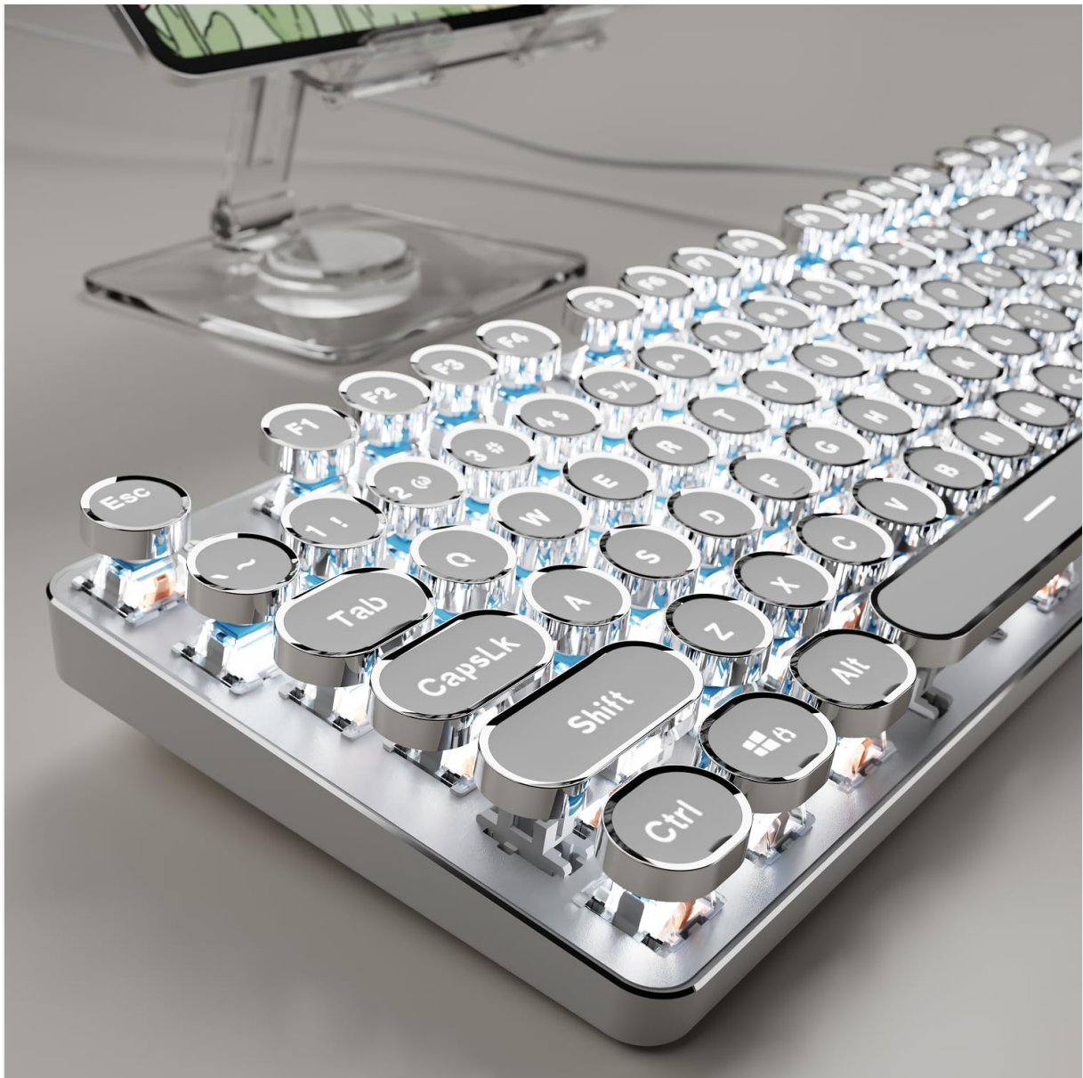
Image: The TK100 keyboard ready for use, highlighting its wired connection for reliable performance.