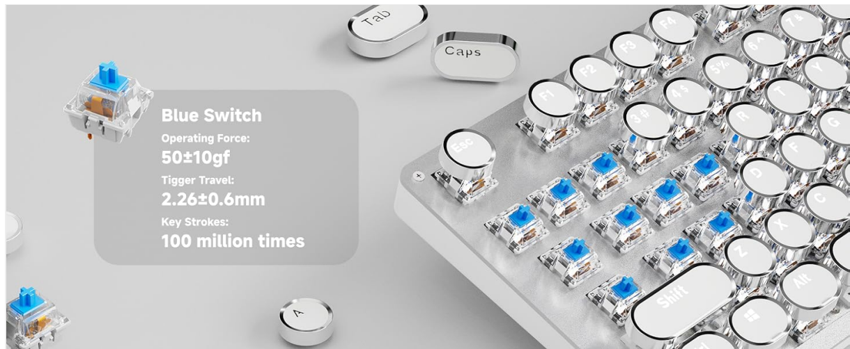
Image: Detailed specifications of the blue mechanical switches, including operating force, trigger travel, and key strokes durability.