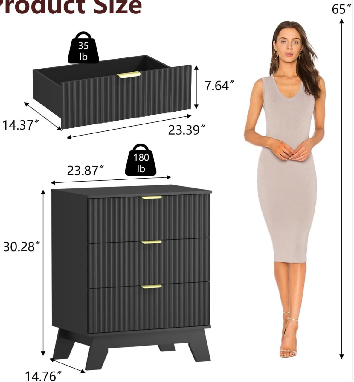
Image 8.1: A diagram illustrating the product dimensions, including depth, width, and height of the nightstand, as well as the internal dimensions and weight capacity of a single drawer.