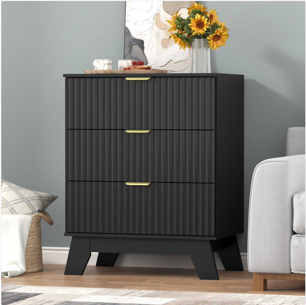
Image 1.1: The Thacuok Nightstand with 3 Large Drawers in Black. This image displays the fully assembled nightstand, highlighting its fluted panel design and gold-colored handles, positioned next to a sofa in a living room setting.