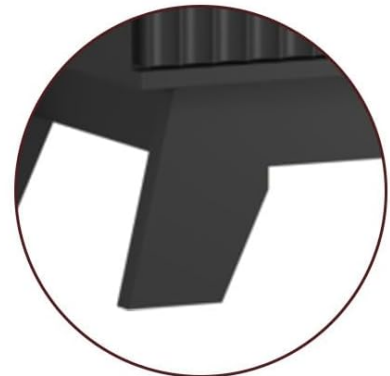
Stable Support Base