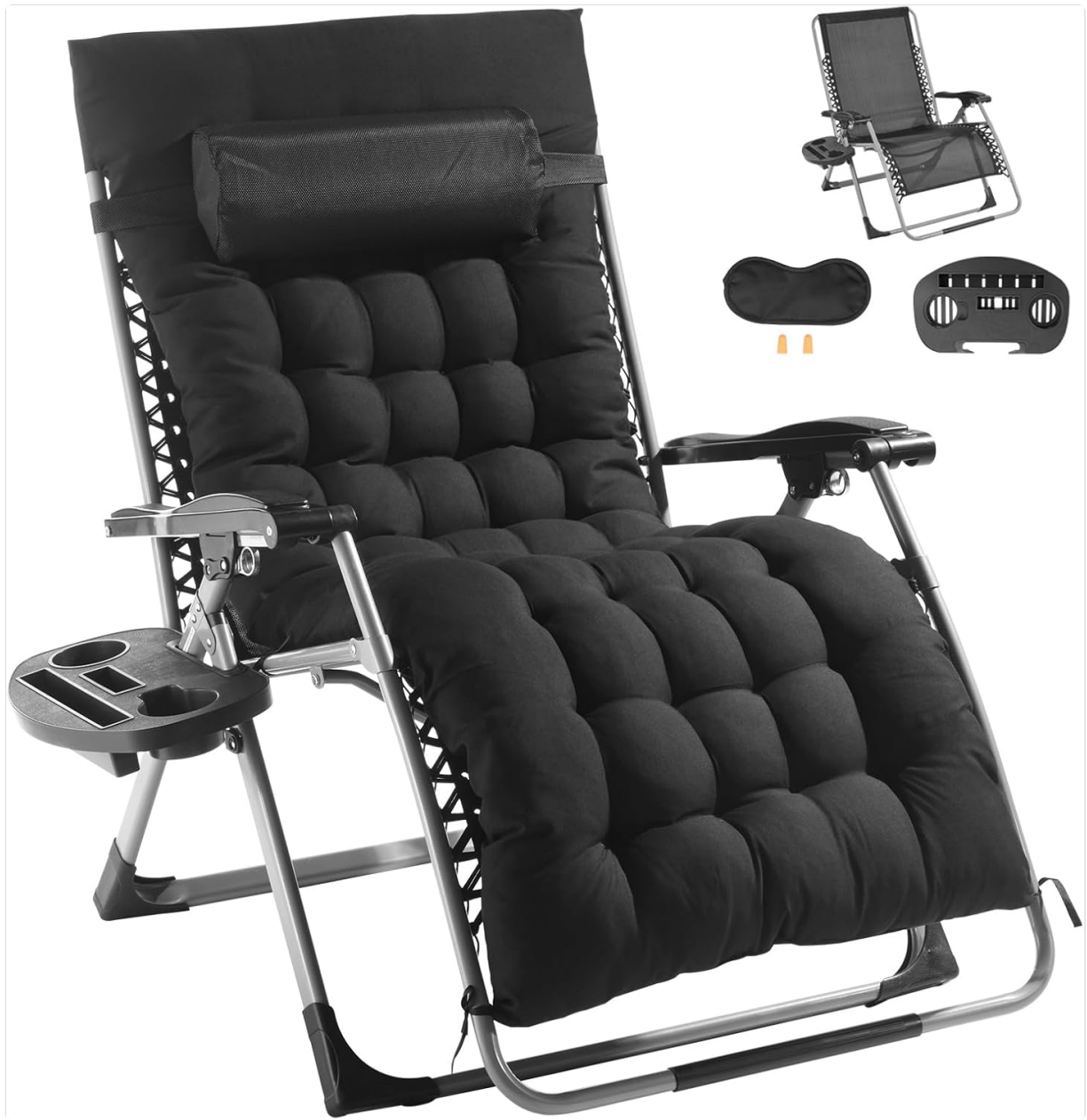
Figure 4.1: The Happybuy Zero Gravity Chair fully assembled, showcasing the cushion, headrest, and detachable side tray with cup and phone holders.