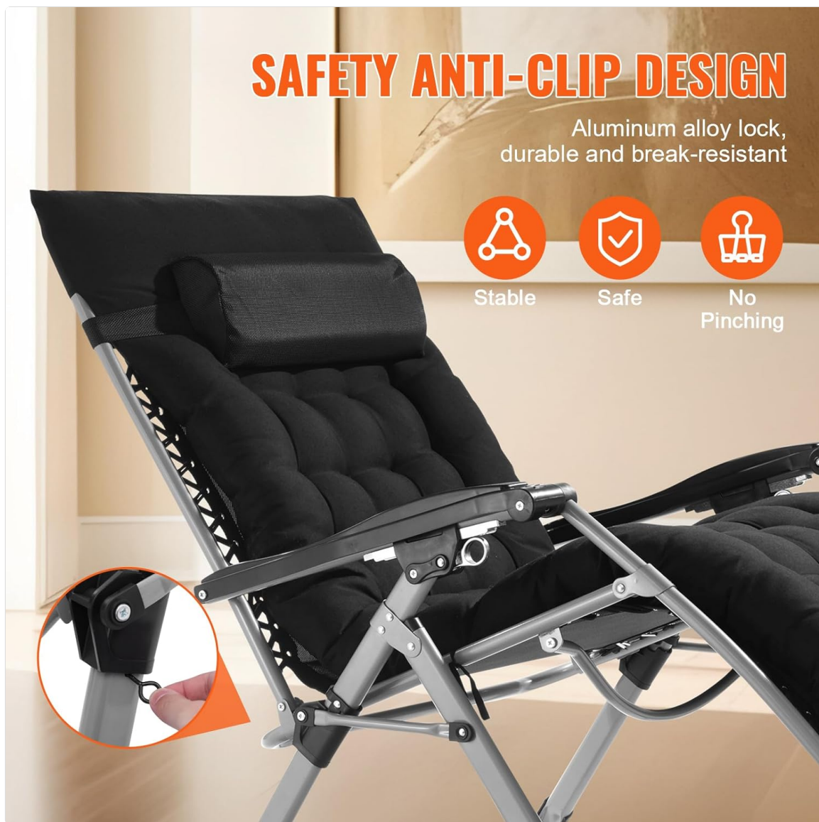
Figure 5.2: Detail of the aluminum alloy lock mechanism, designed for stability and safety during recline.