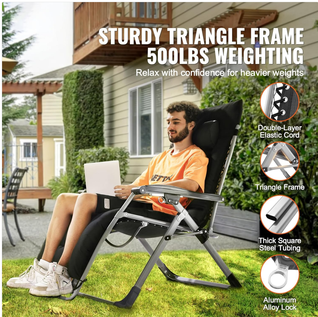
Figure 2.1: Illustration highlighting the robust construction of the chair, including the triangular frame, thick square steel tubing, double-layer elastic cords, and aluminum alloy lock, supporting up to 500 lbs.