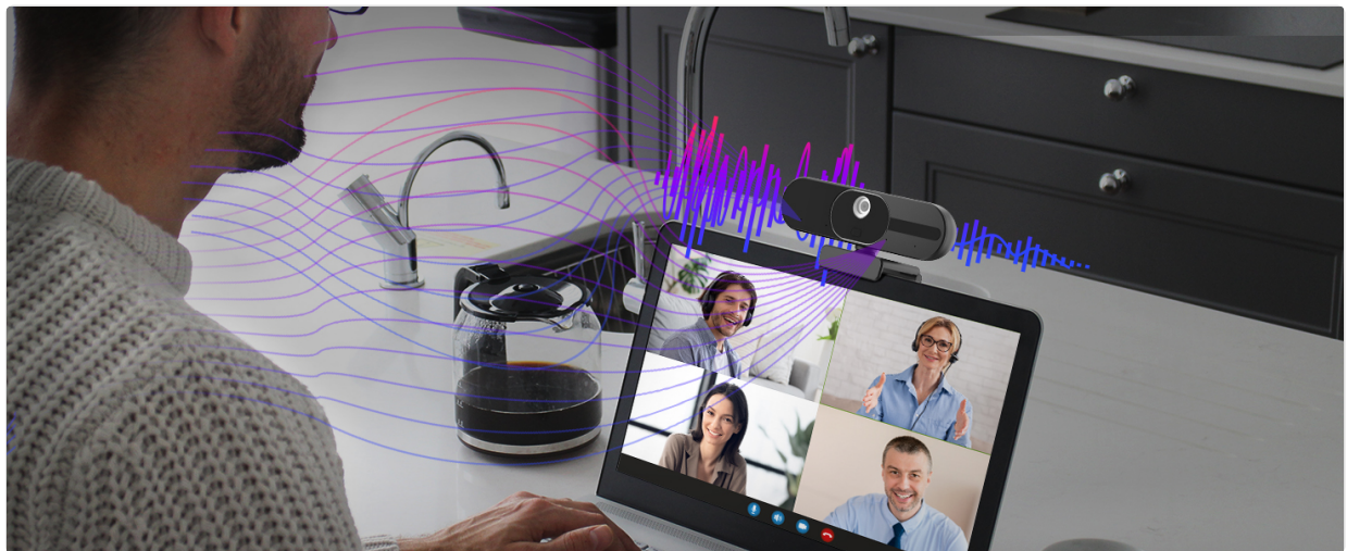
Image: The image depicts the VIZOLINK V21 Webcam mounted on a laptop, with visual cues indicating the functionality of its four noise-canceling microphones and built-in speakers. Sound waves are shown being captured and processed, emphasizing the webcam's ability to deliver clear audio by reducing ambient noise.

Equipped with four built-in noise-reducing microphones and speakers, the webcam intelligently reduces background noise and automatically captures voices within 6 meters without delay. The integrated speakers allow for direct audio playback.