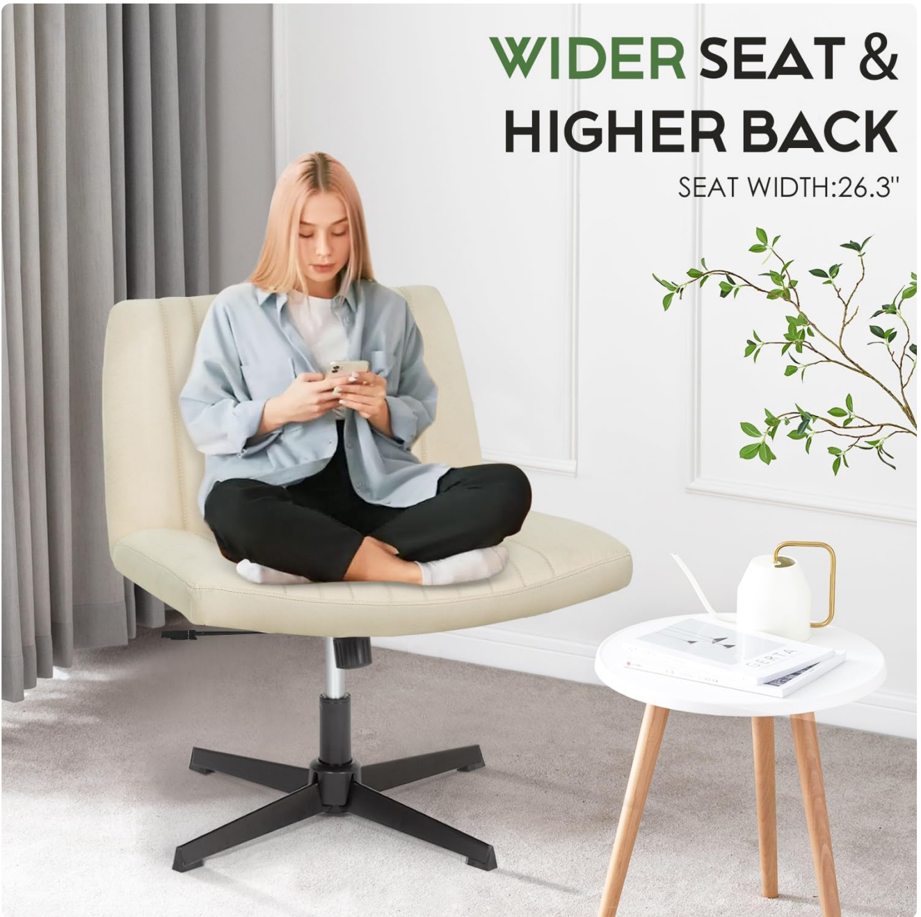
Image 8.1: Visual representation of the chair's dimensions, including seat width, back height, and adjustable seat height range.