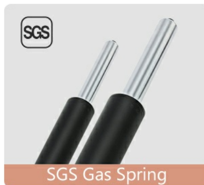
SGS Gas Spring