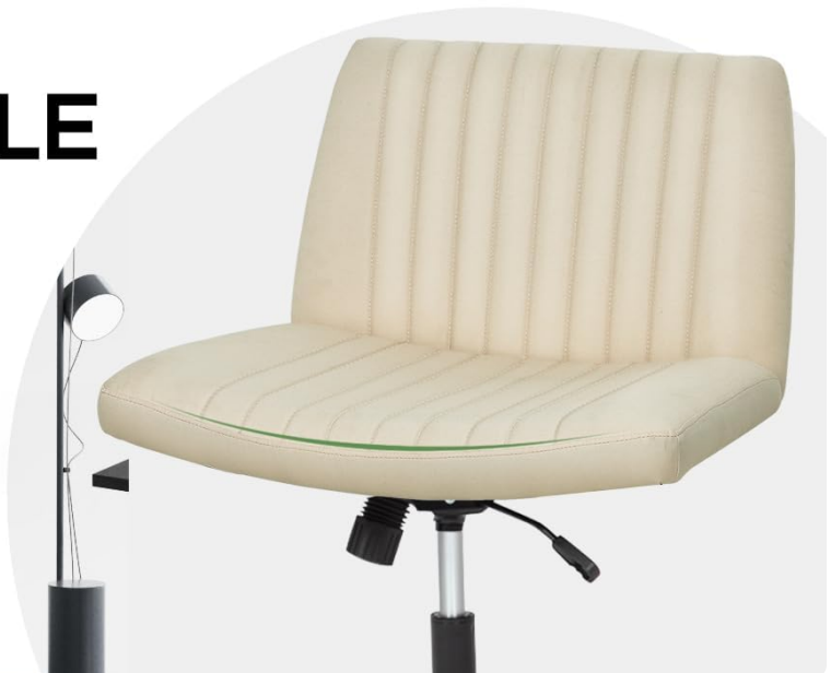
Image 5.1: The control lever for adjusting seat height and enabling 360-degree swivel.

FITS THE CURVES OF THE HUMAN BODY AND PROVIDES COMFORTABLE SUPPORT