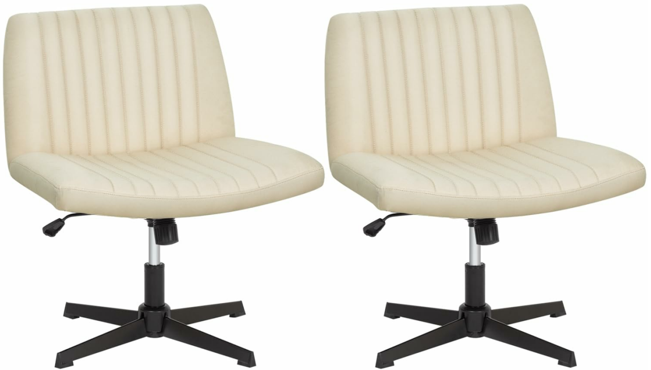
Image 1.1: The PayLessHere Criss Cross Chair, showcasing its beige upholstery and black metal base.