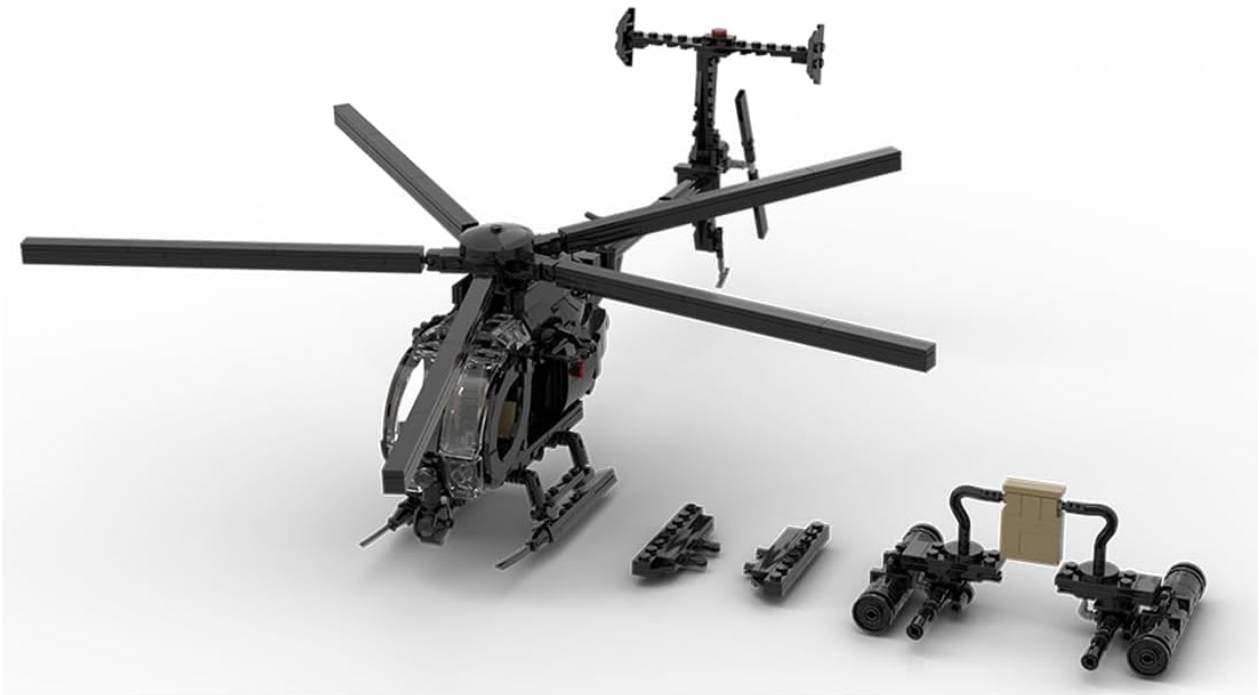
The assembled MH-6 Little Bird Helicopter Model displayed with its various detachable weapon accessories.