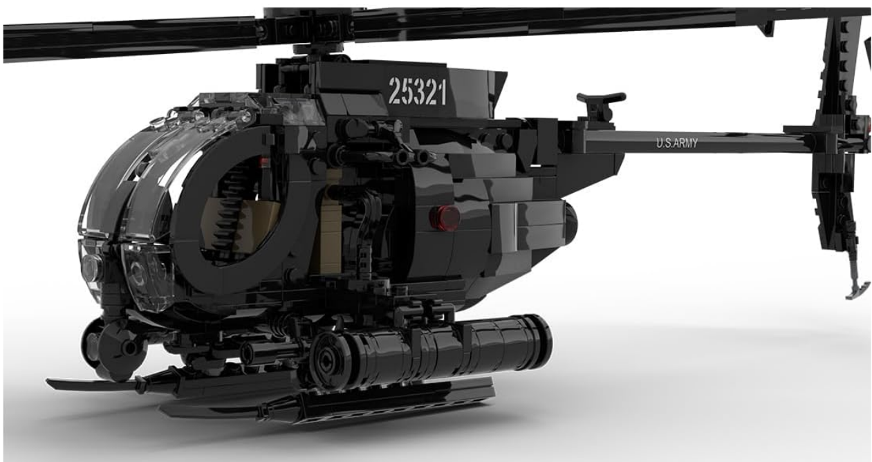
A close-up side view of the assembled MH-6 Little Bird Helicopter Model, emphasizing the cockpit and intricate side details.