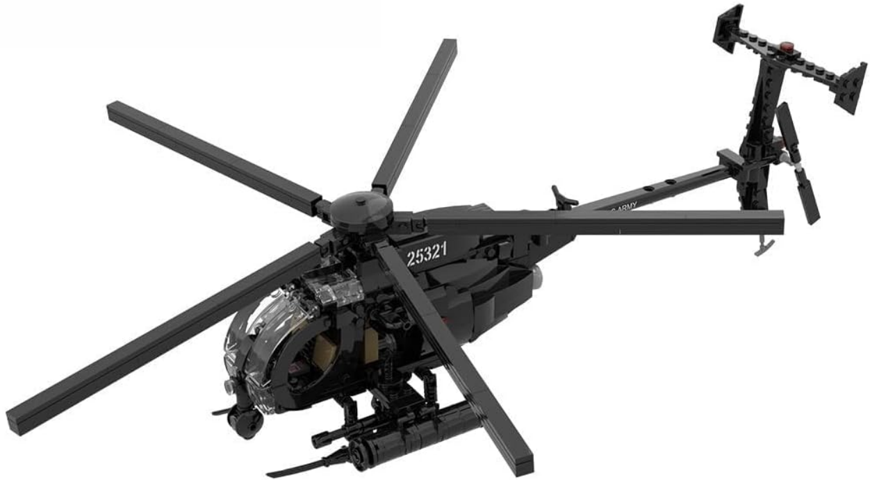
The WOWOBONTOY MH-6 Little Bird Helicopter Model building set, showcasing the product box and the fully assembled model.