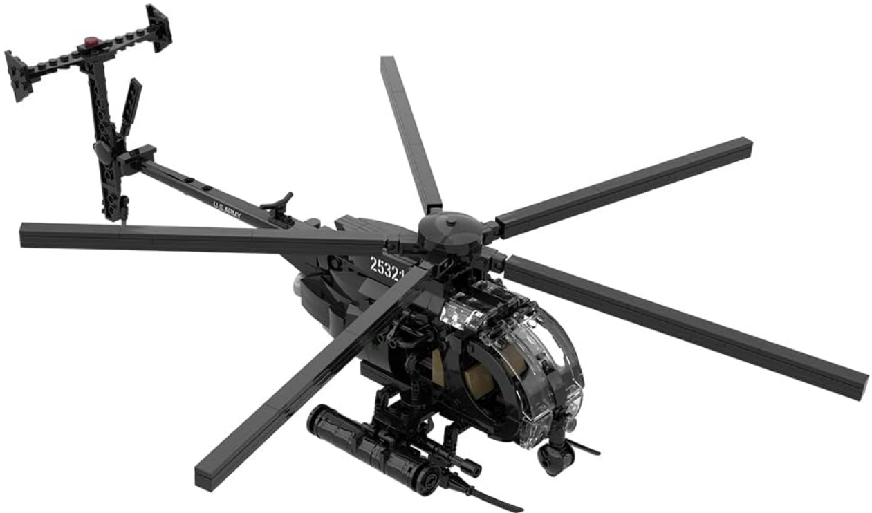
An assembled MH-6 Little Bird Helicopter Model viewed from a rear-side angle.