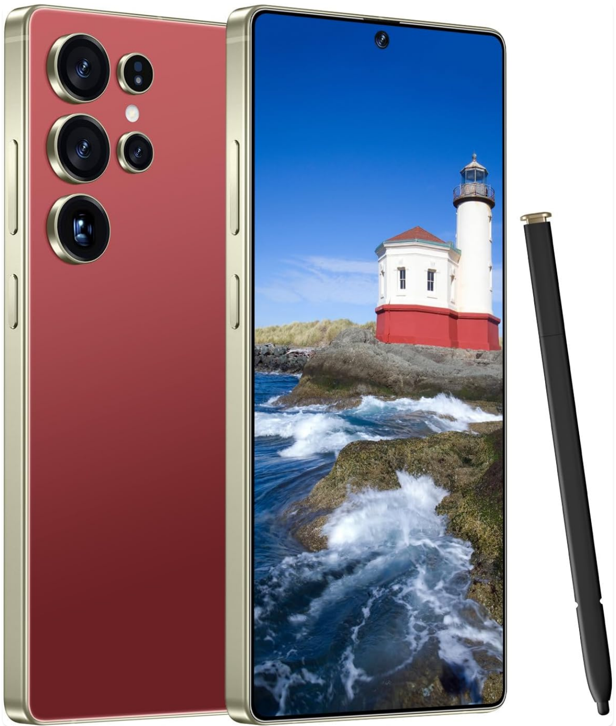
Figure 1: Ecshock I25 Ultra 5G Smartphone with included stylus.