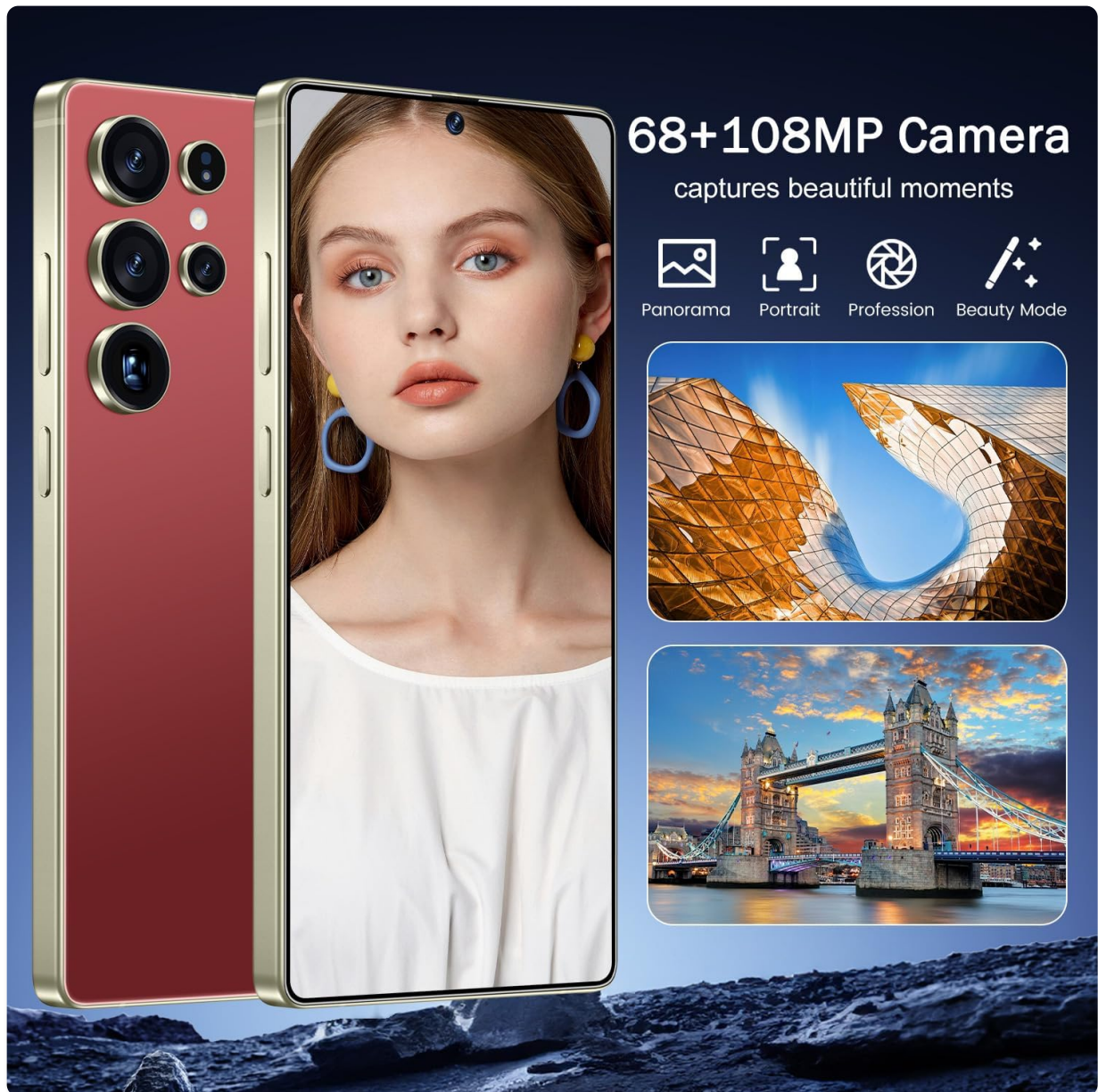
Figure 3: The smartphone's camera interface highlighting various modes and resolutions.

Capture high-quality photos and videos with the advanced camera system. The rear setup includes a 108MP main camera and a 68MP secondary camera, complemented by a 68MP front-facing camera for clear selfies and video calls.