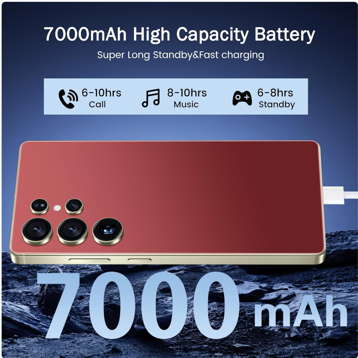
Figure 5: The 7000mAh high-capacity battery ensures long-lasting power.