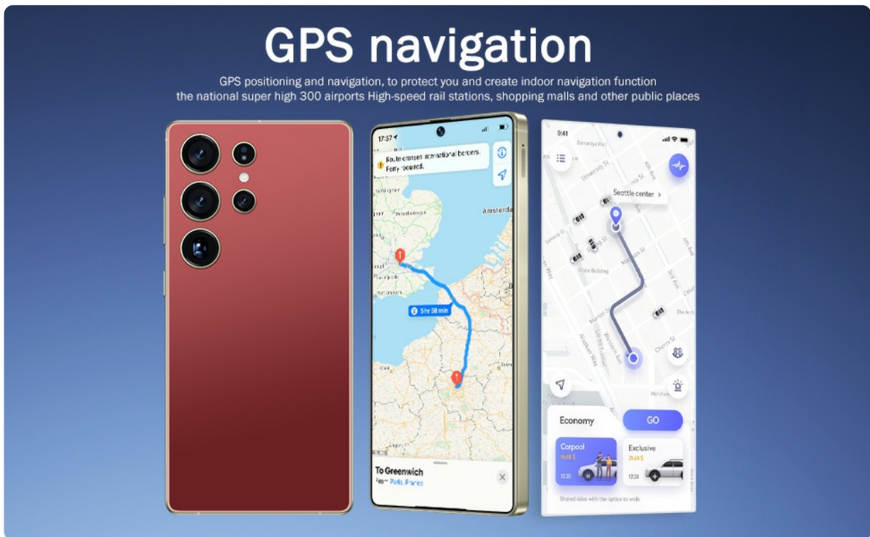
Figure 7: GPS navigation capabilities for precise location tracking and route guidance.

The device supports 5G/4G connectivity for fast internet speeds and reliable network access. It also includes GPS functionality for accurate positioning and navigation, useful for travel and location-based services.