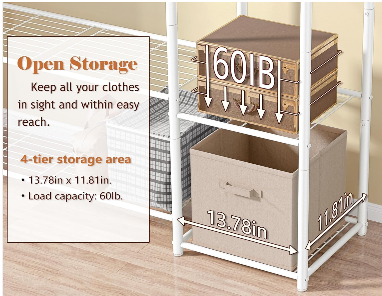
Image: The open storage design allows for easy access and visibility. Each 4-tier storage area measures 13.78in x 11.81in and has a load capacity of 60lb.

This freestanding closet system is adaptable for use in bedrooms, cloakrooms, entrances, nurseries, or even as a plant rack on a balcony. Its neutral design complements various home decor styles.