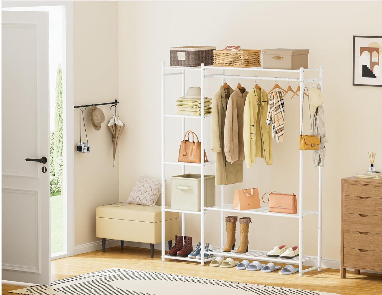
Image: Example of the wardrobe closet in a bedroom, demonstrating its practical application for organizing various items.

Image: Flexible storage options include a dedicated hanging rod area, a 4th-floor storage area, a 2-layer shoe rack area, and three additional hooks for accessories.