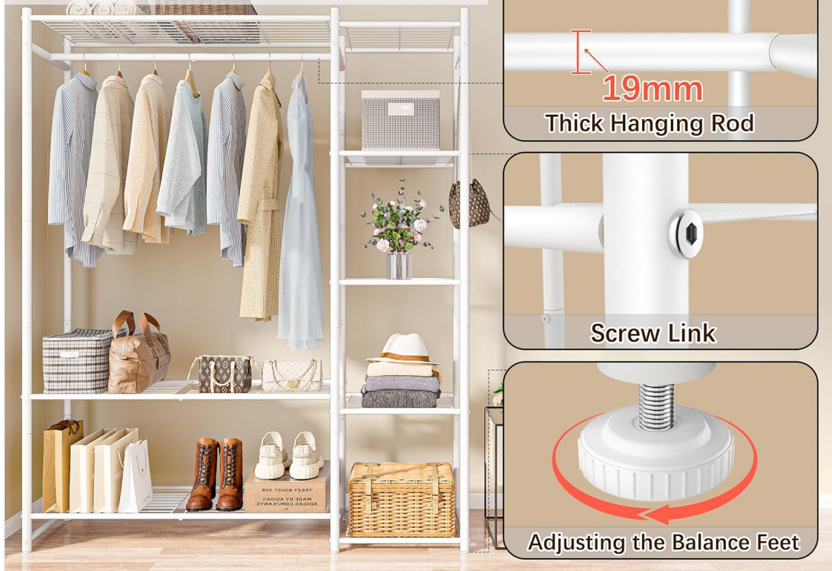
Image: Details of the wardrobe's construction, highlighting the 19mm thick hanging rod, secure screw links, and adjustable balance feet for stability.