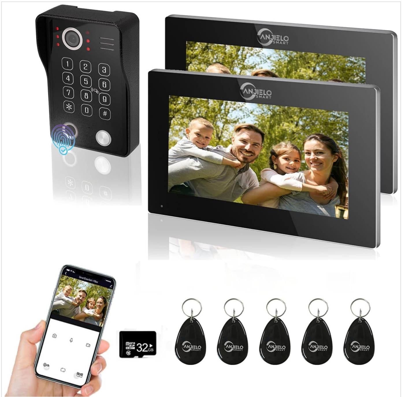
Figure 3.1: Overview of System Components