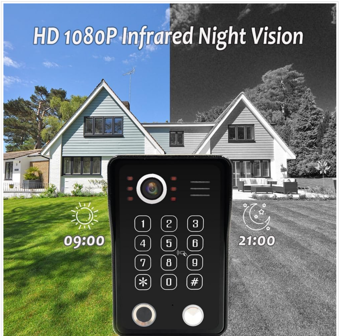
Figure 5.4: HD 1080P Infrared Night Vision