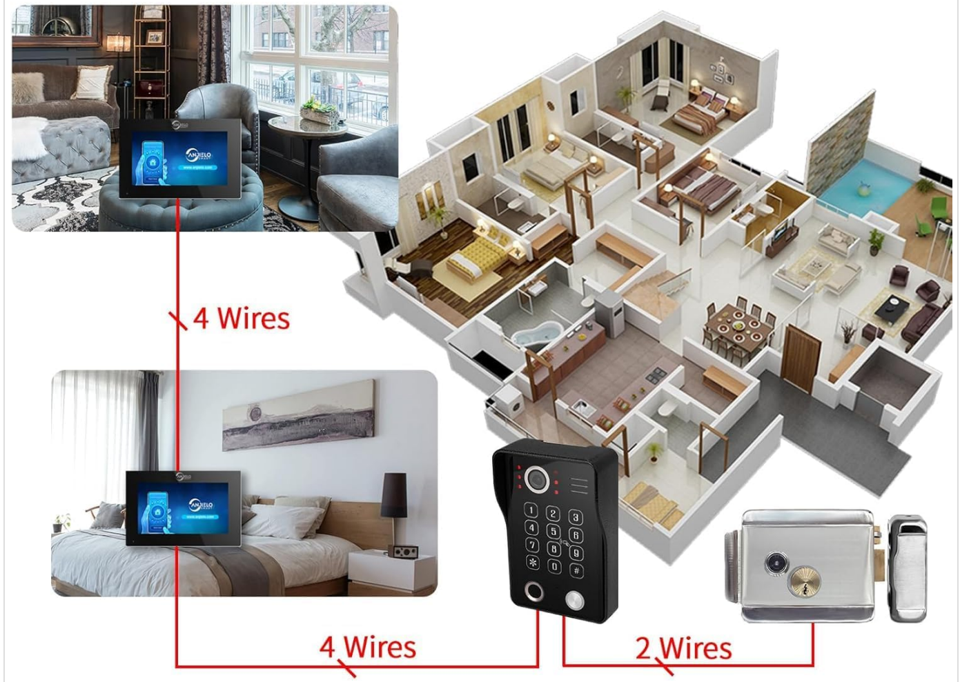
Figure 4.1: System Wiring Diagram

This doorbell system supports the connection of 12V electronic door locks (door locks are not included in the package)