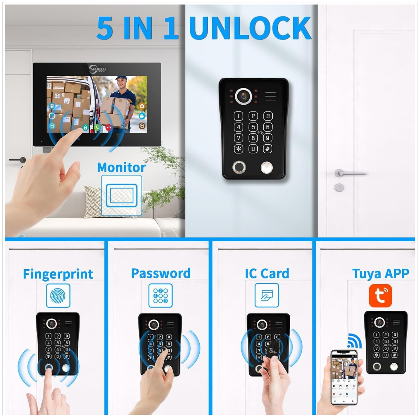
Figure 5.1: Five Unlocking Methods

The outdoor doorbell supports five methods for unlocking your door: