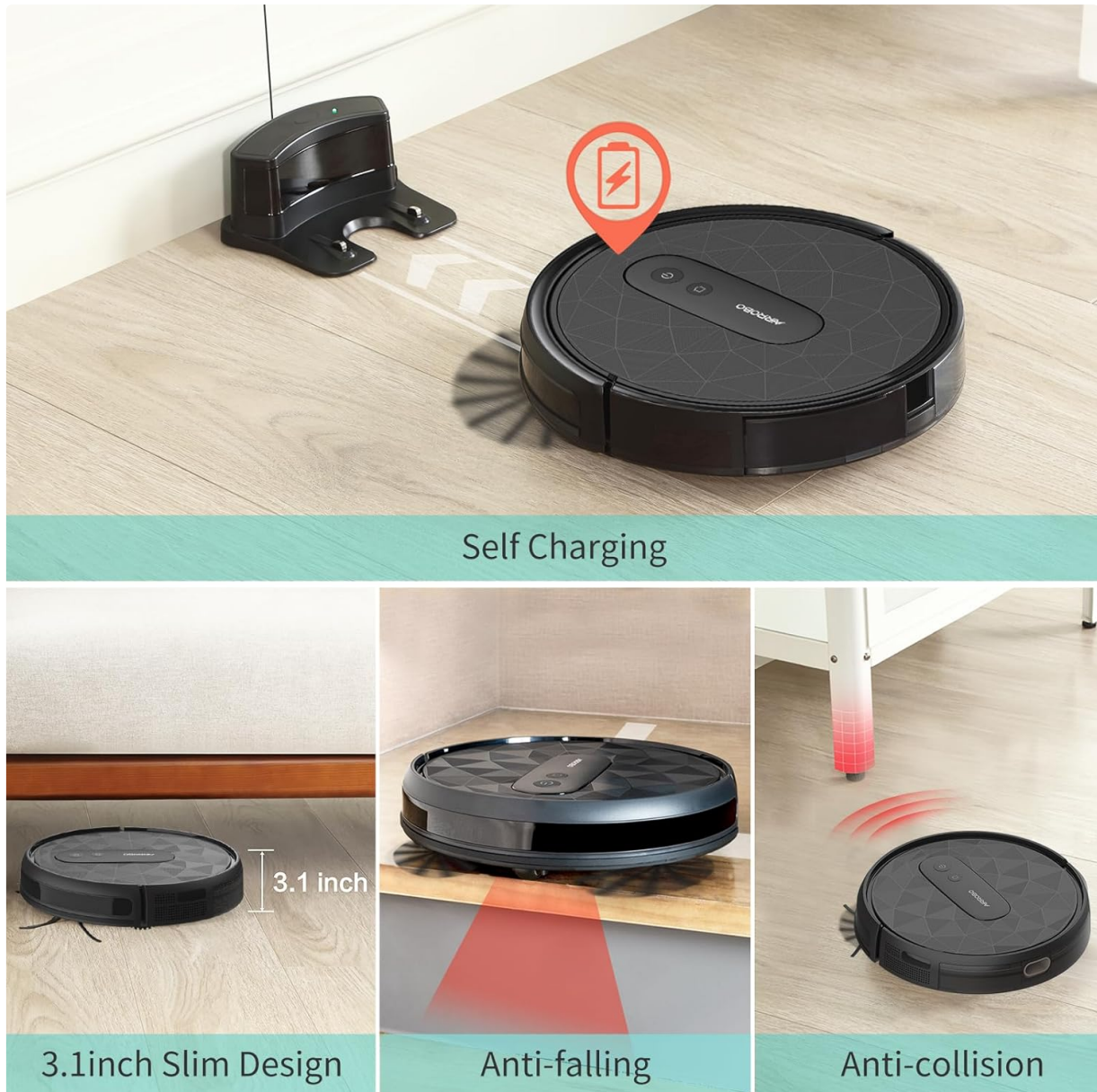
Figure 2: Overview of AIRROBO P20 features including 3.1-inch slim design, self-charging, anti-falling, and anti-collision sensors.

The AIRROBO P20 features a compact design with advanced sensors for efficient cleaning.