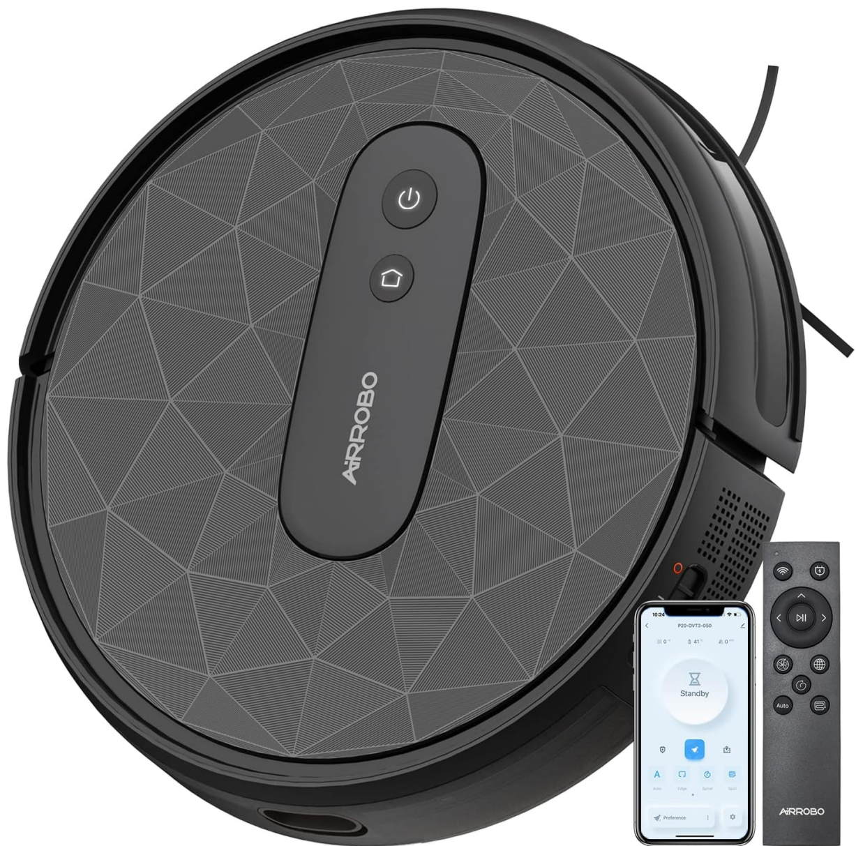
Figure 1: AIRROBO P20 Robot Vacuum Cleaner with remote control and smartphone app interface.