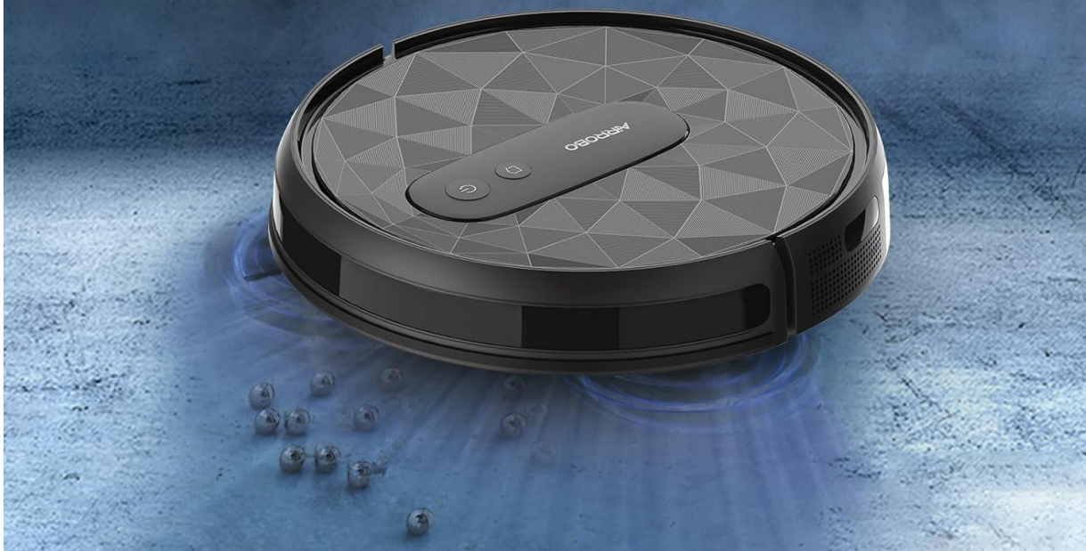
Figure 5: Adjustable suction power up to 2800Pa, ideal for pet hair, hard floors, and low-pile carpets. Adjust suction power via the app or remote control to suit different cleaning needs: