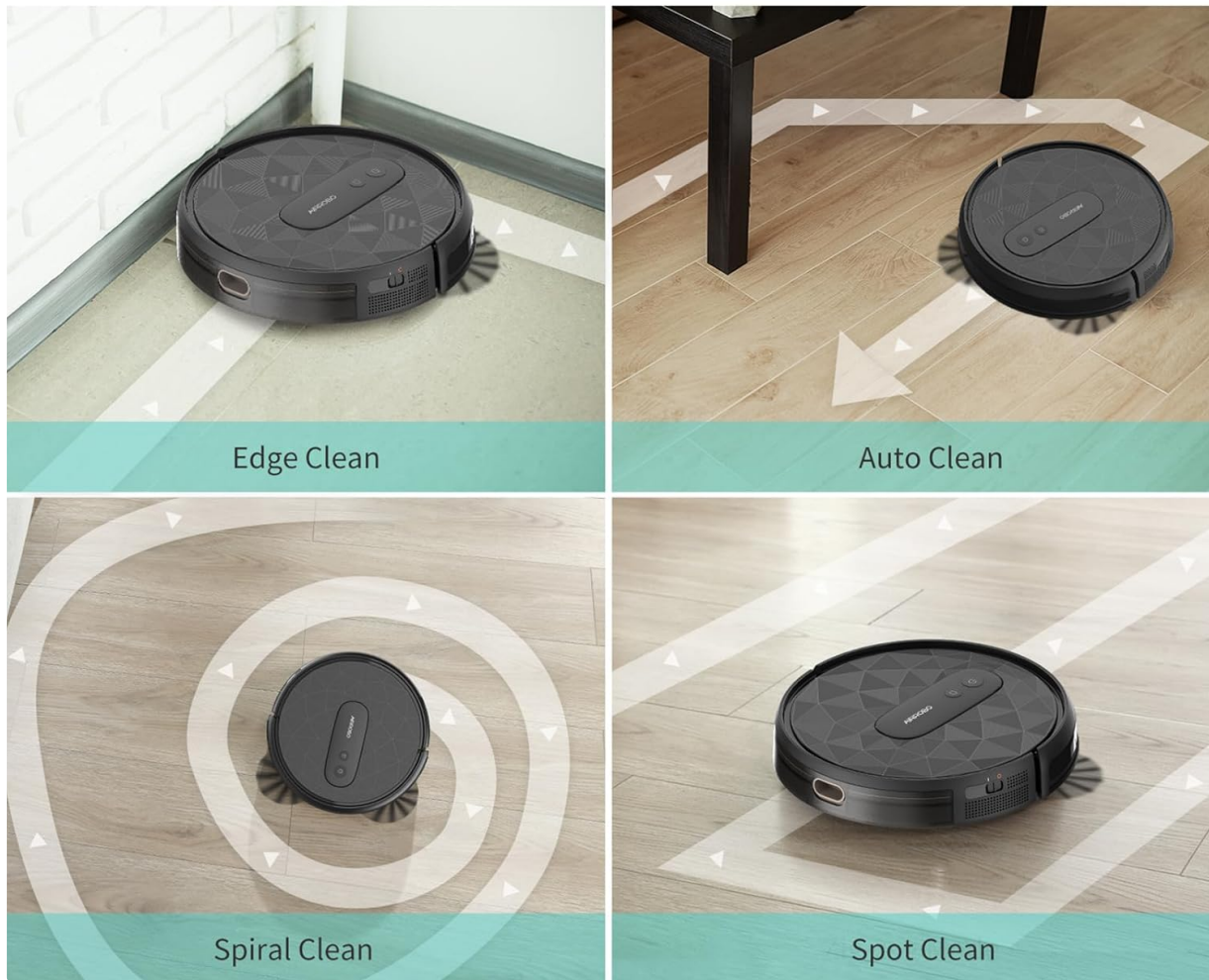
Figure 4: The AIRROBO P20 supports four distinct cleaning modes for comprehensive coverage.