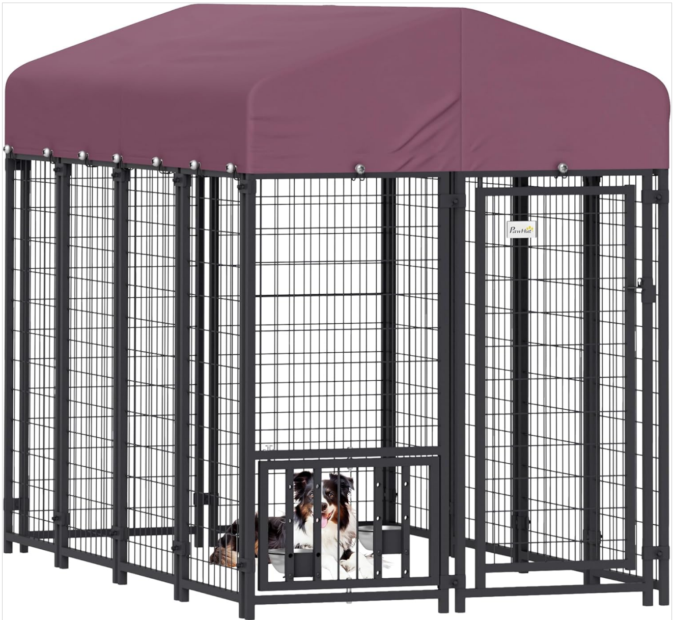
Image: The complete PawHut Outdoor Dog Kennel, showcasing its welded wire construction, red waterproof cover, and integrated feeding station.