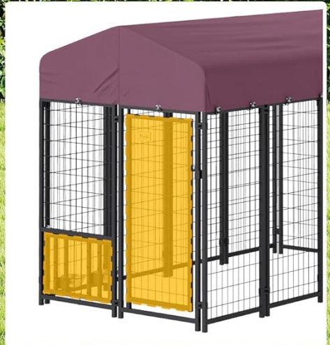
On the front side