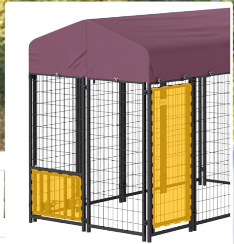
On the both side