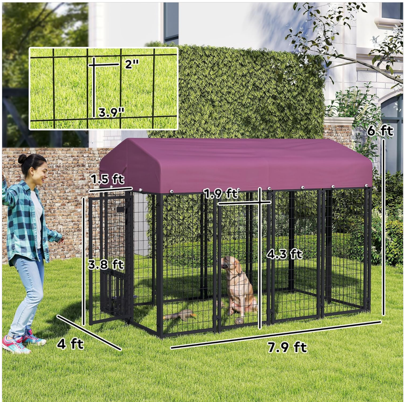
Image: A diagram illustrating the overall dimensions of the kennel, including length, width, height, and specific measurements for the gate and wire mesh.