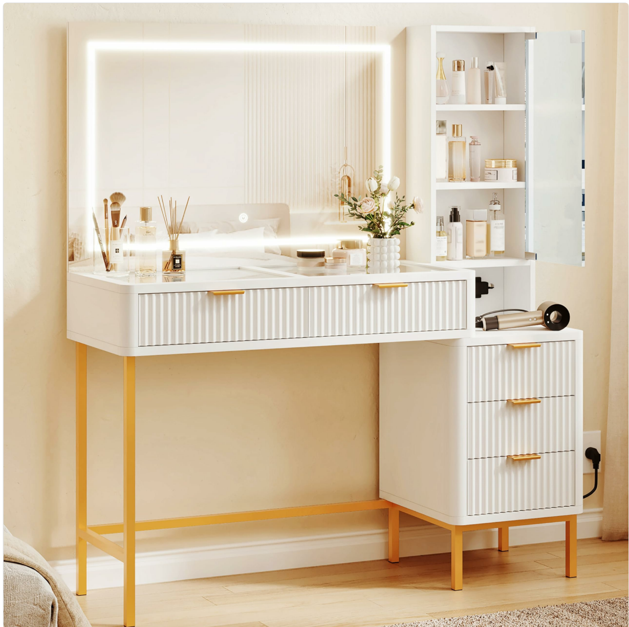
Image: The EROMMY 48-inch Fluted Vanity Desk, showcasing its elegant design with a large lighted mirror, multiple drawers, and a side storage cabinet.