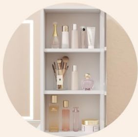
Side Cabinet With Glass Door