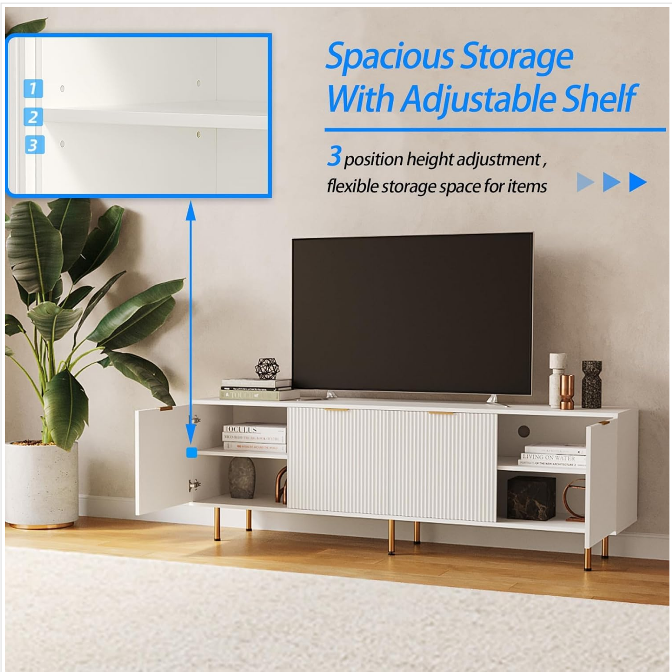
Figure 3: Interior view showcasing the adjustable shelves and spacious storage compartments.