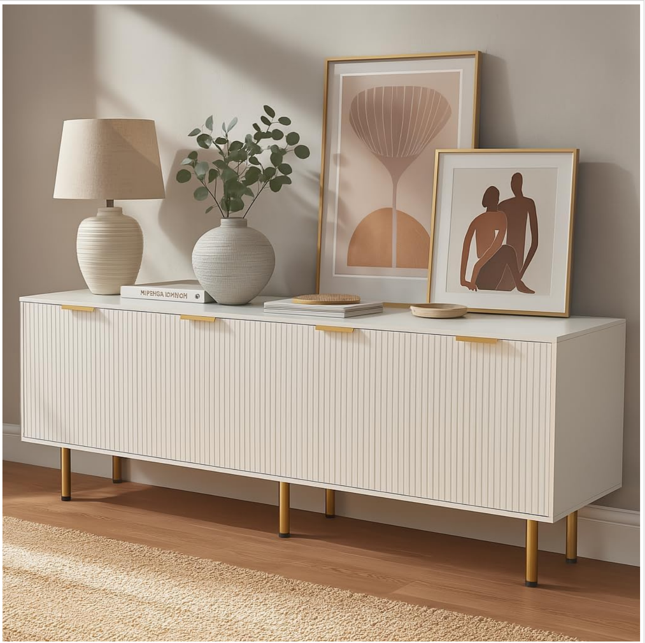
Figure 1: Front view of the assembled Furniwood Mid Century Modern TV Stand in white, featuring gold handles and legs, with decorative items on top.