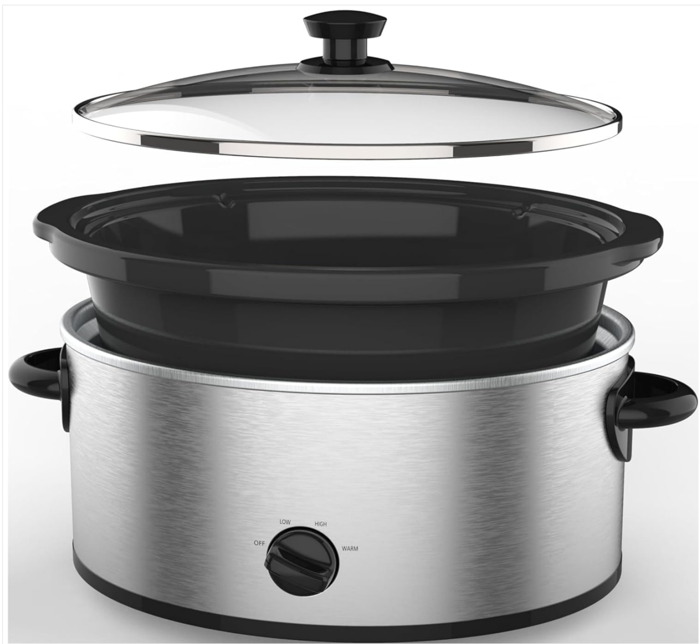
Image: An exploded view of the slow cooker, showing the heating base, the removable stoneware crock, and the tempered glass lid separated.