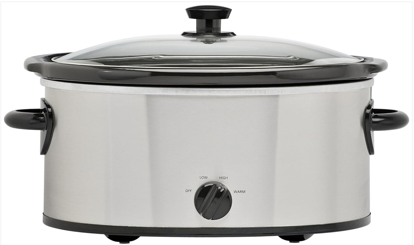
Image: Front view of the Mainstays 6QT Slow Cooker in Stainless Steel, showing the control knob with OFF, LOW, HIGH, and WARM settings.

Thank you for purchasing the Mainstays 6QT Slow Cooker. This appliance is designed to simplify meal preparation by slow-cooking a variety of dishes, from meats and stews to soups and chili, with minimal effort. Please read this instruction manual thoroughly before first use to ensure safe and optimal operation.