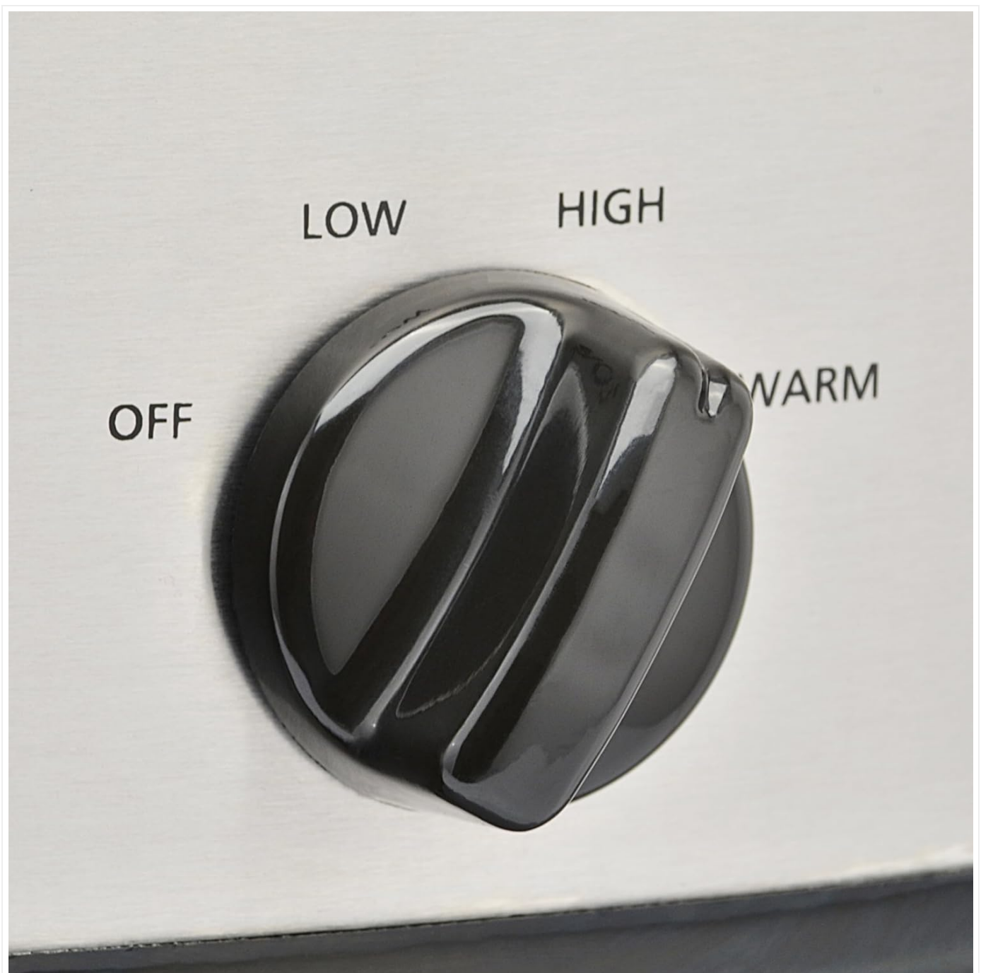
Image: A close-up view of the control knob on the slow cooker, clearly showing the "OFF", "LOW", "HIGH", and "WARM" settings.