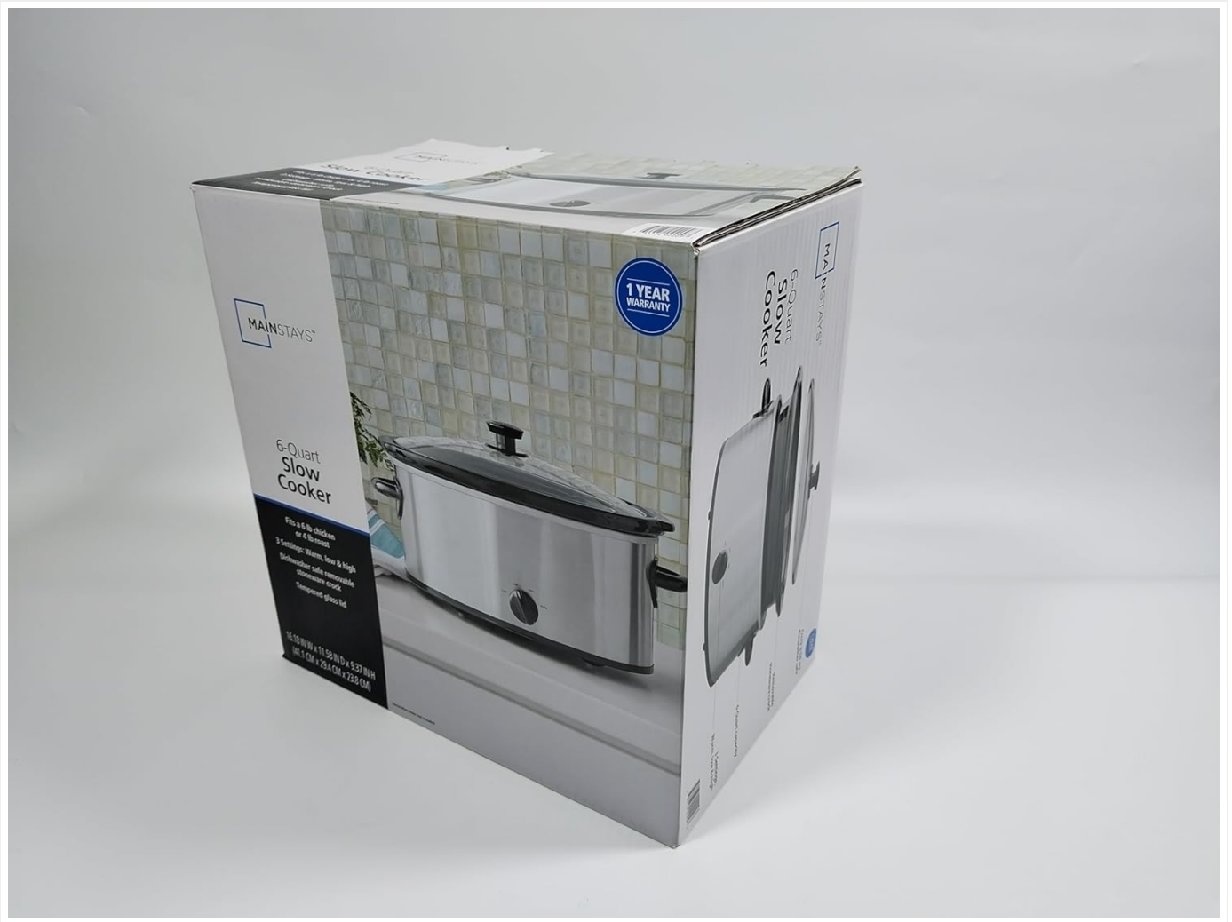
Image: The retail packaging box for the Mainstays 6QT Slow Cooker, indicating a "1 YEAR WARRANTY" on the front.