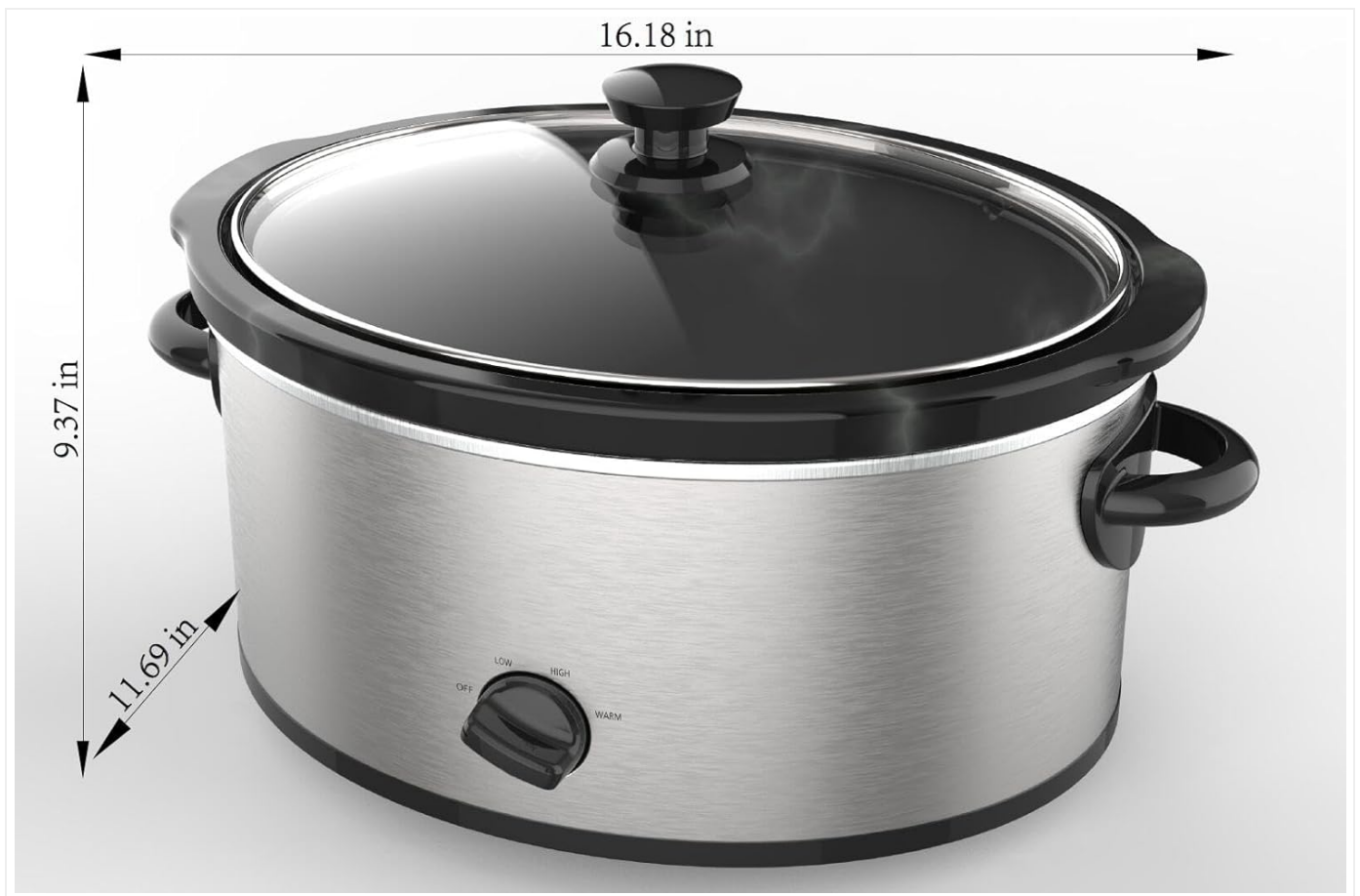
Image: Diagram showing the approximate overall dimensions of the Mainstays 6QT Slow Cooker: 16.18 inches in length, 11.69 inches in depth, and 9.37 inches in height.