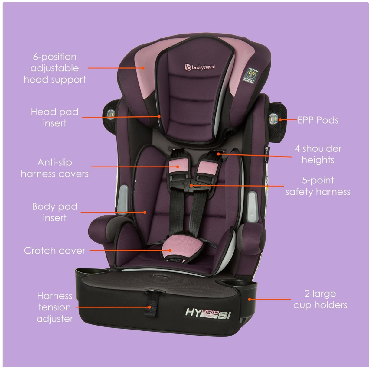
Figure 3.1: Key features of the Baby Trend Hybrid SI car seat.