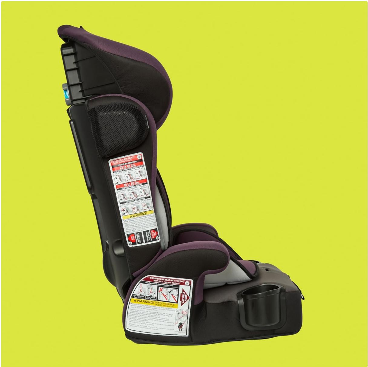
Figure 6.3: Anti-slip harness covers for comfort.