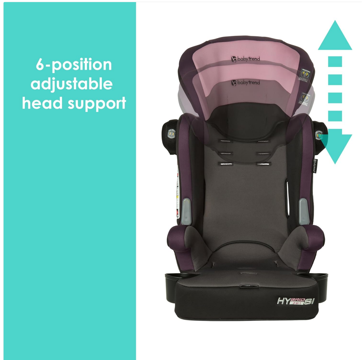
Figure 6.1: 6-position adjustable head support.

squeeze or press, and slide the headrest up or down to the desired position. Ensure it clicks securely into place.