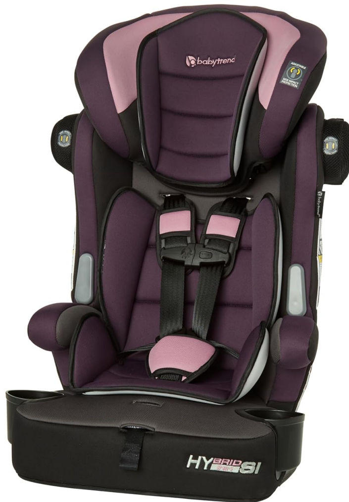
Figure 1.1: Baby Trend Hybrid SI 3-in-1 Combination Booster Car Seat.