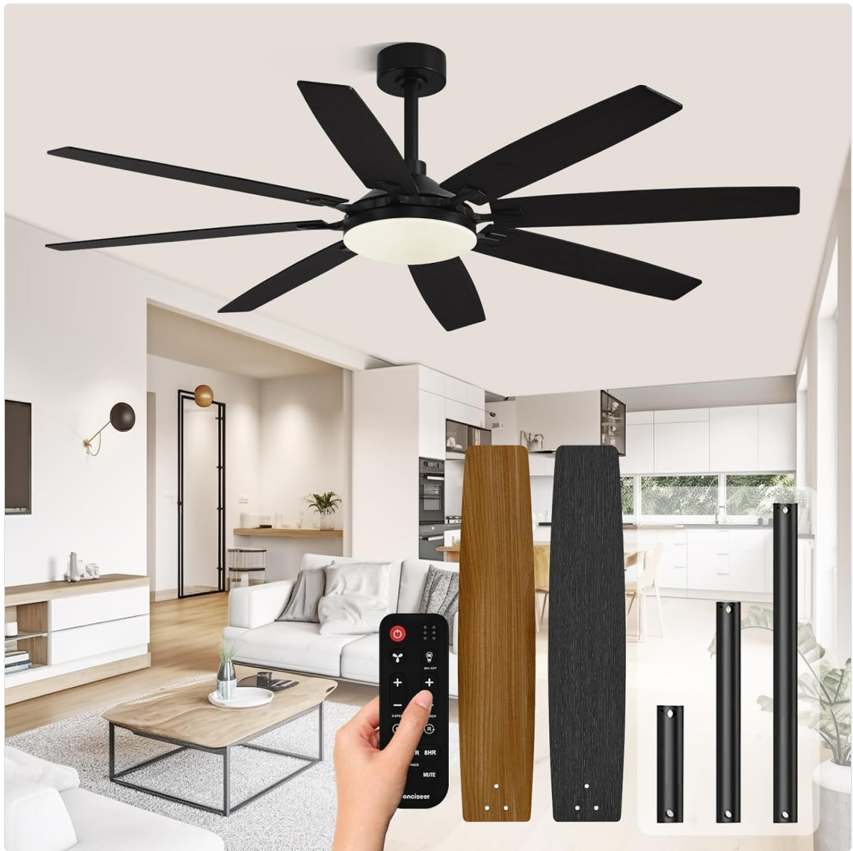
Figure 1: Overview of the Conciseer 72 Inch Ceiling Fan with Light and Remote.