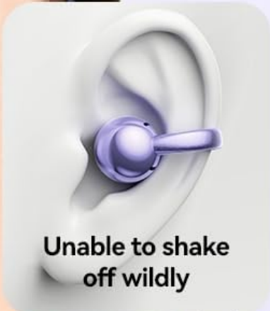
Image: Illustrates the "Open ear Comfortable listening" design. The text emphasizes that the earbuds are "Lightweight, not tiring to wear for a long time" and offer "Better protection of ear canal health." An accompanying graphic shows an ear with the earbud, noting it's "Unable to shake off wildly."

Lightweight, not tiring to wear for a long time Better protection of ear canal health