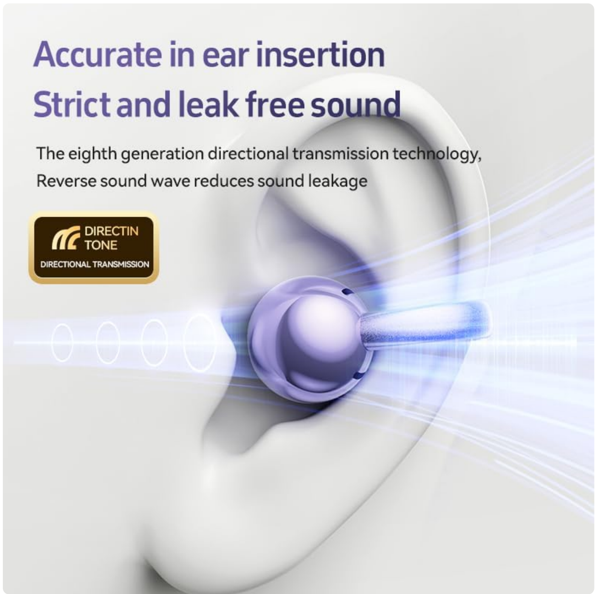
Image: A close-up graphic of an ear with the earbud, demonstrating "Accurate in ear insertion, Strict and leak free sound." It highlights "The eighth generation directional transmission technology" and how "Reverse sound wave reduces sound leakage," with a "DIRECTIN TONE Directional transmission" logo.