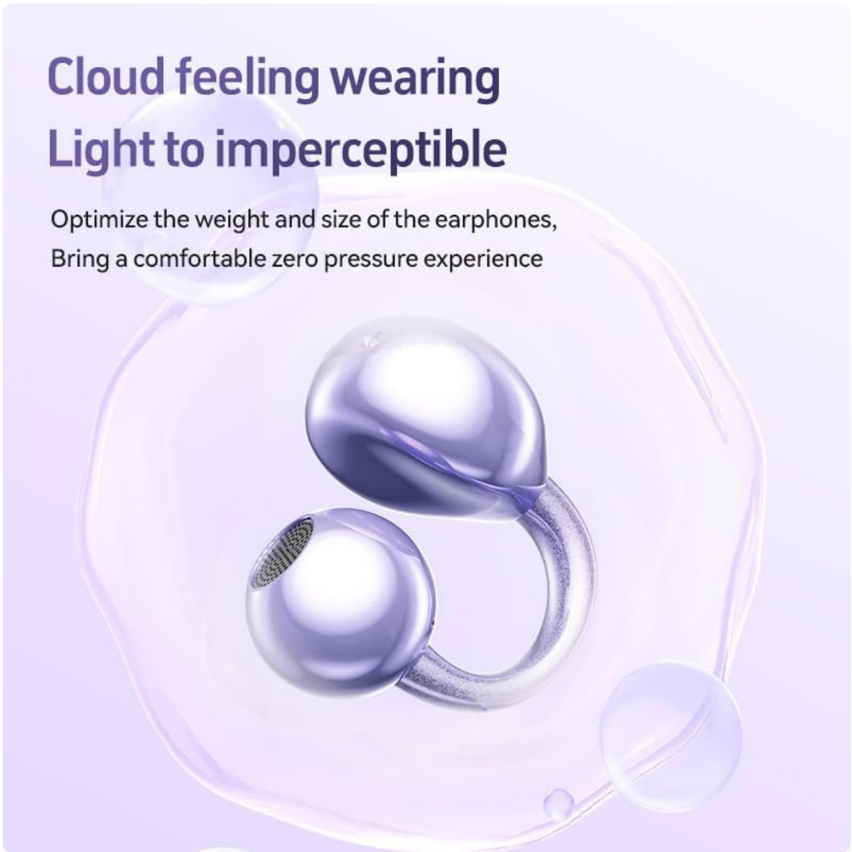
Image: A stylized image of the two earbuds floating in a bubble-like environment, conveying a "Cloud feeling wearing, Light to imperceptible" experience. The description states, "Optimize the weight and size of the earphones, Bring a comfortable zero pressure experience."

Optimize the weight and size of the earphones, Bring a comfortable zero pressure experience