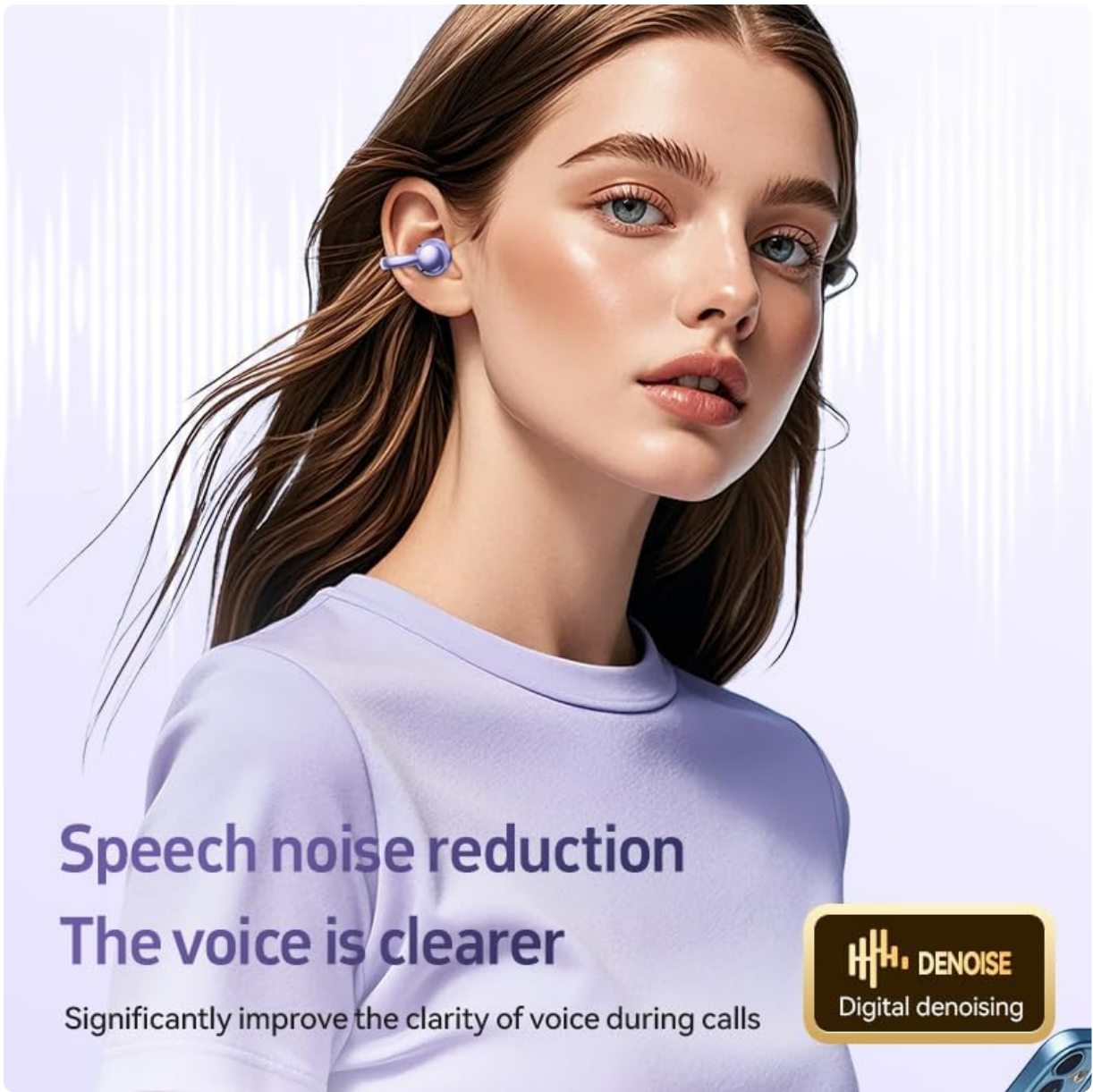
Image: A person wearing one of the purple earbuds, demonstrating the speech noise reduction capability. Text indicates "Speech noise reduction, The voice is clearer," and highlights "DENOISE Digital denoising" to significantly improve voice clarity during calls.