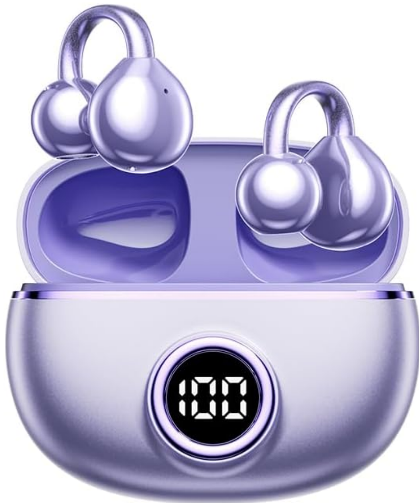
Image: The AI Translation Wireless Earbuds (M97) resting in their metallic purple charging case. The case features a prominent LED digital display on the front, showing "100" indicating a full charge. The earbuds themselves are a matching metallic purple, designed with a clip-on style.