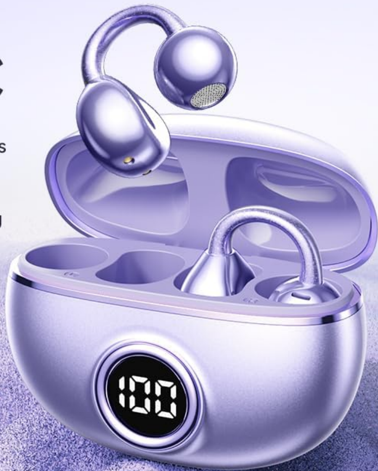
Image: A visual representation highlighting the "Wireless TWS Open Music" features of the earbuds. Key benefits shown are Spatial sound effects, Wireless 5.4 connectivity, and Comfortable wearing. Insets detail "SSOVP Extreme" for enhanced sound and "Polumer diaphragm" for high fidelity audio.